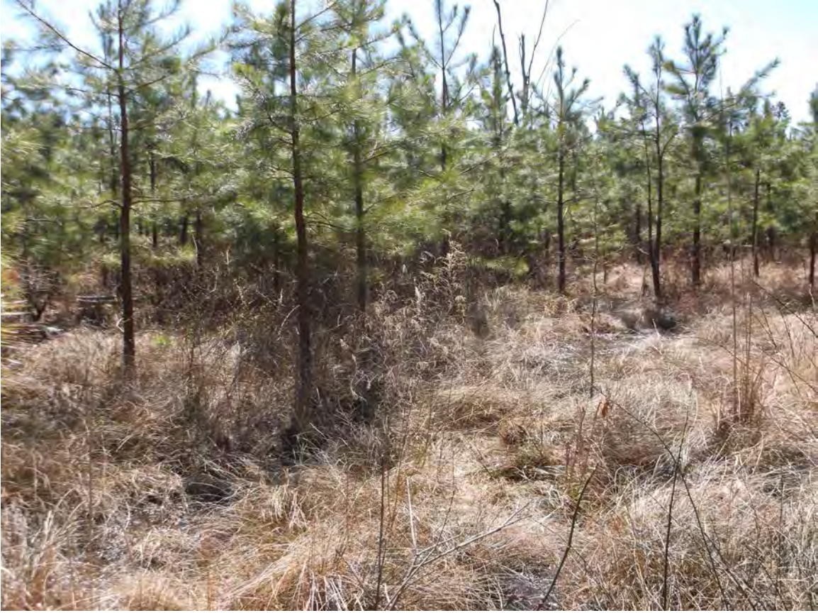
Wetland data point wsop001s_w facing southeast.