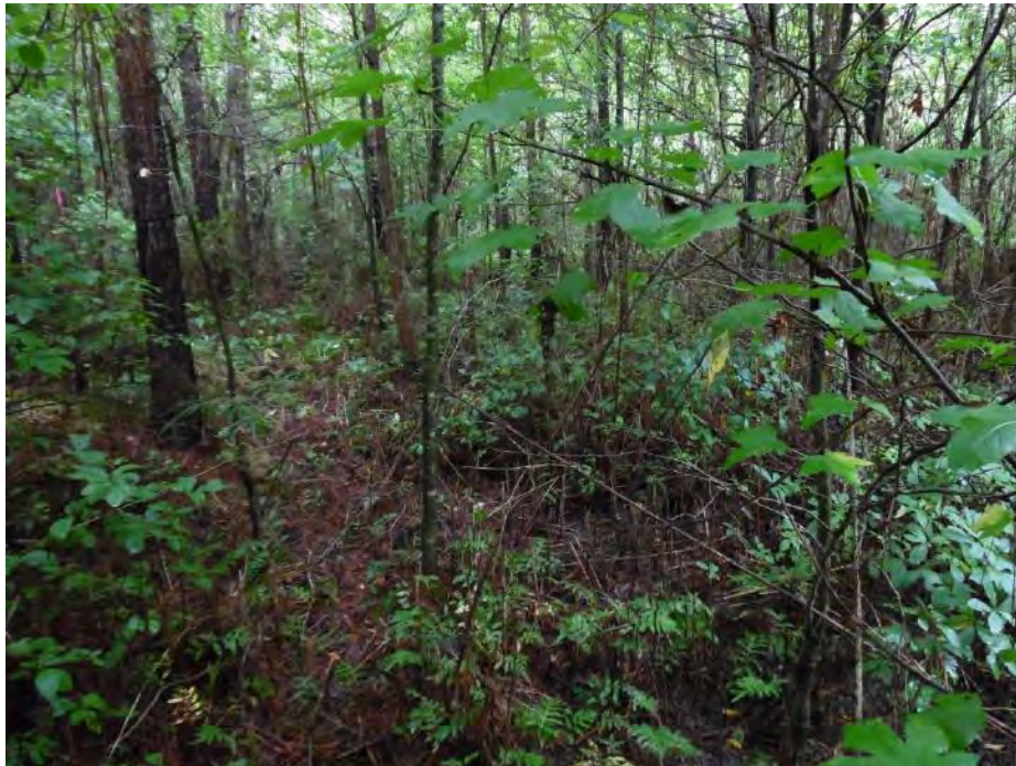
Wetland data point wsol016f_w facing east