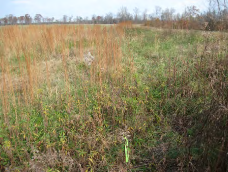
Photo 1 Wetland data point WSOA017e_w facing northeast