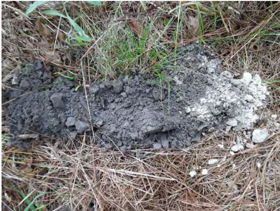
Upland data point wsol017_u soil sample