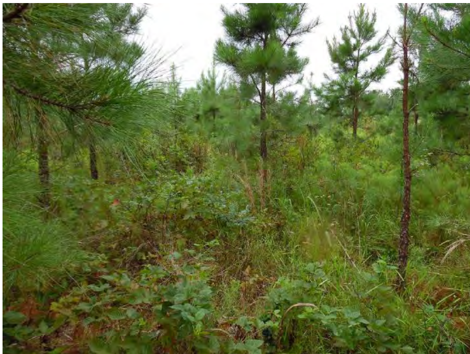
Wetland data point wsol024s_w facing south