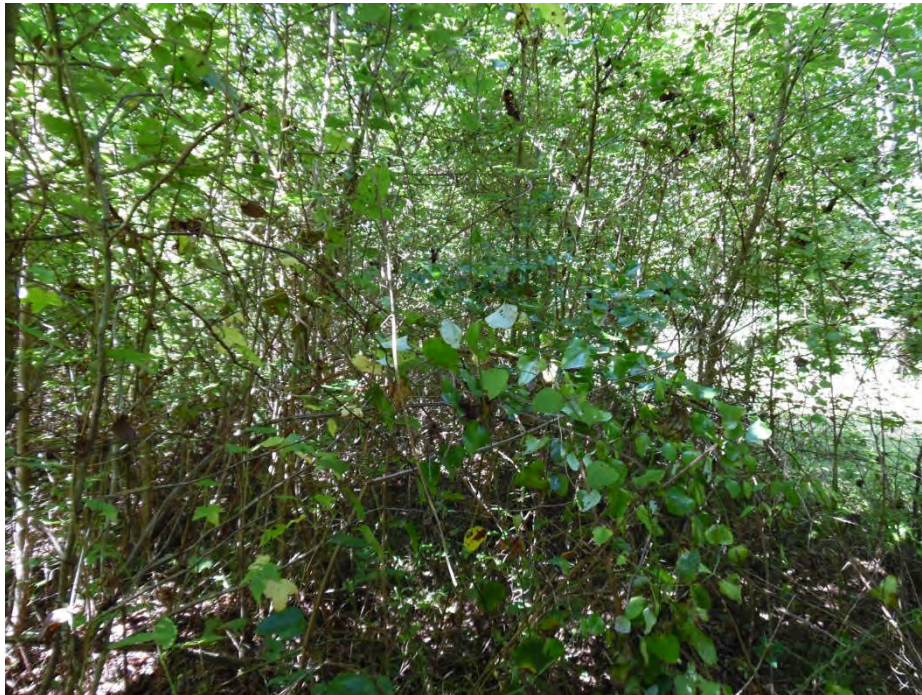
Upland data point wsol028_u facing north