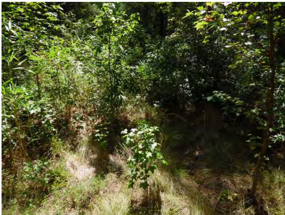
Wetland data point wsol018f_w facing south