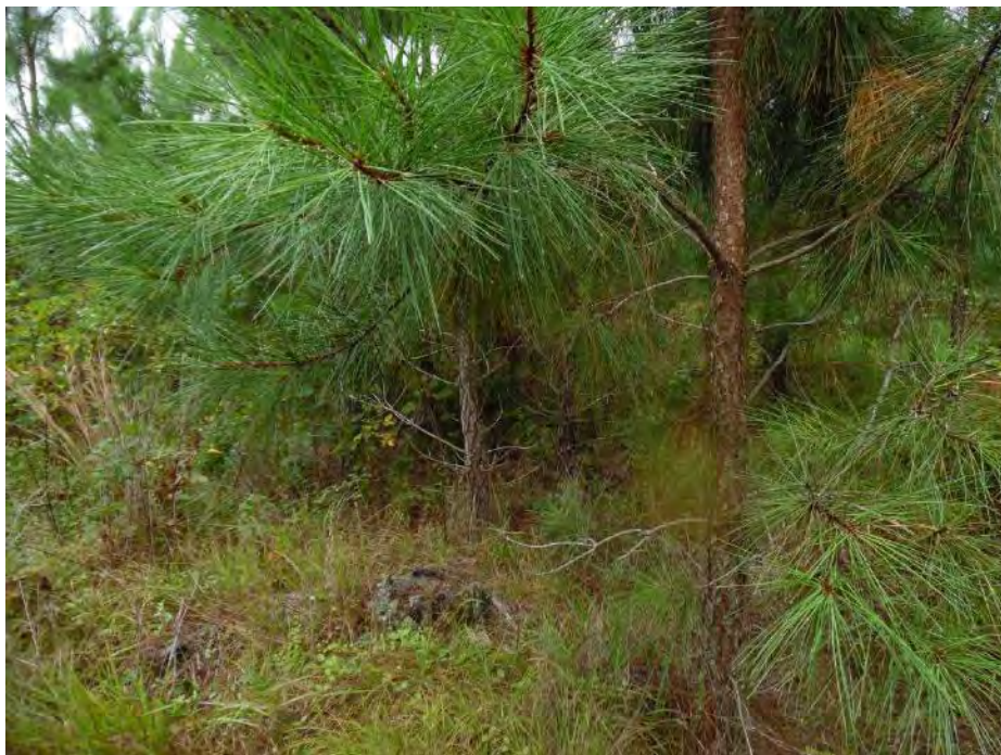
Upland data point wsol024_u facing west