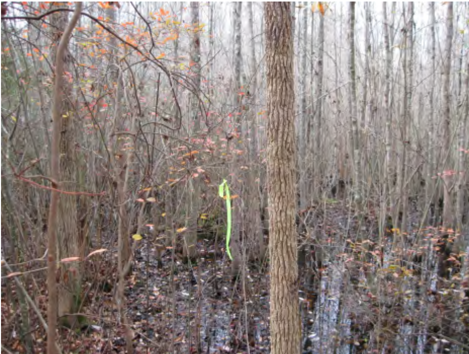
Photo 2 Wetland data point wsoa023f_w facing west