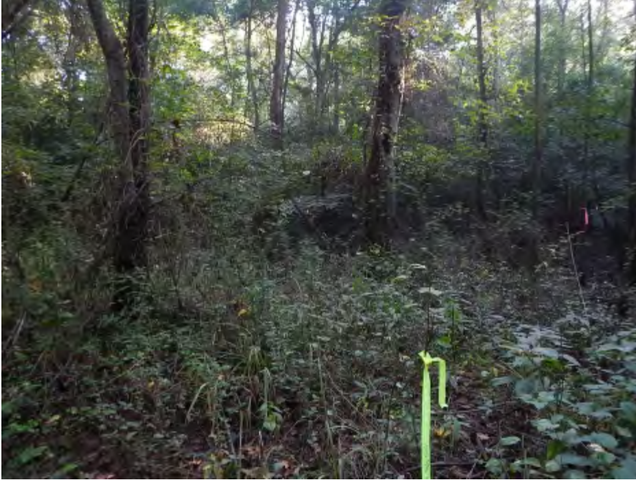
Photo 1 Upland data point WSOA007_u facing east