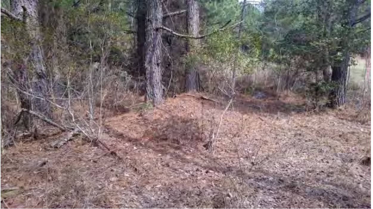
Photo 1 Upland data point wsoc009_u facing northeast