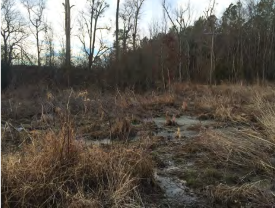
Photo 1 Wetland data point WSOA033e_w facing south