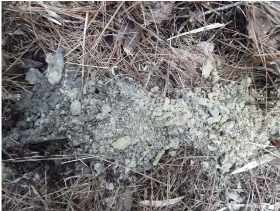
Upland data point wsol019_u soil sample