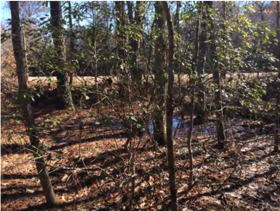
Photo 2 Wetland data point wsoa029f_w facing south