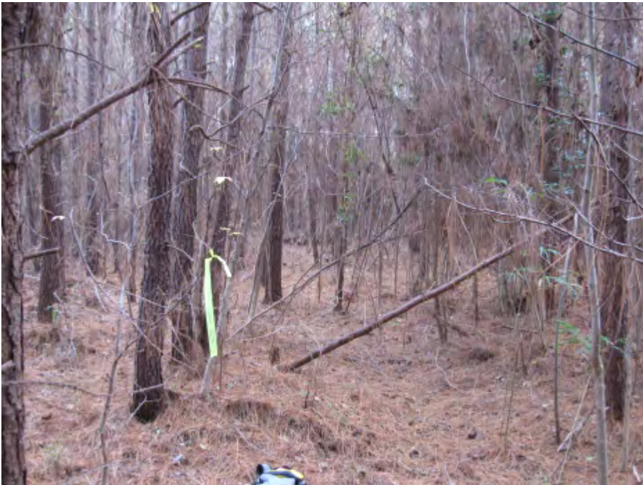
Photo 2 Upland data point WSOA022_u facing east