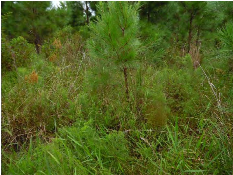
Wetland data point wsol024s_w facing east