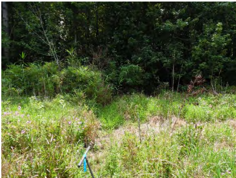
Wetland data point wsol014e_w facing south