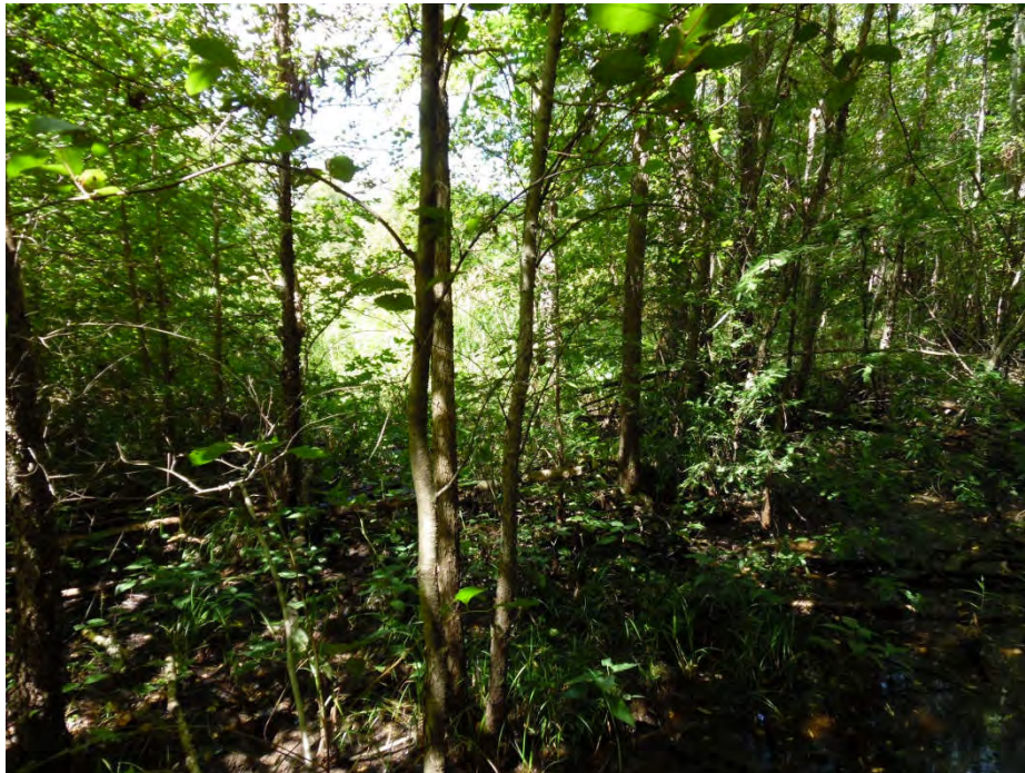
Wetland data point wsol030f_w facing north