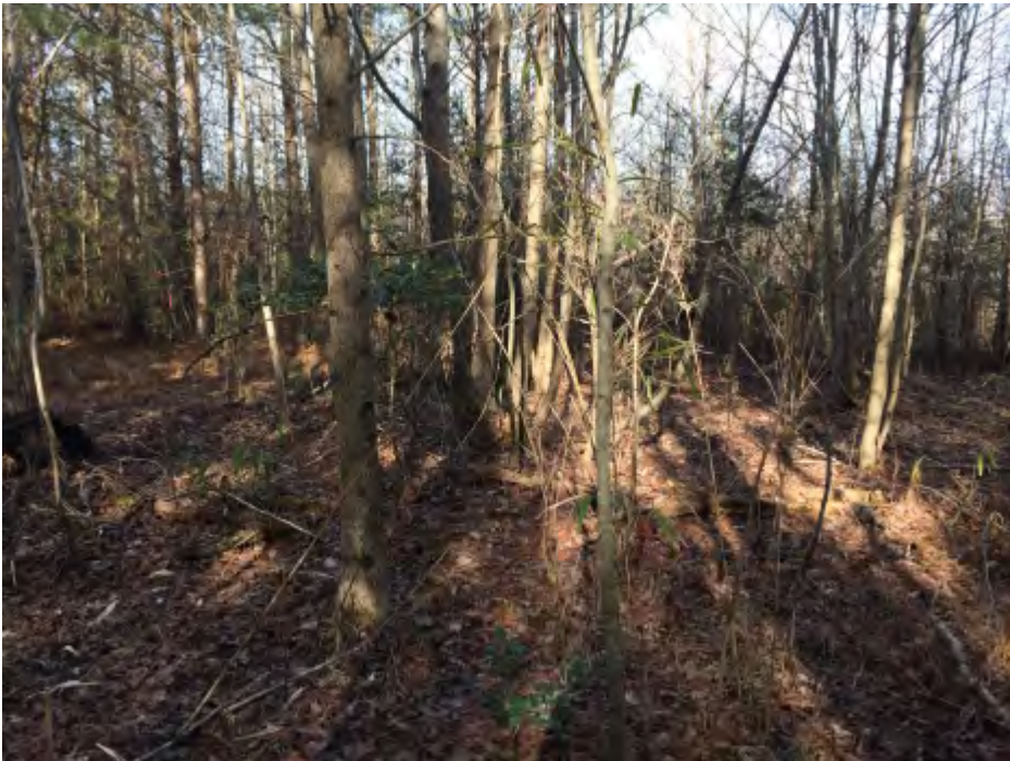
Photo 2 Upland data point wsoa033_u facing west