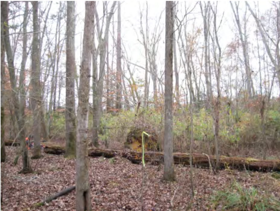
Photo 2 Wetland data point WSOA024f_w facing west