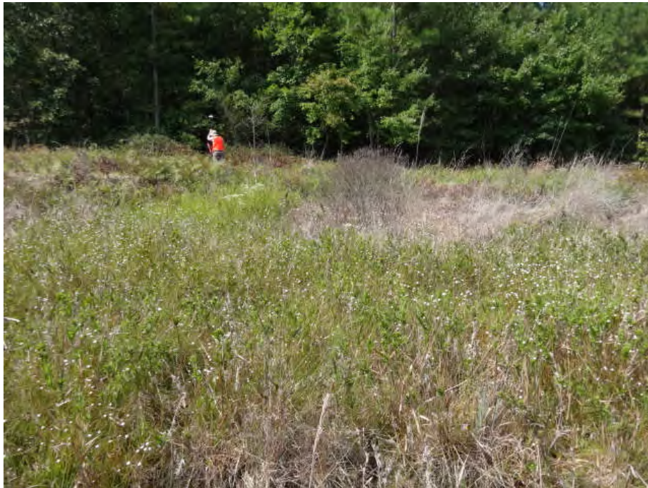
Wetland data point wsol012e_w facing North