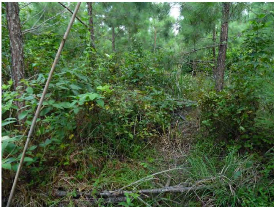
Wetland data point wsol017f_w facing west