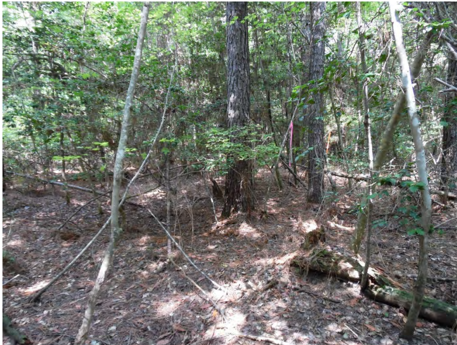
Wetland data point wsol034f_w facing east