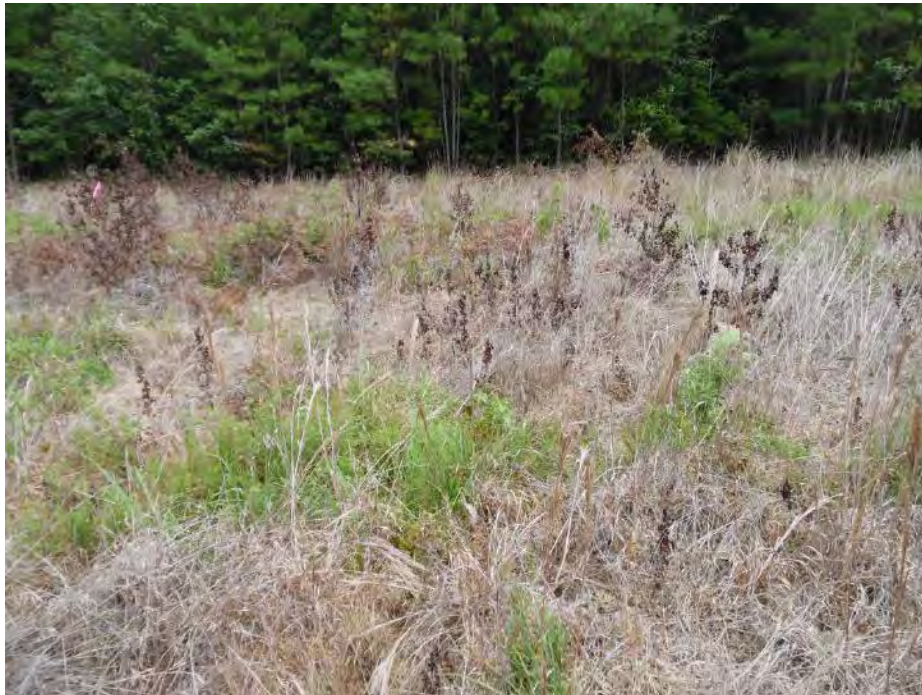
Wetland data point wsol013e_w facing north