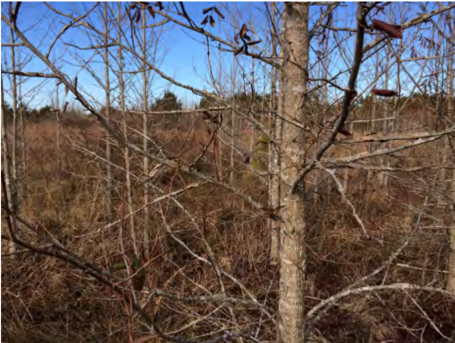
Photo 2 Upland data point wsoa026_u facing west