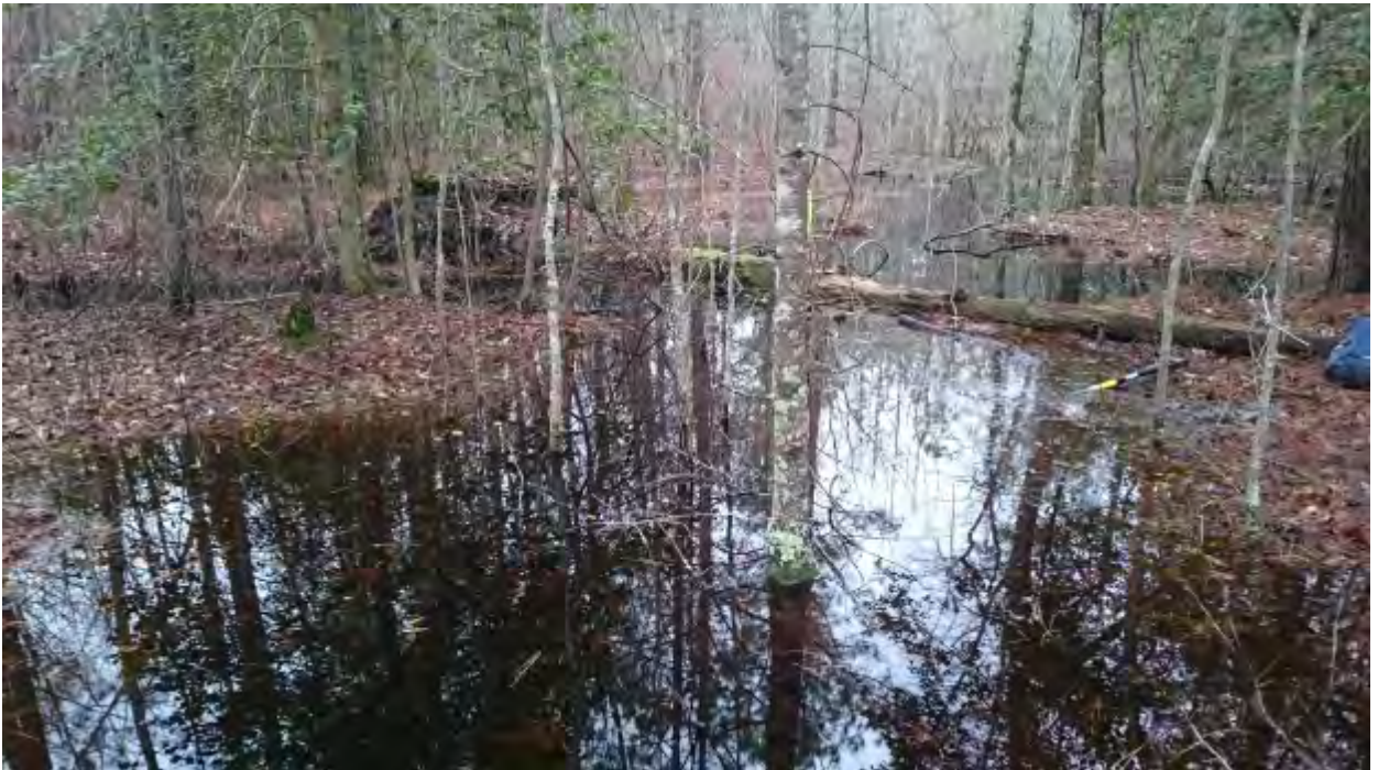
Photo 2 Wetland data point wsoc017f_w facing southwest