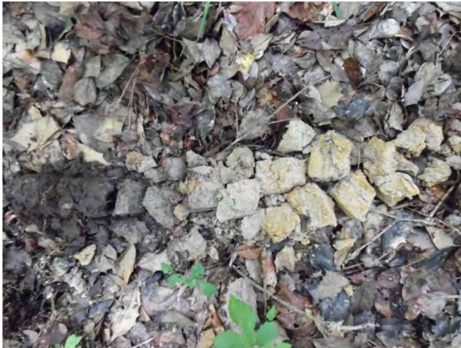
Wetland data point wsol013f_w soil sample