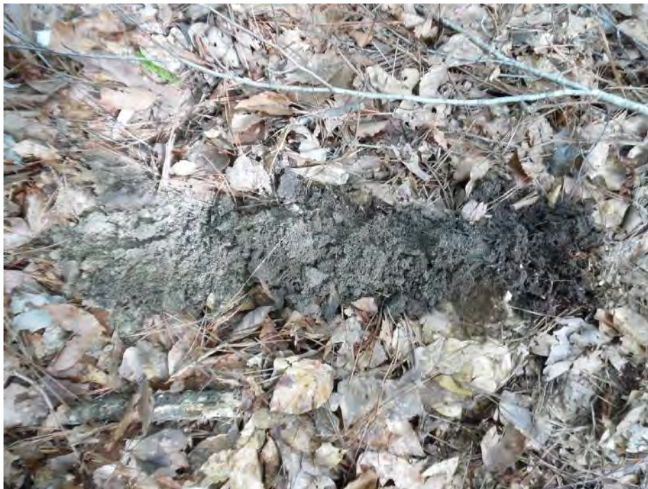
Upland data point wsol022_u soil sample