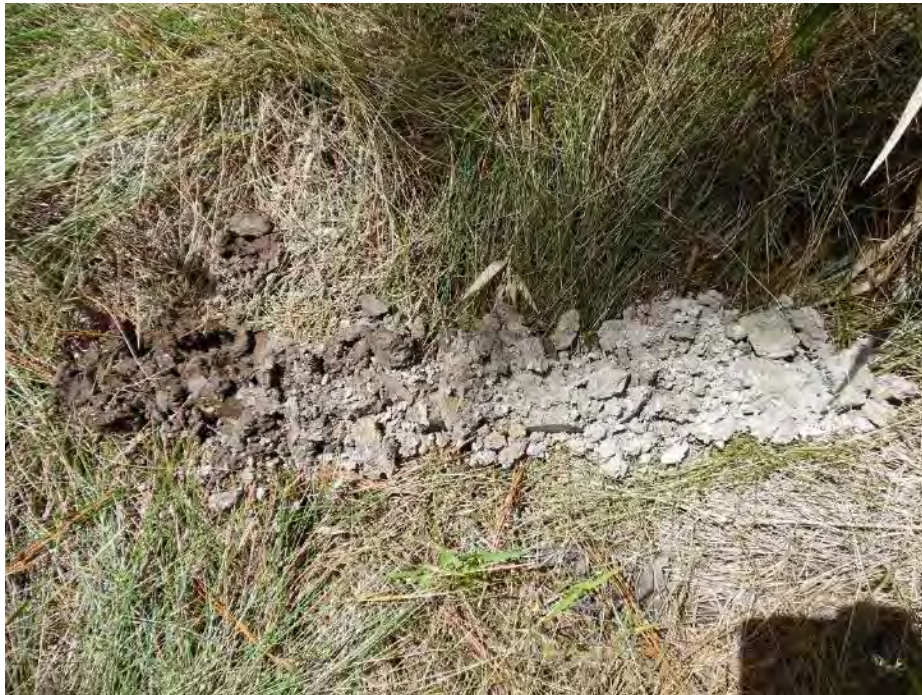
Wetland data point wsol018f_w soil sample