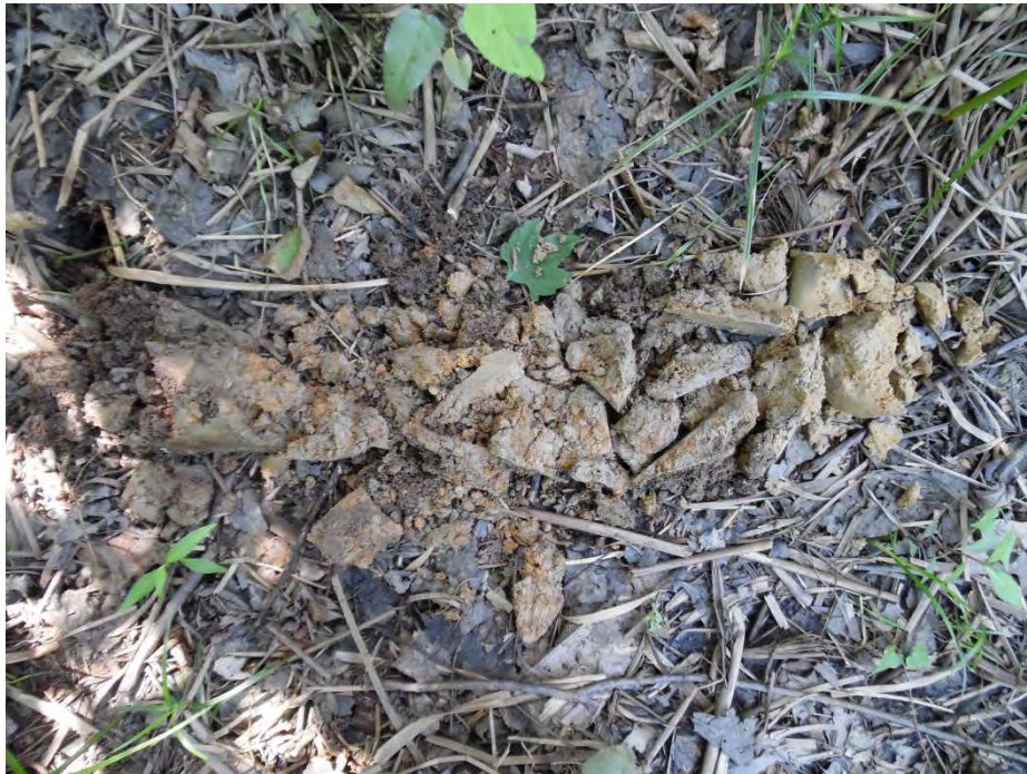
Wetland data point wsol028s_w soil sample