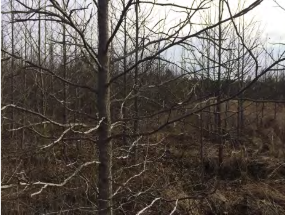
Photo 1 Upland data point wsoa026_u facing east