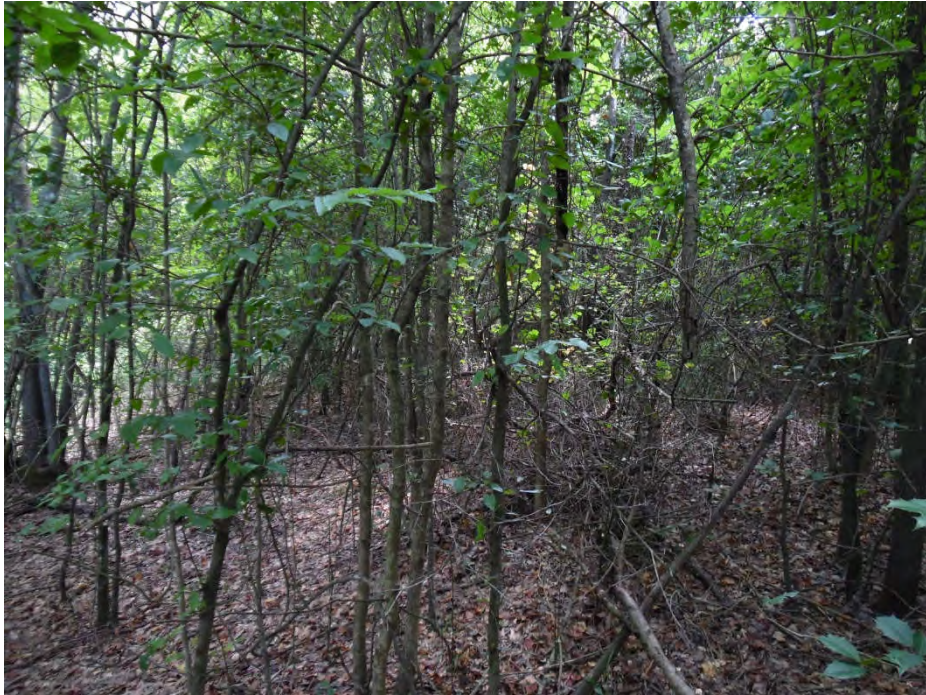
Upland data point wsol030_u facing south