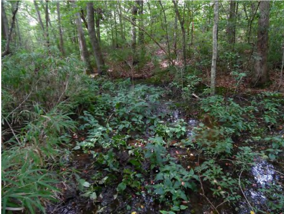
Wetland data point wsol022f_w facing north