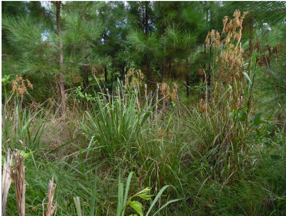
Wetland data point wsol025s_w facing north