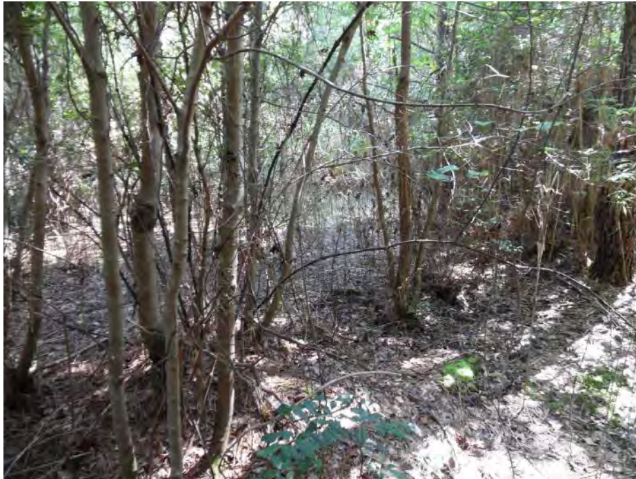
Wetland data point wsol020f_w facing east