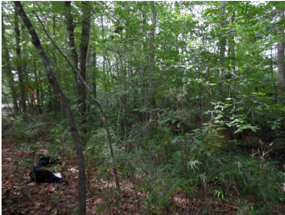
Upland data point wsol022_u facing north