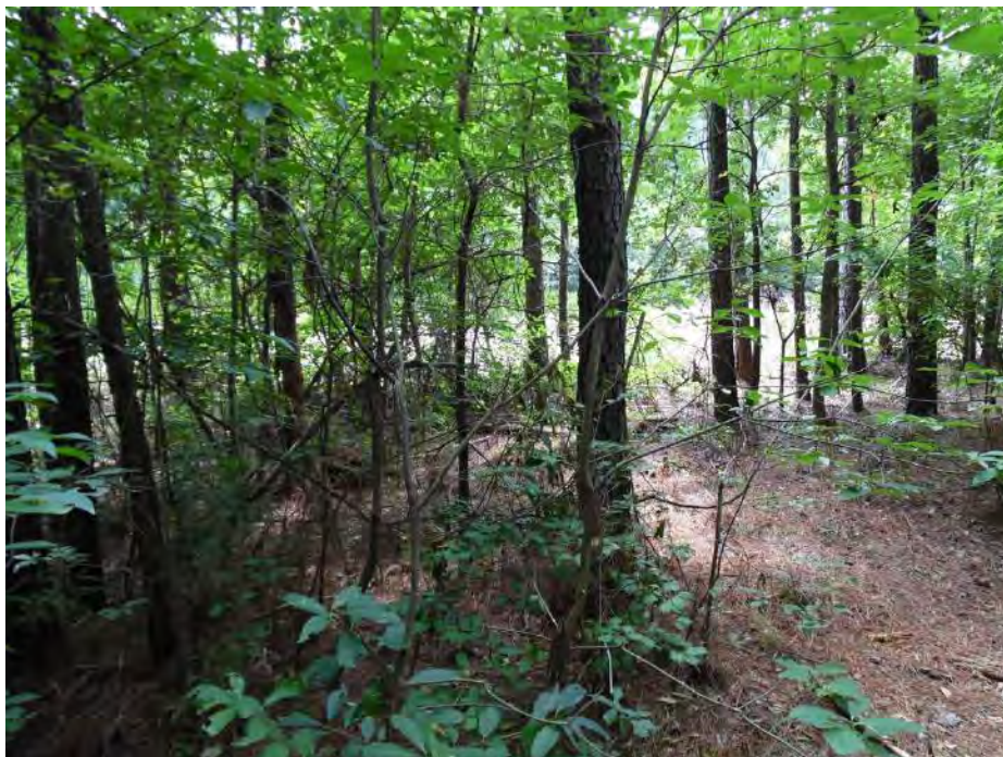
Upland data point wsol014_u facing south