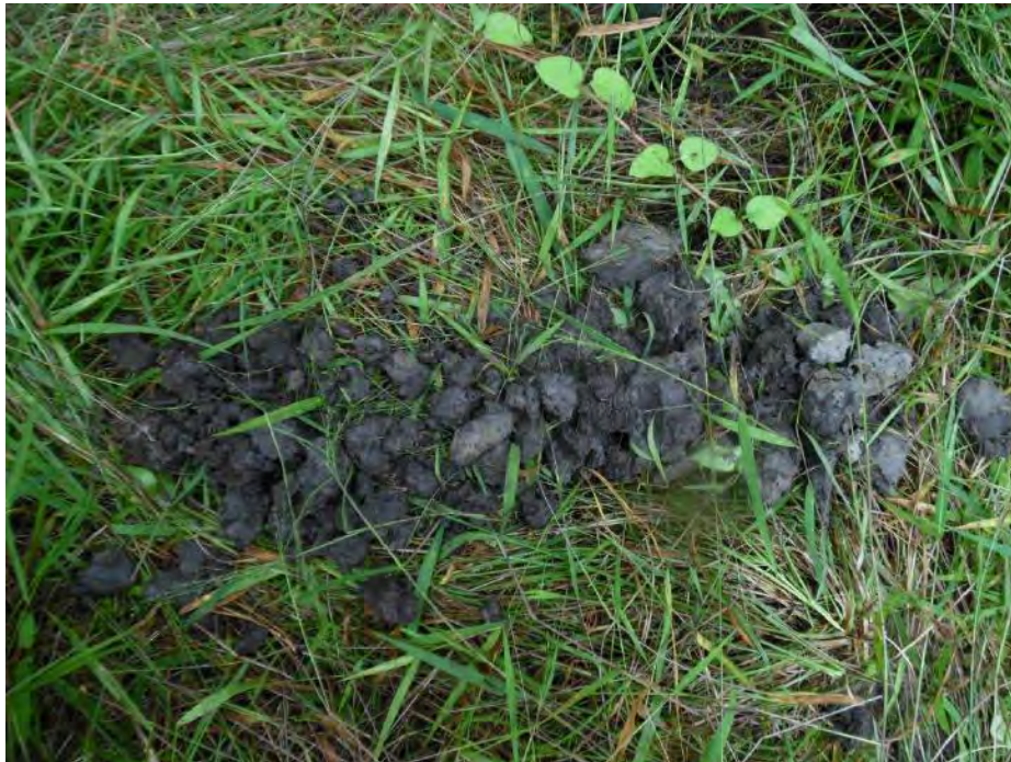
Wetland data point wsol024s_w soil sample