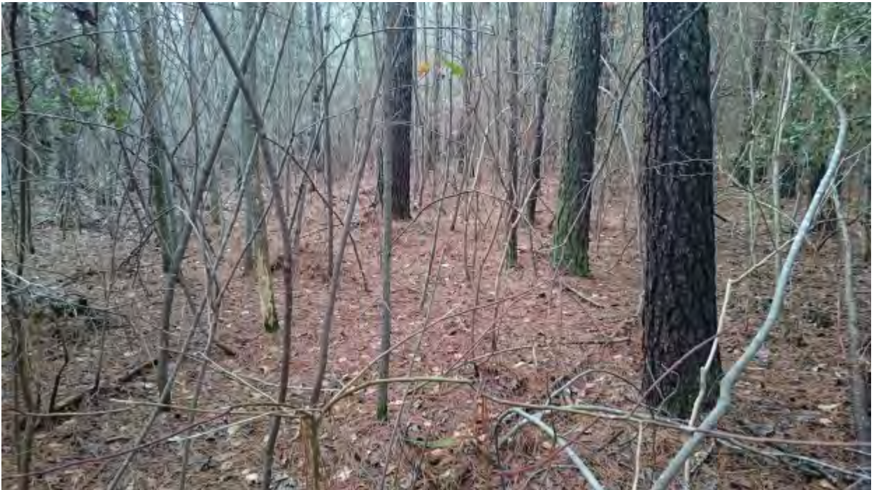
Photo 2 Upland data point wsoc017_u facing south