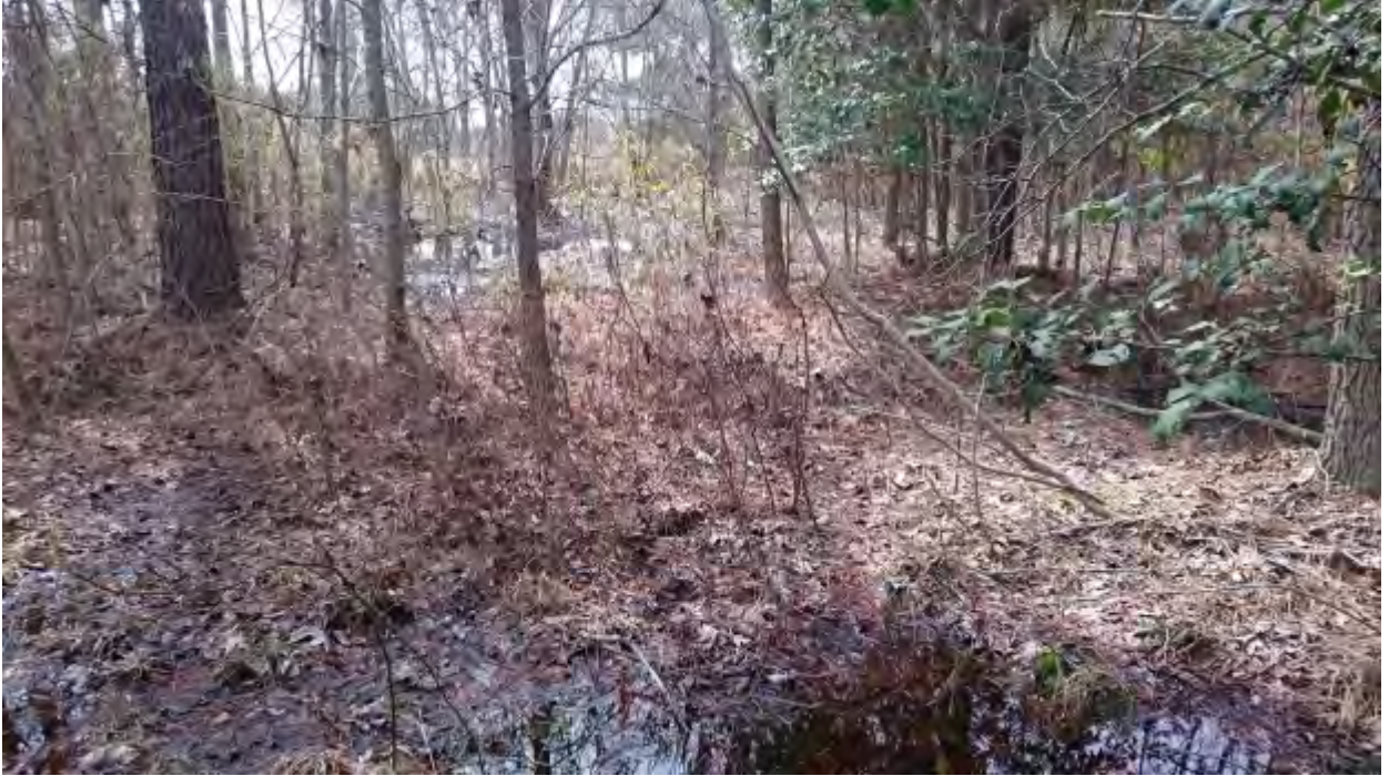
Photo 1 Wetland data point wsoc009f_w facing southwest