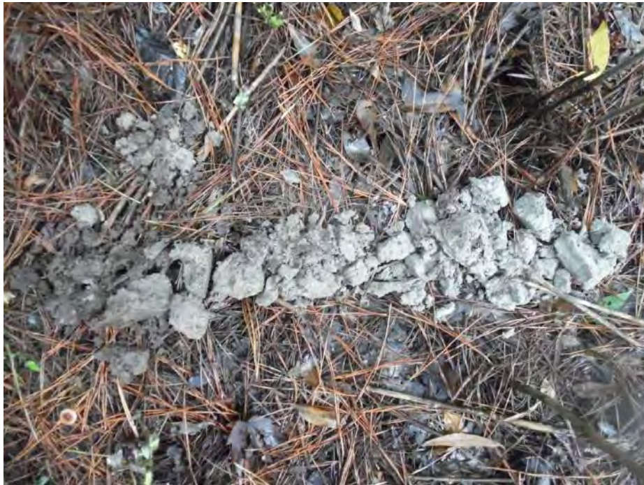
Wetland data point wsol016f_w soil sample