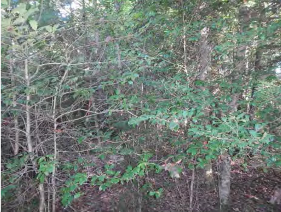
Photo 1 Upland data point WSOA002_u facing north