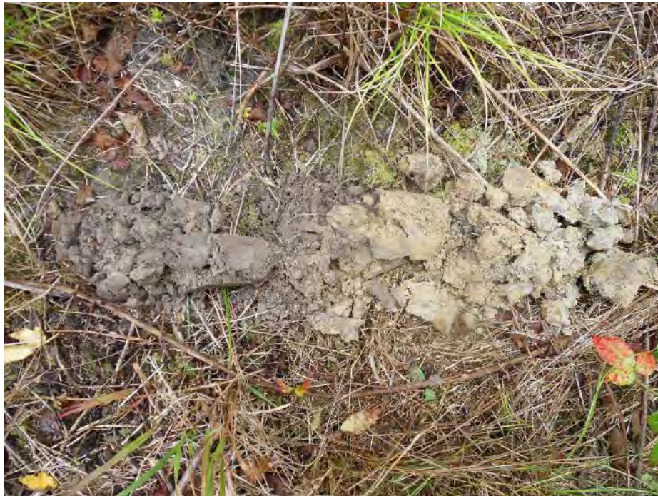
Upland data point wsol024_u soil sample