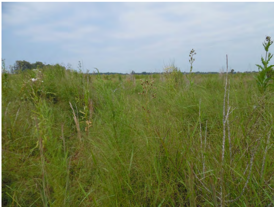
Wetland data point wsol033e_w facing west