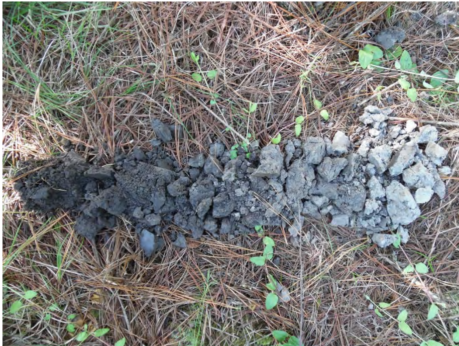
Upland data point wsol025_u soil sample