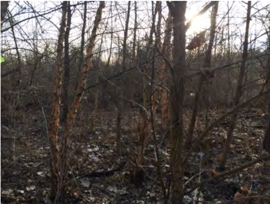
Photo 2 Wetland data point wsoa033f_w facing east