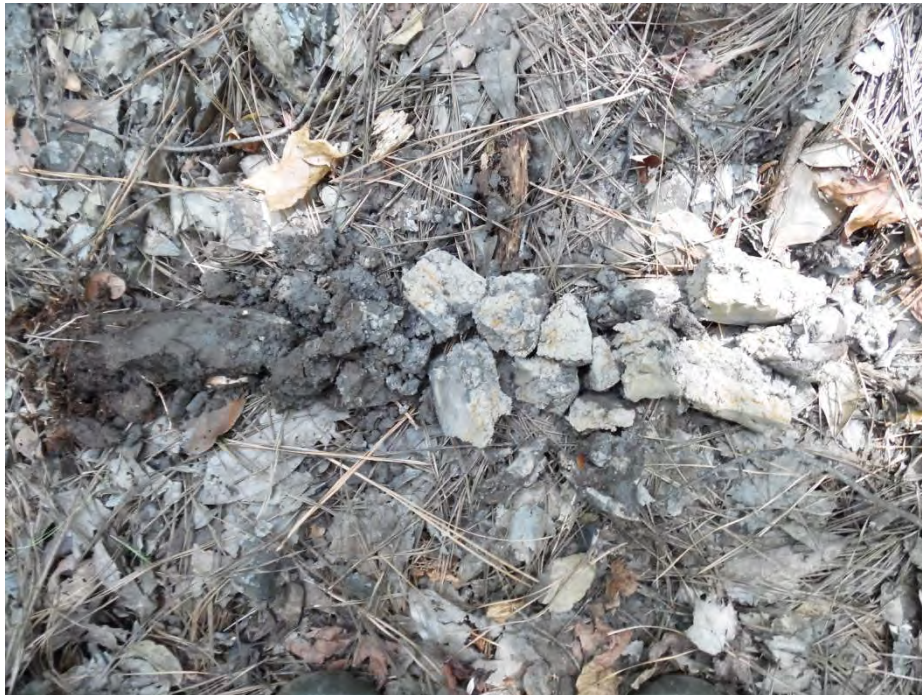
Wetland data point wsol034f_w soil sample