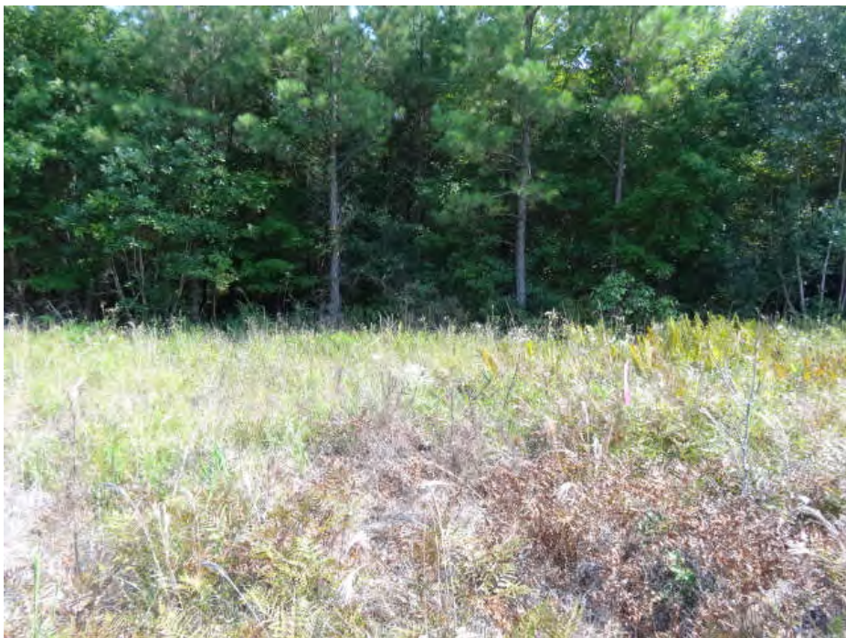
Upland data point wsol012_u facing South