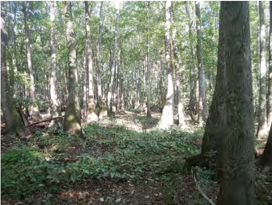
Photo 2 Wetland data point WSOA001f_w facing north