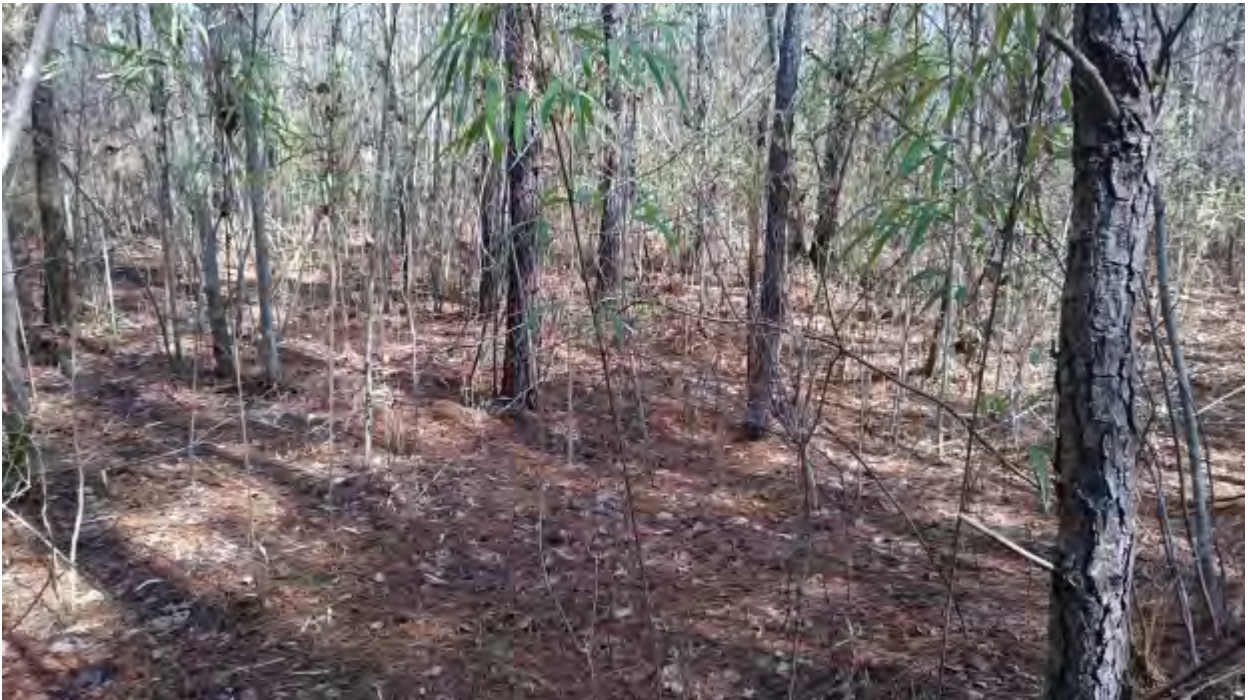
Photo 2 Upland data point wsoc008_u facing north