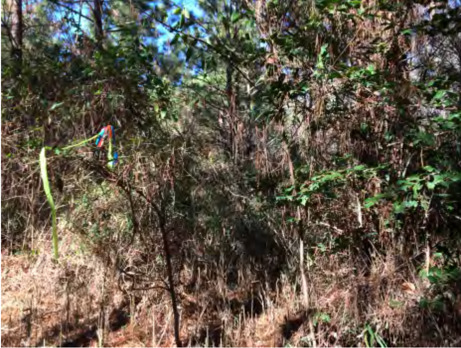
Photo 1 Wetland data point wsoa028f_w facing north