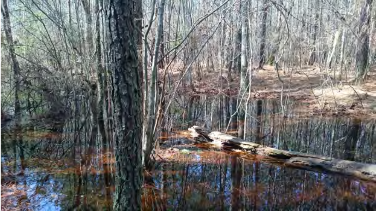
Photo 1 Wetland data point wsoc008f_w facing southwest