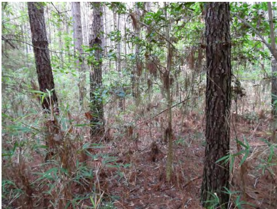
Upland data point wsol019_u facing south