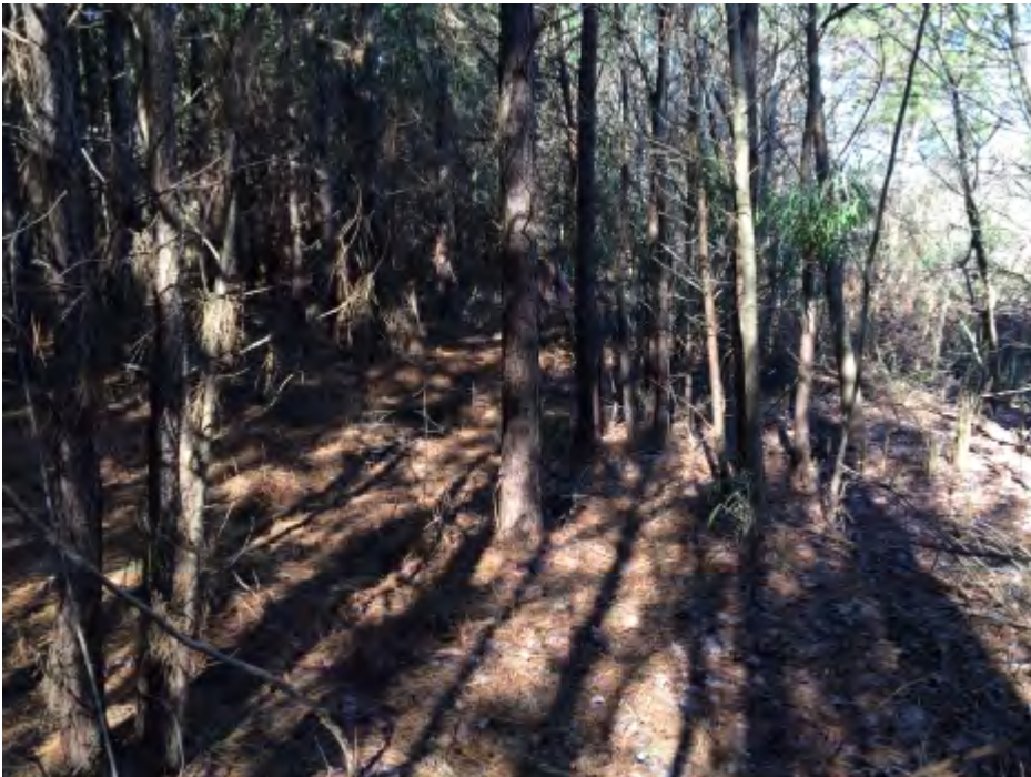
Photo 2 Upland data point wsoa027_u facing west