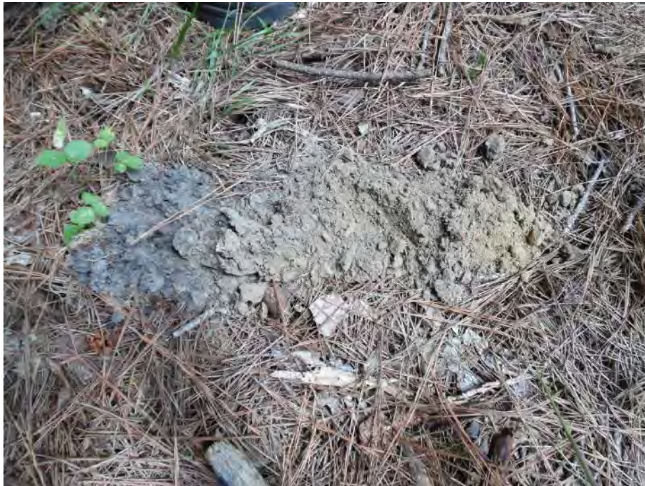
Wetland data point wsol014_u soil sample