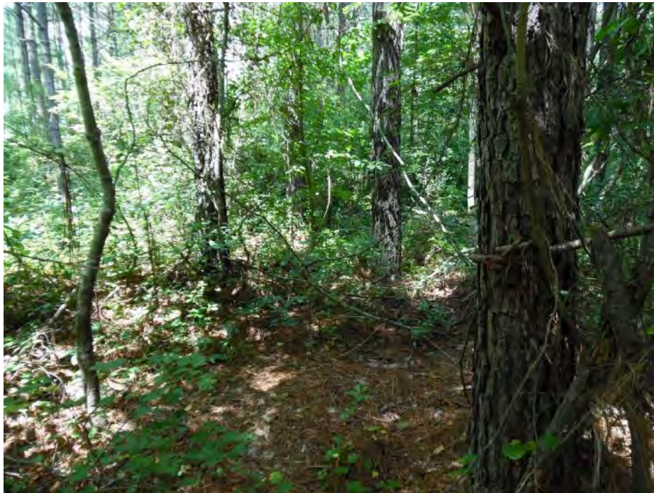
Upland data point wsol018_u facing north