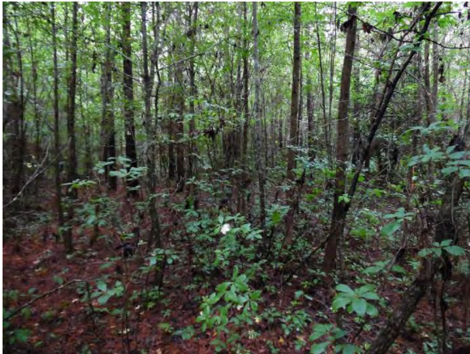
Upland data point wsol016_u facing north