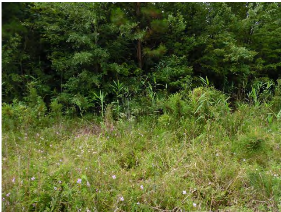
Wetland data point wsol013e_w facing south