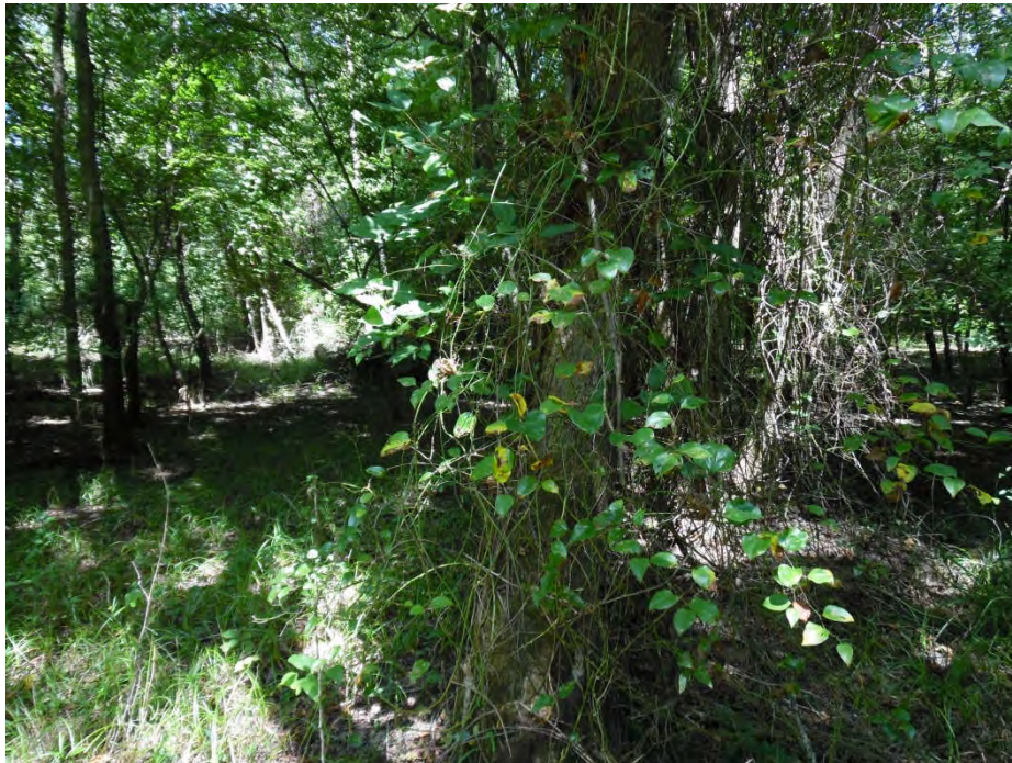
Wetland data point wsol027f_w facing north