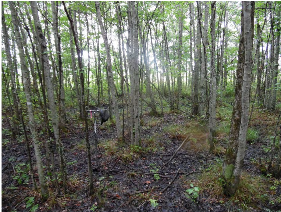
Wetland data point wsol025f_w1 facing north