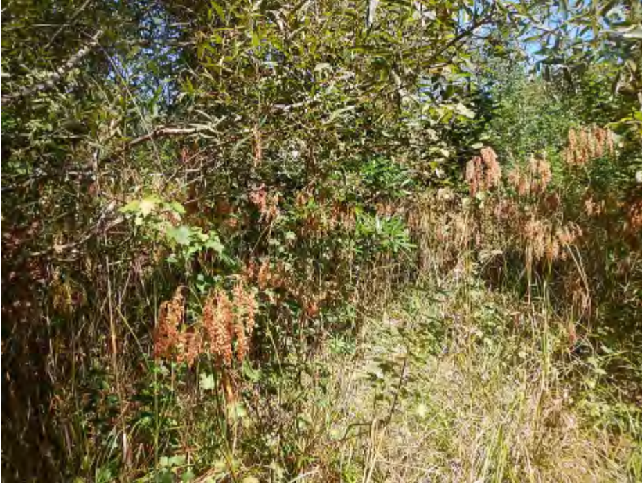
Photo 1 Wetland data point WSOA004f_w facing north