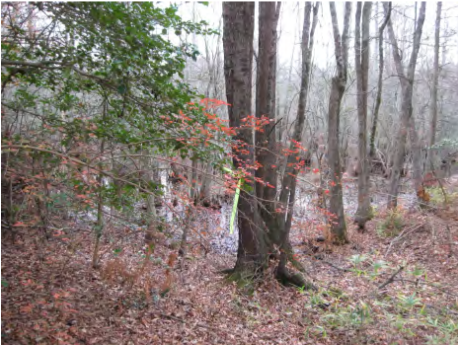
Photo 2 Wetland data point wsoa020f_w facing south