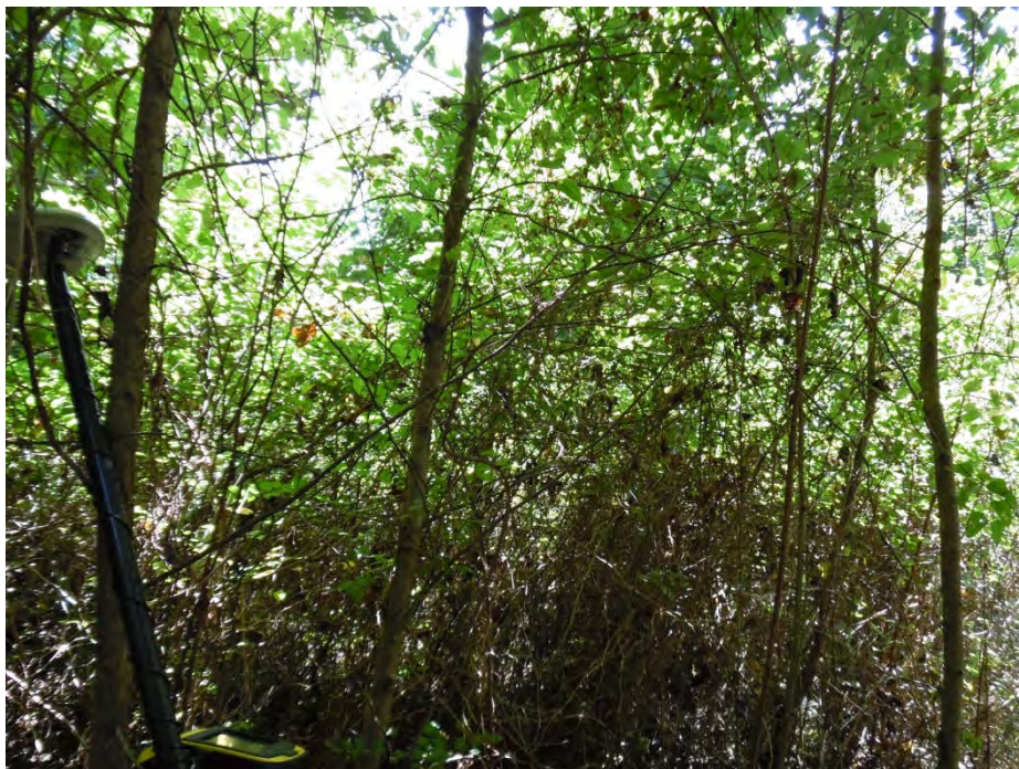
Upland data point wsol028_u facing south