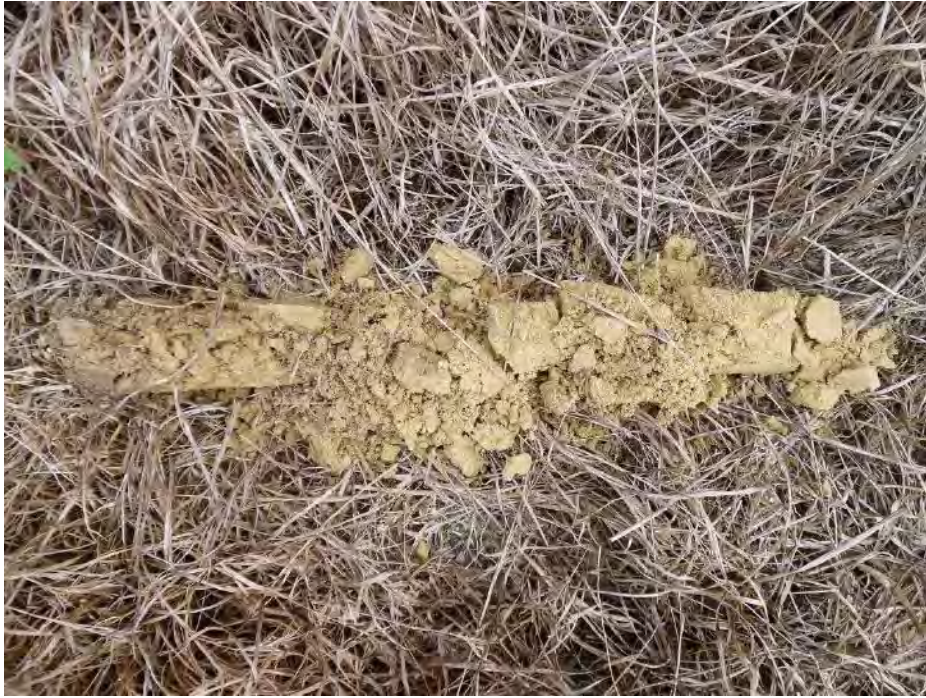
Wetland data point wsol013_u soil sample