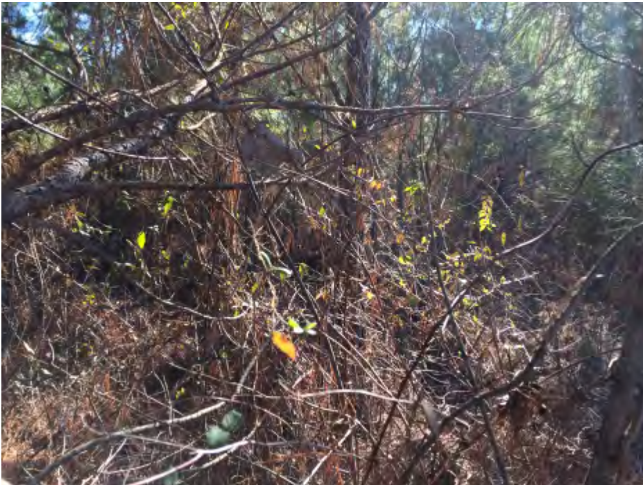
Photo 2 Upland data point wsoa025_u facing south