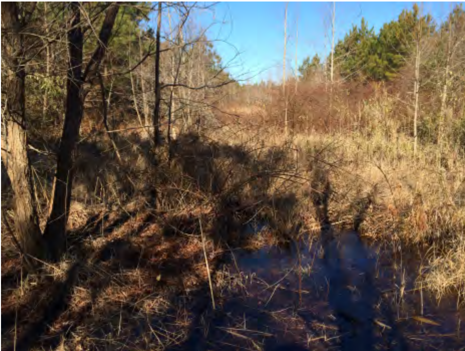
Photo 2 Wetland data point wsoa027s_w facing west