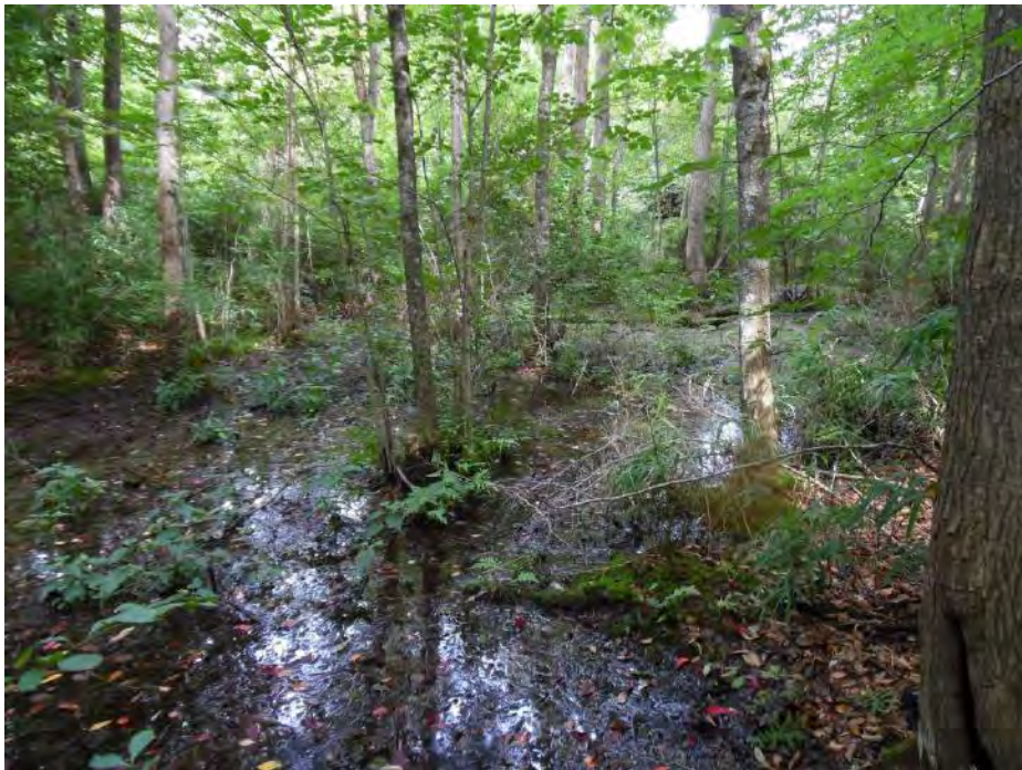
Wetland data point wsol022f_w facing east