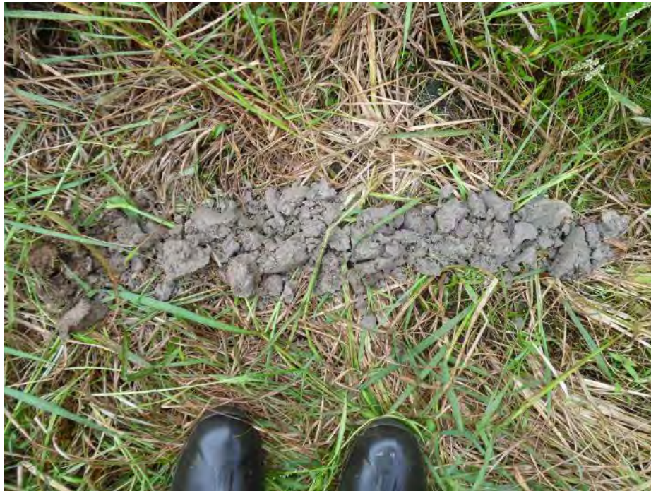
Upland data point wsol015_u soil sample