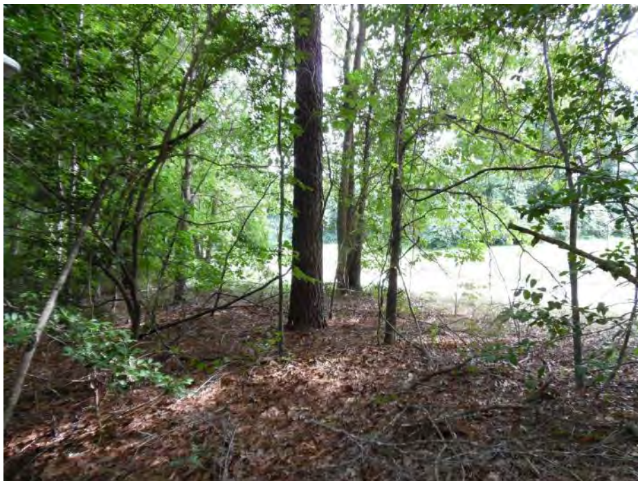
Upland data point wsol022_u facing south