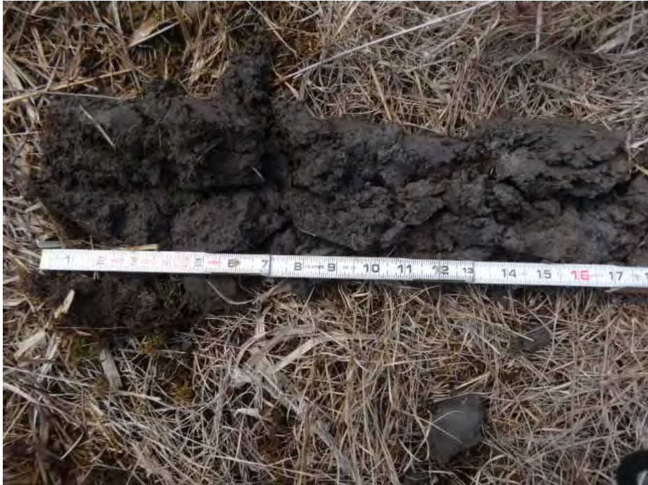
Wetland data point wsol012e_w soil sample