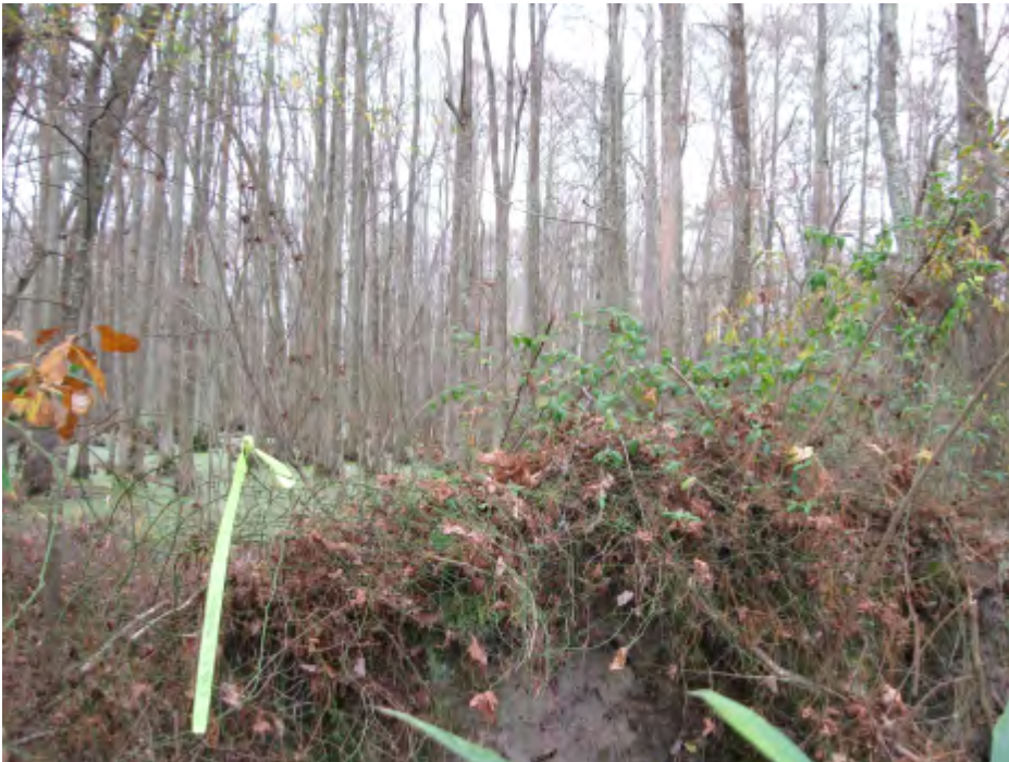
Photo 2 Wetland data point WSOA021f_w facing northwest