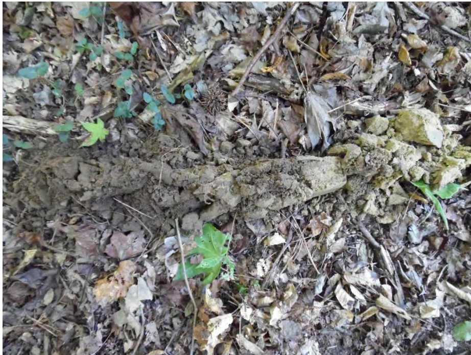
Upland data point wsol031_u soil sample