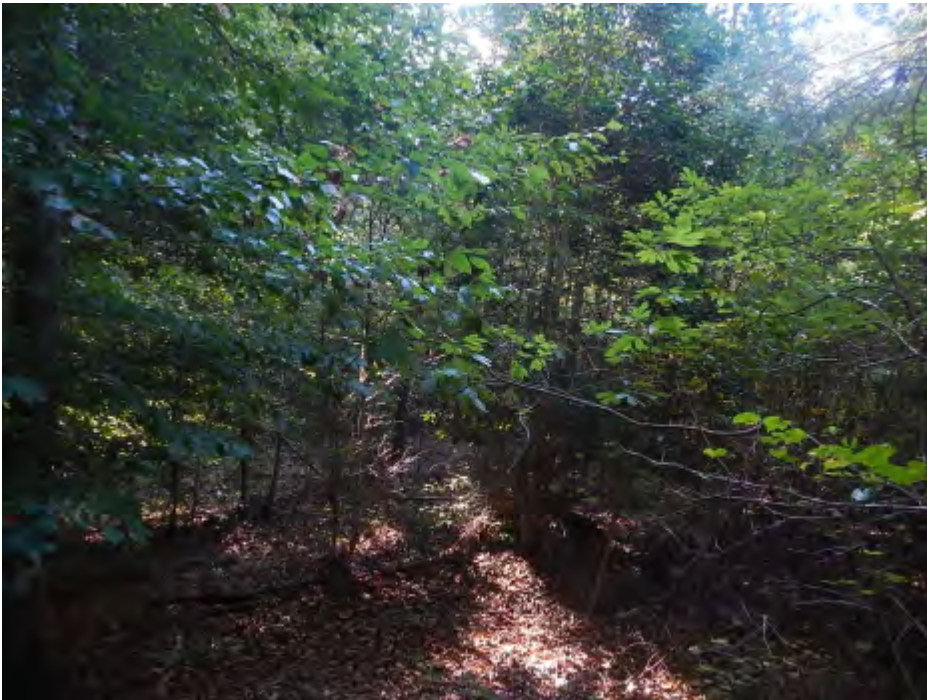
Photo 2 Upland data point WSOA002_u facing south