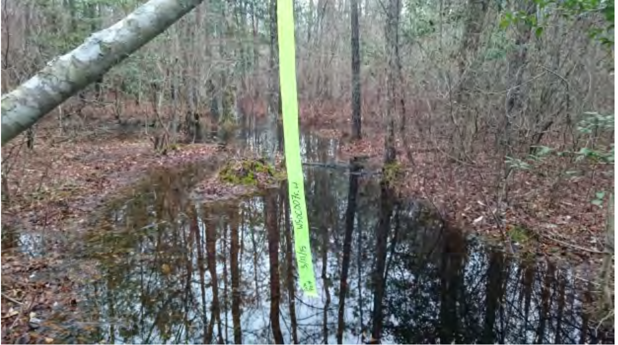
Photo 1 Wetland data point wsoc017f_w facing northeast