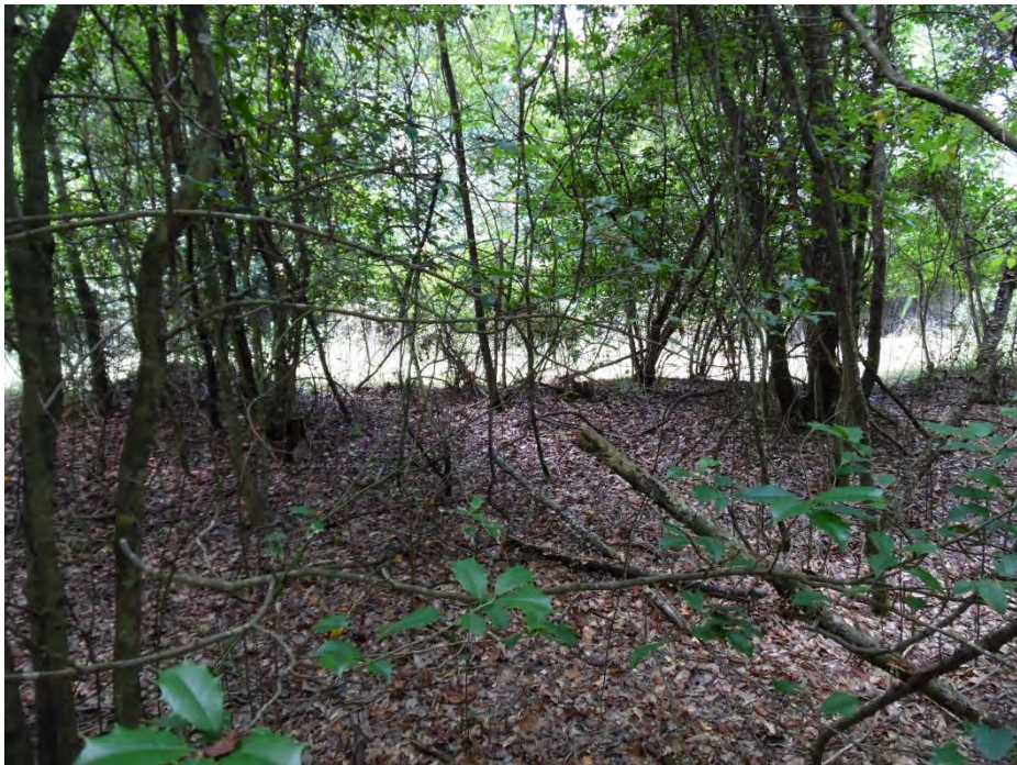
Upland data point wsol030_u facing west