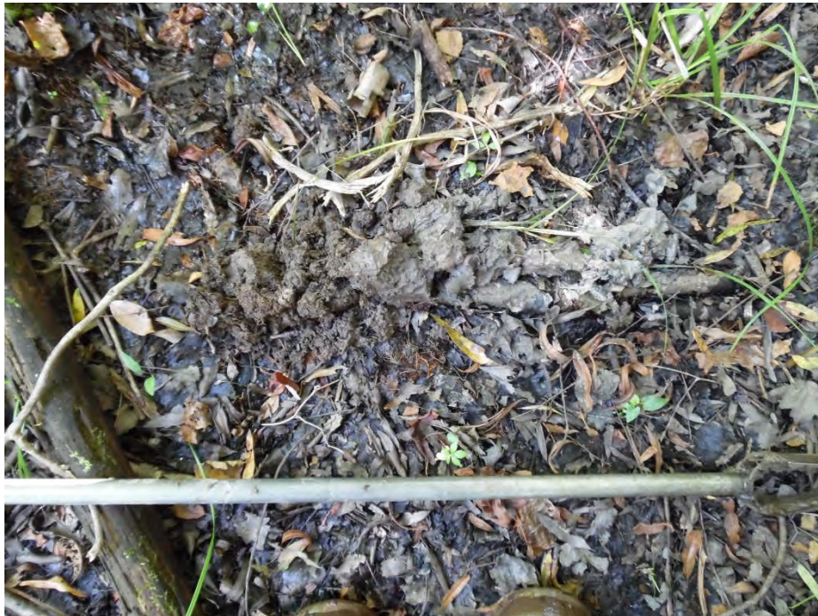
Wetland data point wsol030f_w soil sample