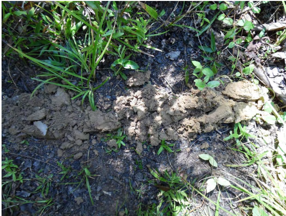
Upland data point wsol029_u soil sample