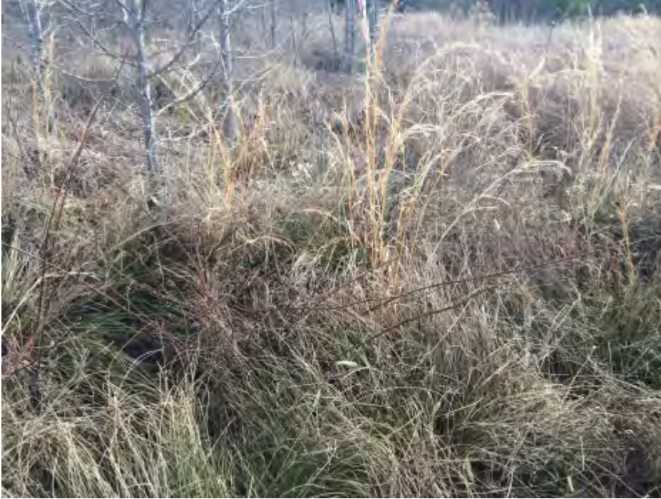
Photo 1 Wetland data point wsoa026e_w facing east