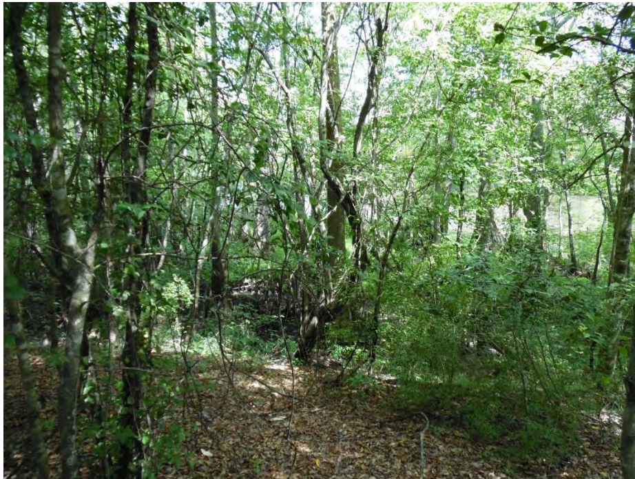
Upland data point wsol026_u facing north