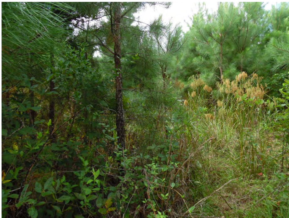
Wetland data point wsol025s_w facing south