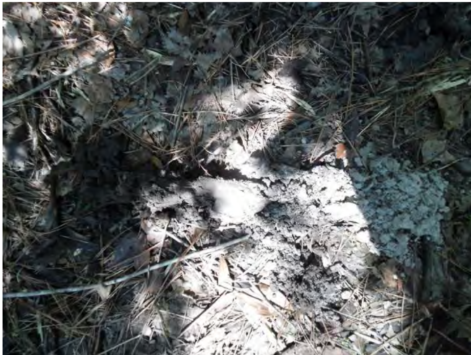
Wetland data point wsol020f_w soil sample