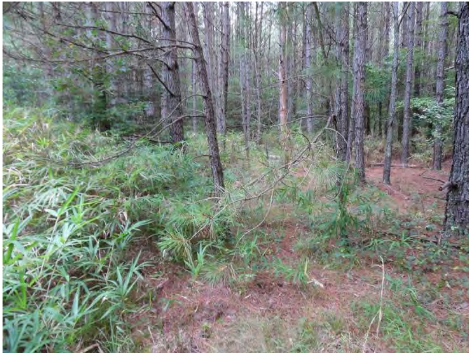
Wetland data point wsol019f_w facing north