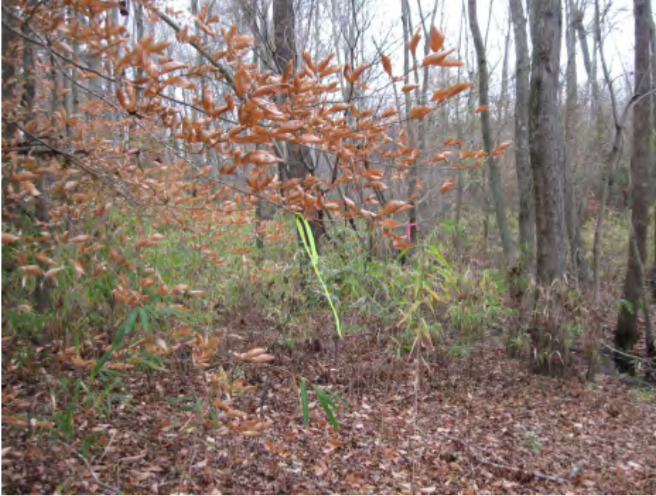
Photo 1 Upland data point WSOA024_u facing north