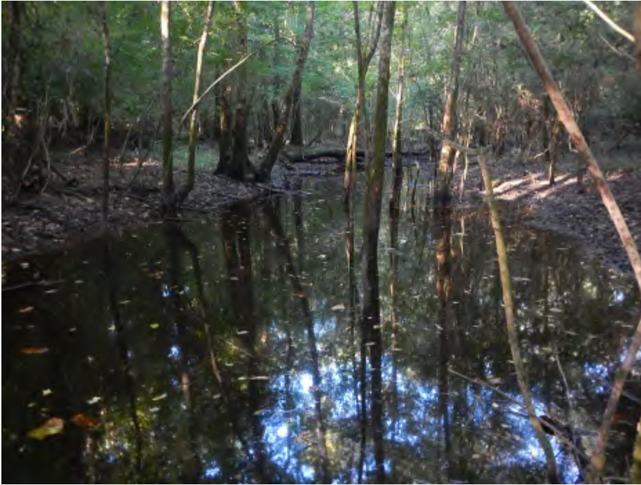
Photo 1 Wetland data point WSOA007f_w facing west