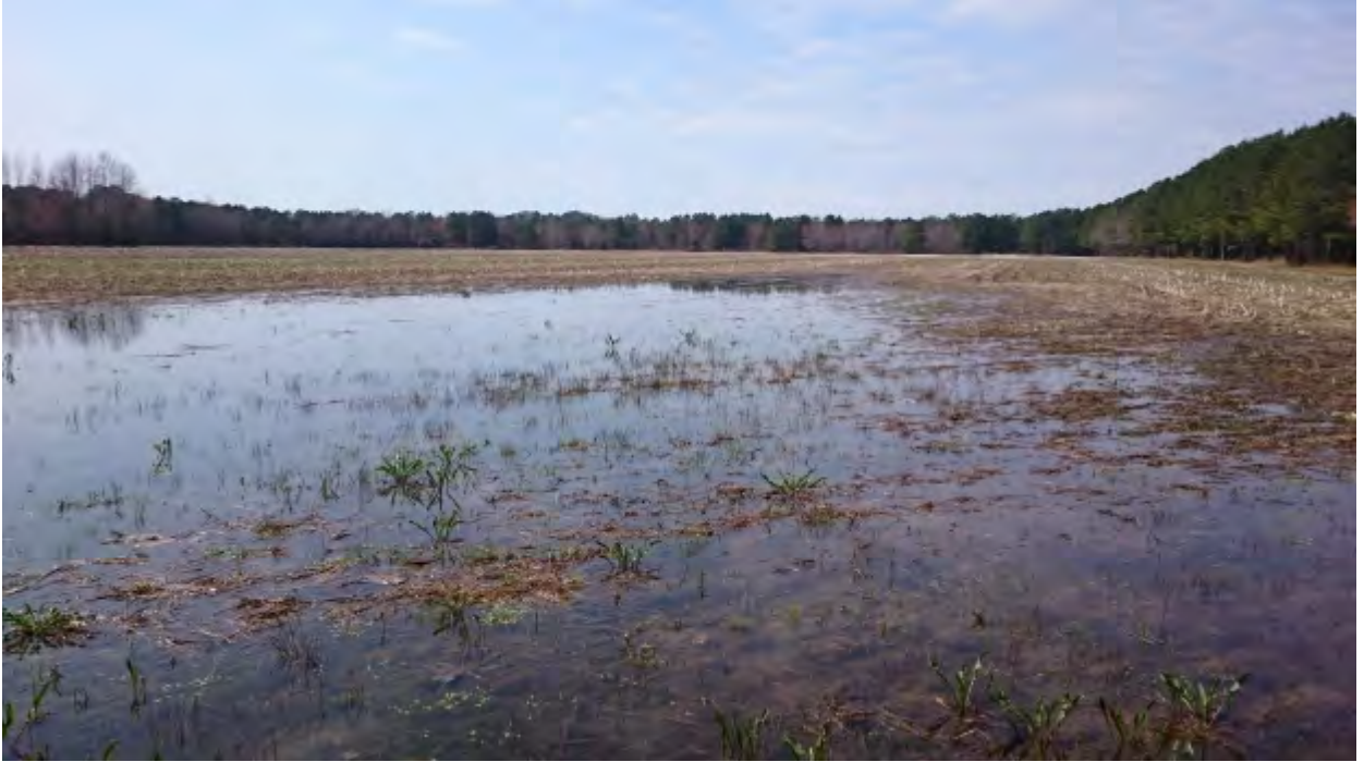
Photo 1 Wetland data point wsol019e_w facing northwest