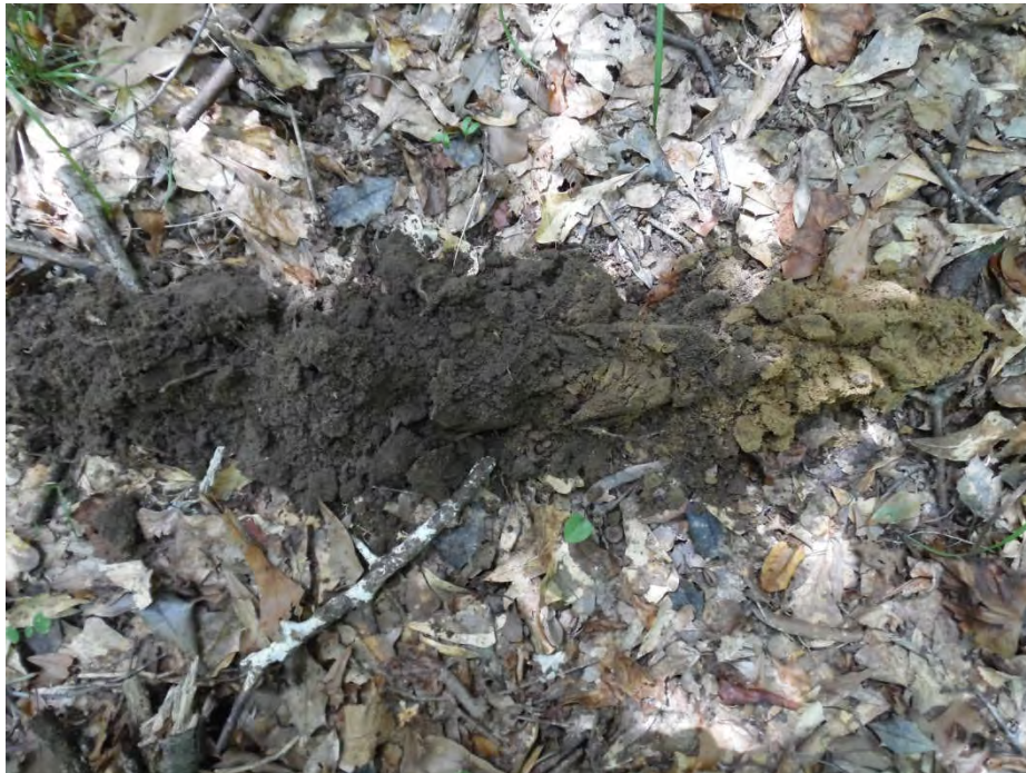
Upland data point wsol030_u soil sample