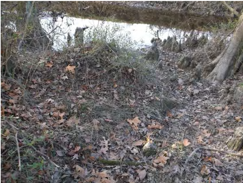
Wetland data point wsoo010f_w facing west.