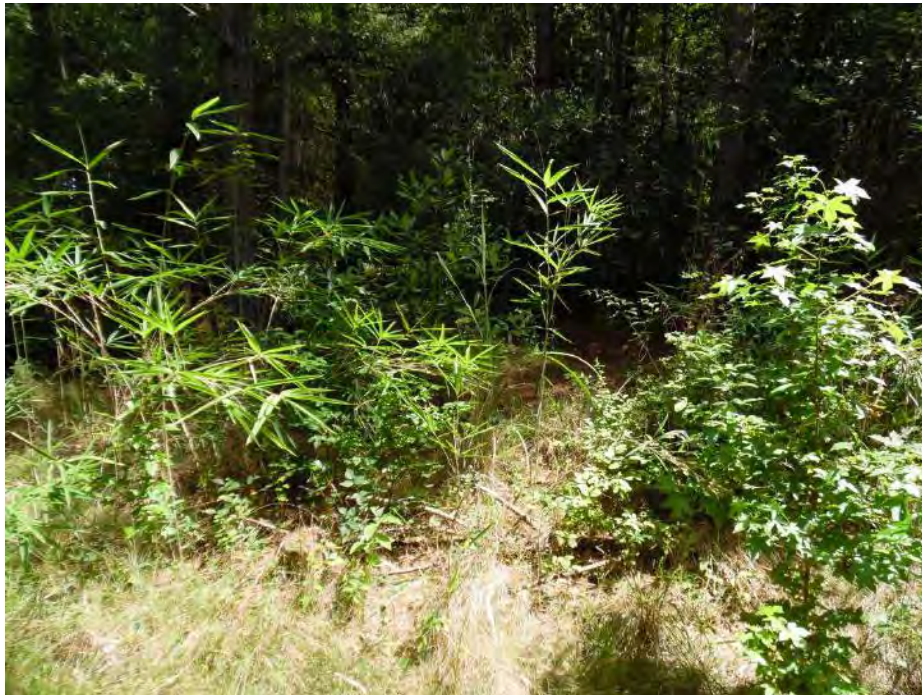
Wetland data point wsol018f_w facing east