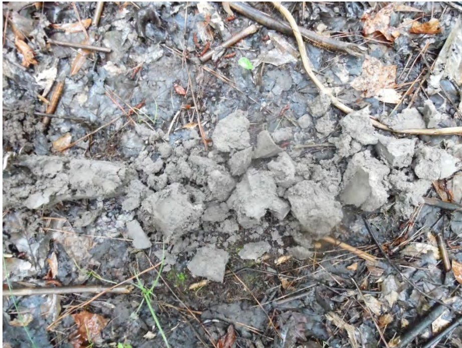
Wetland data point wsol025f_w1 soil sample