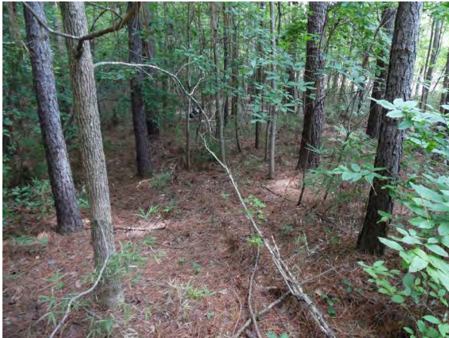
Upland data point wsol014_u facing east