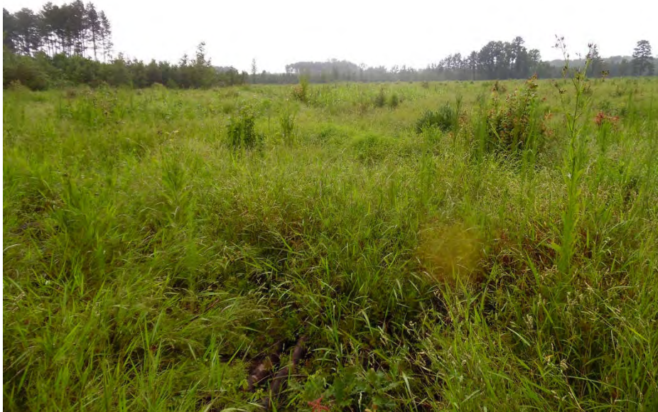
Wetland data point wsol025e_w facing south