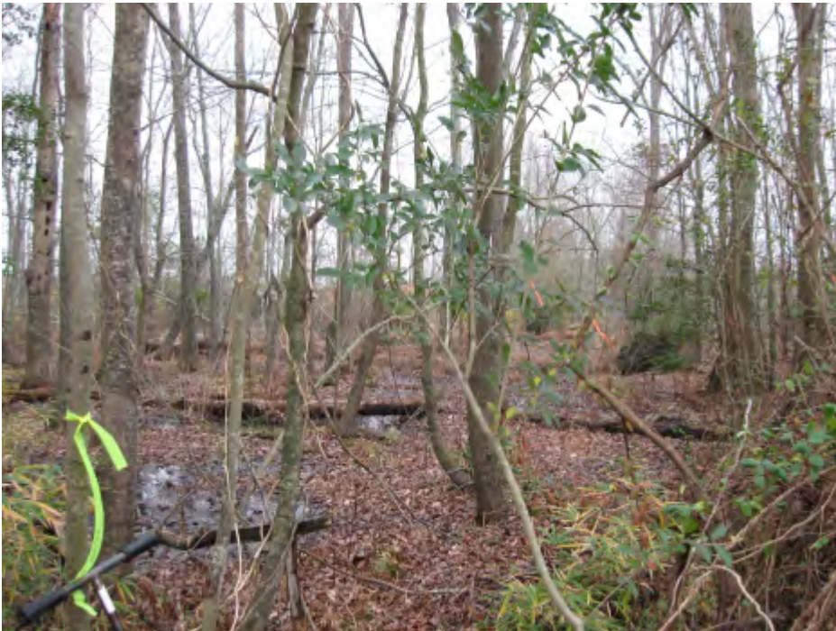
Photo 2 Wetland data point wsoa017f_w facing southeast