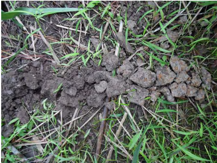
Wetland data point wsol017f_w soil sample