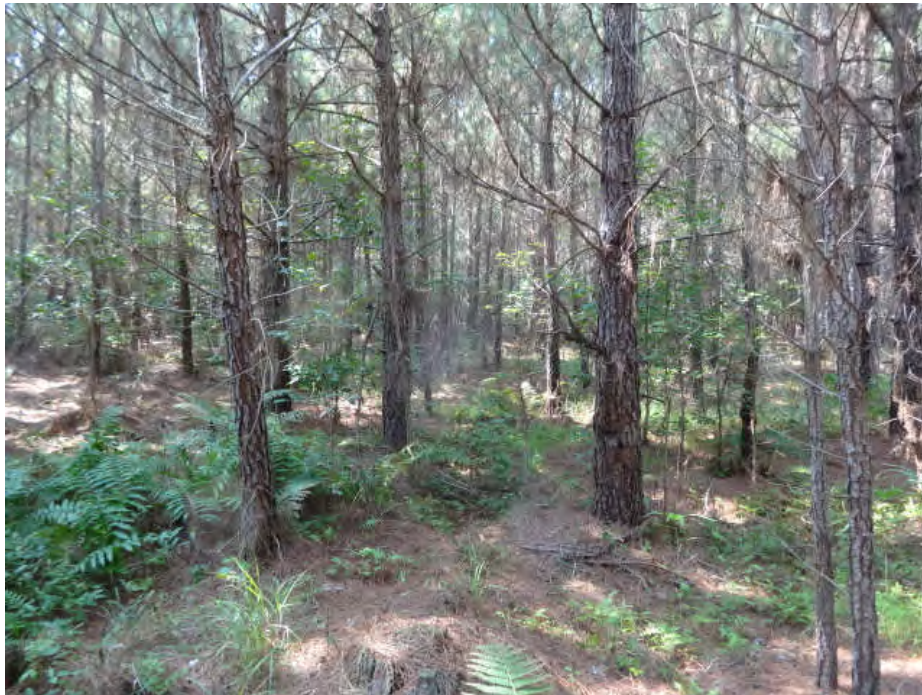
Wetland data point wsol012f_w facing North