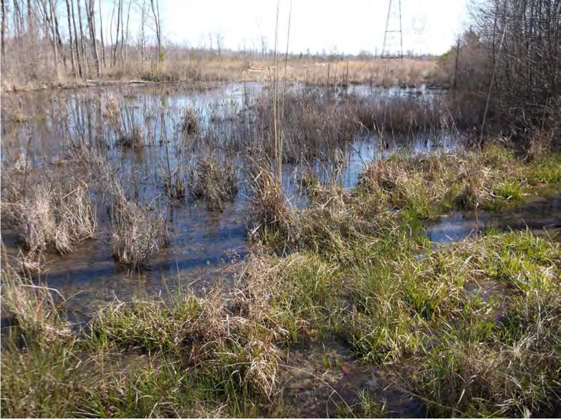
Wetland data point wsop001e_w facing east.