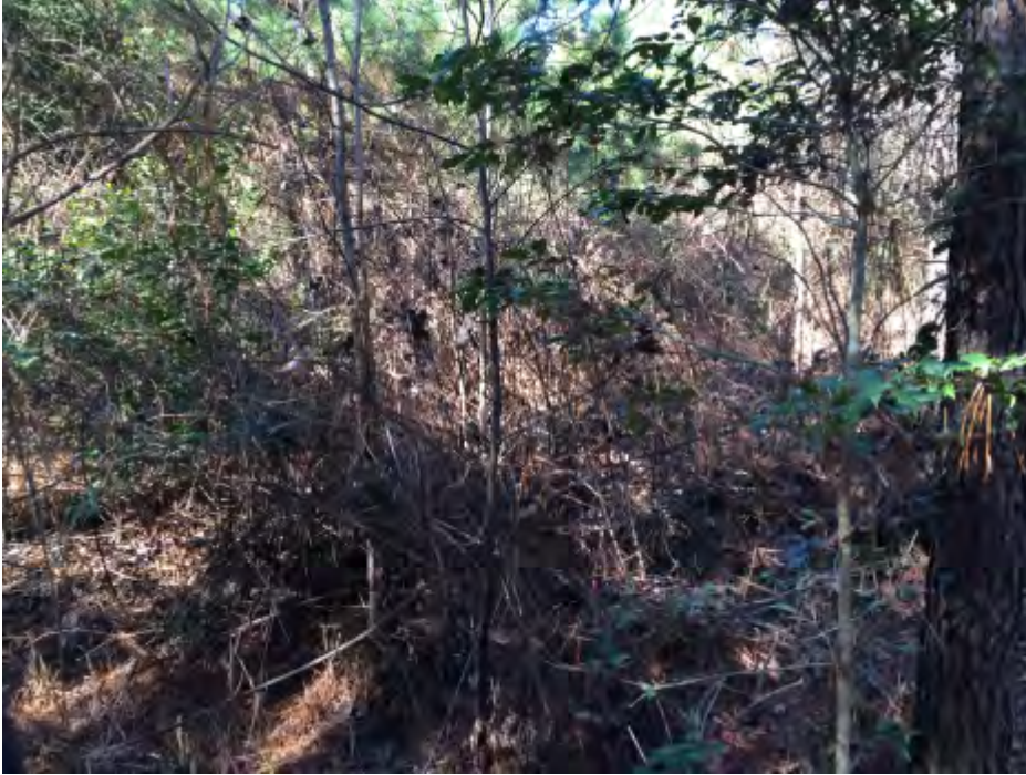
Photo 1 Upland data point wsoa028_u facing north