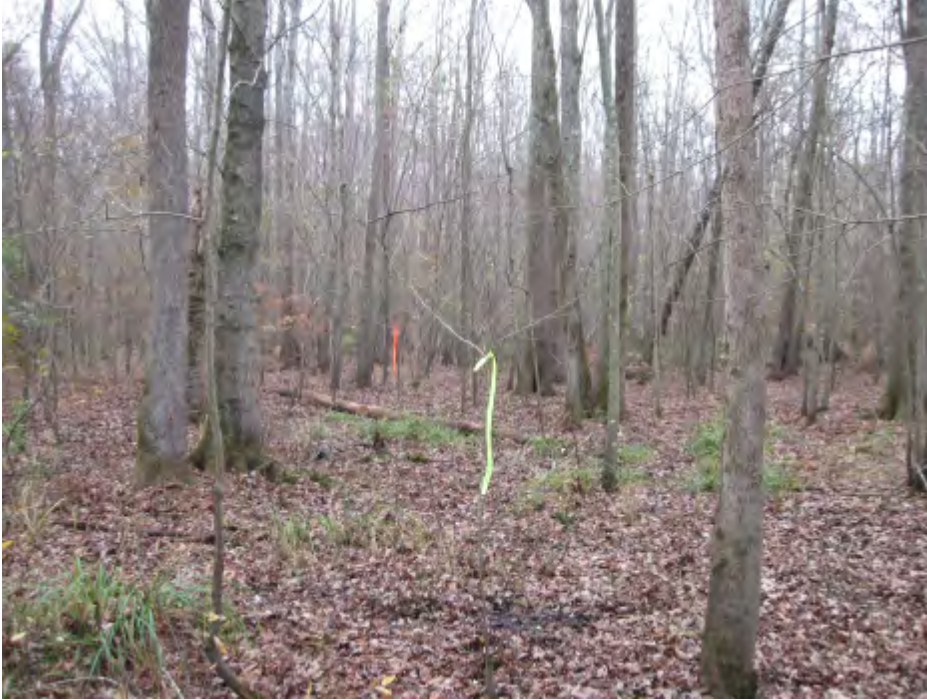
Photo 1 Wetland data point WSOA024f_w facing east