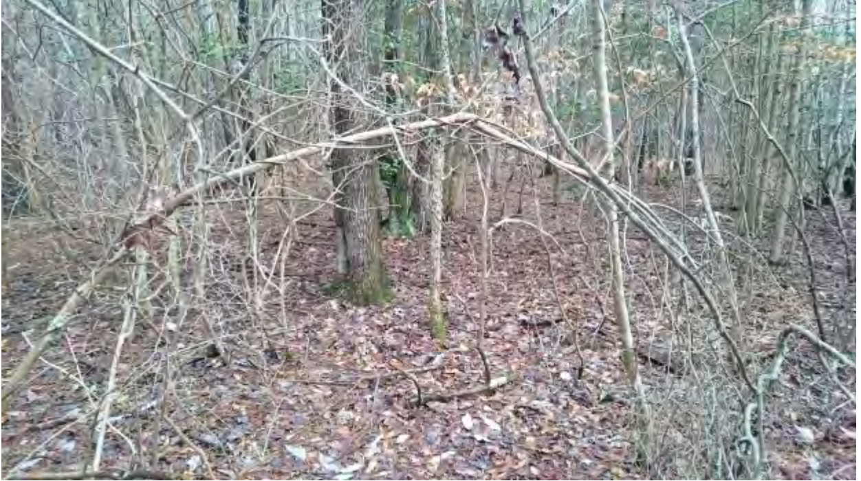
Photo 1 Upland data point wsoc017_u facing north