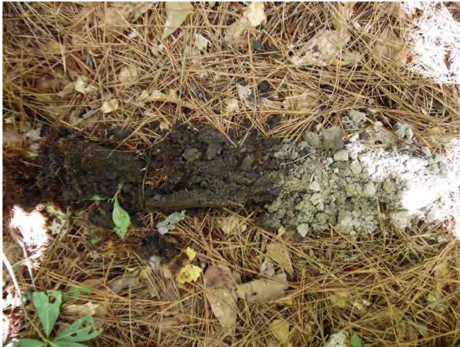
Upland data point wsol018_u soil sample