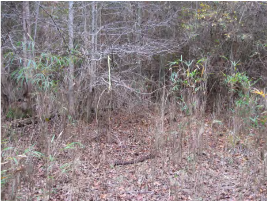
Photo 2 Wetland data point WSOA022f_w facing west