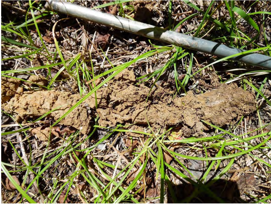
Wetland data point wsol027f_w soil sample