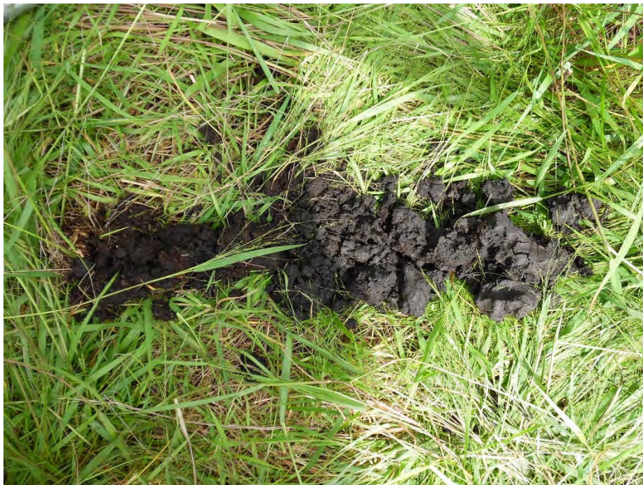
Wetland data point wsol033e_w soil sample