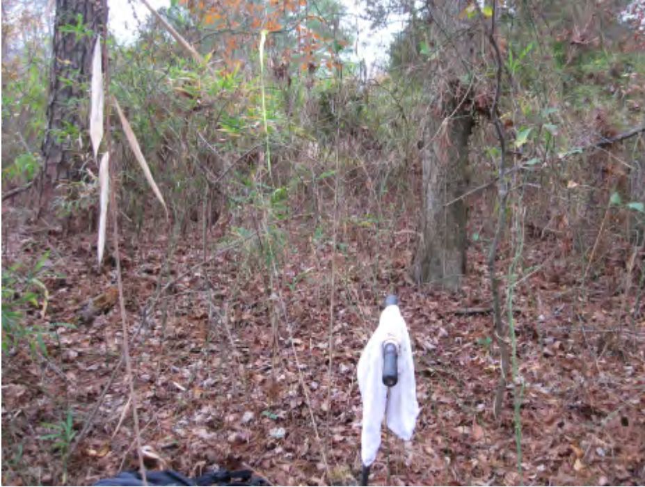
Photo 1 Upland data point WSOA021_u facing south