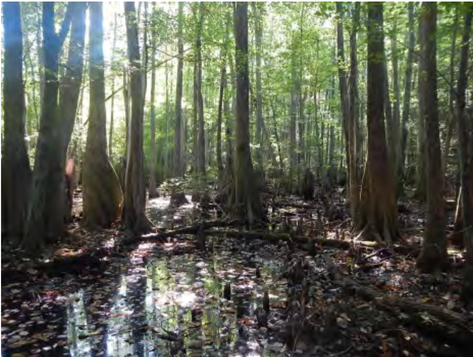
Photo 2 Wetland data point WSOA002f_w facing south