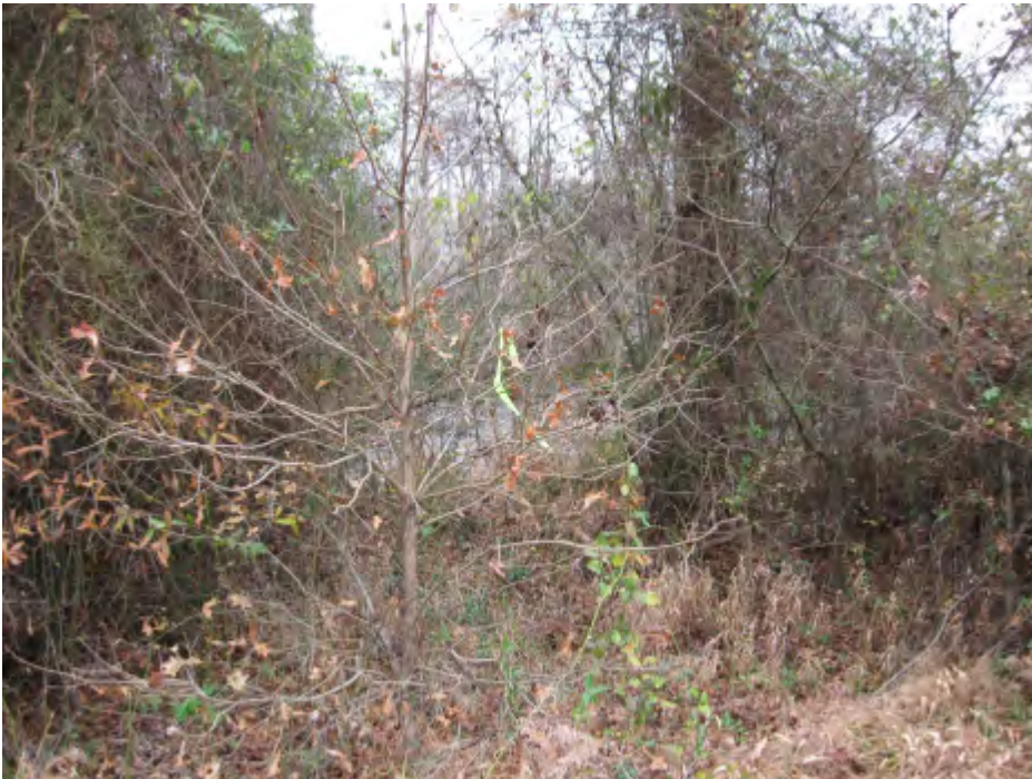
Photo 2 Upland data point wsoa019_u facing north