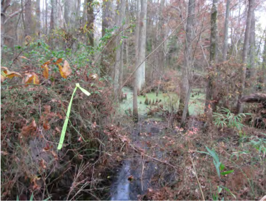
Photo 1 Wetland data point WSOA021f_w facing north