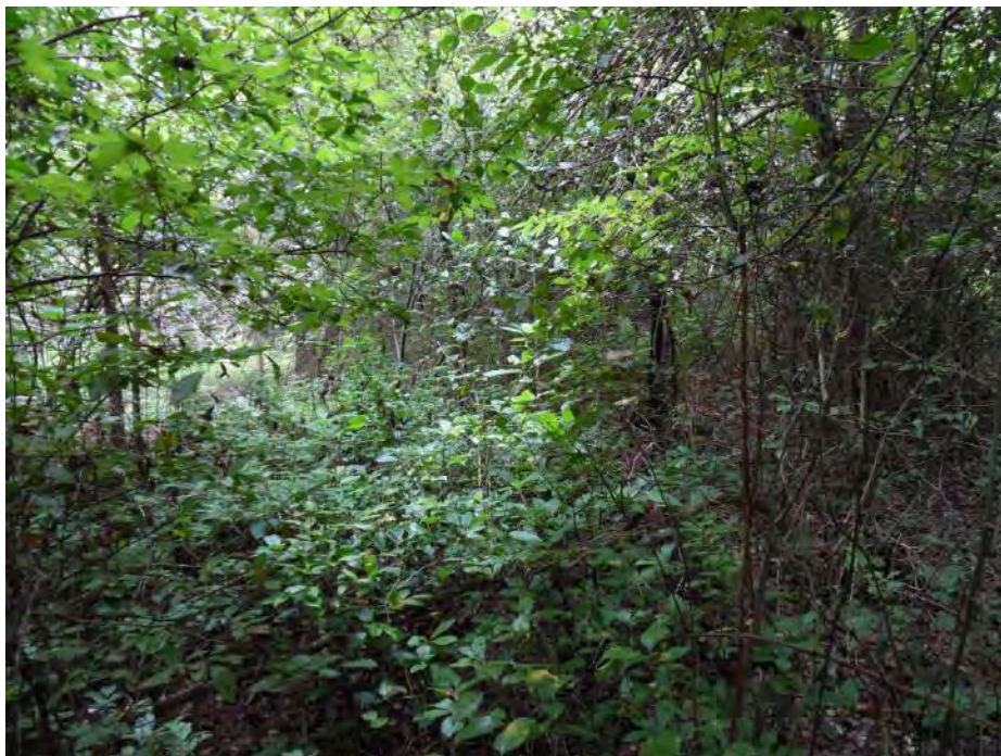
Wetland data point wsol013f_w facing west