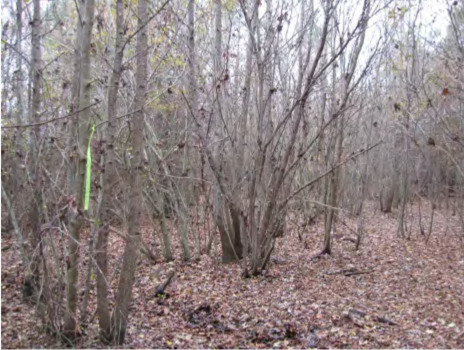
Photo 1 Wetland data point wsoa018f_w facing northwest