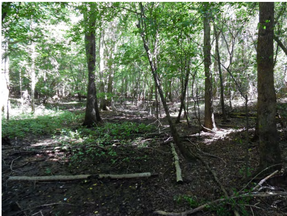
Wetland data point wsol031f_w facing south