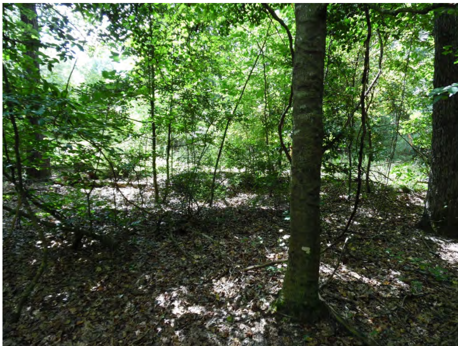
Upland data point wsol026_u facing south