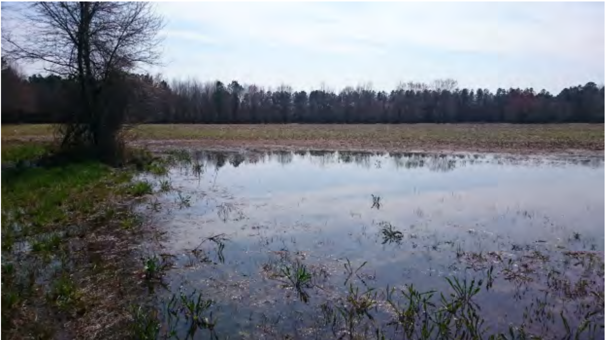
Photo 2 Wetland data point wsol019e_w facing southwest