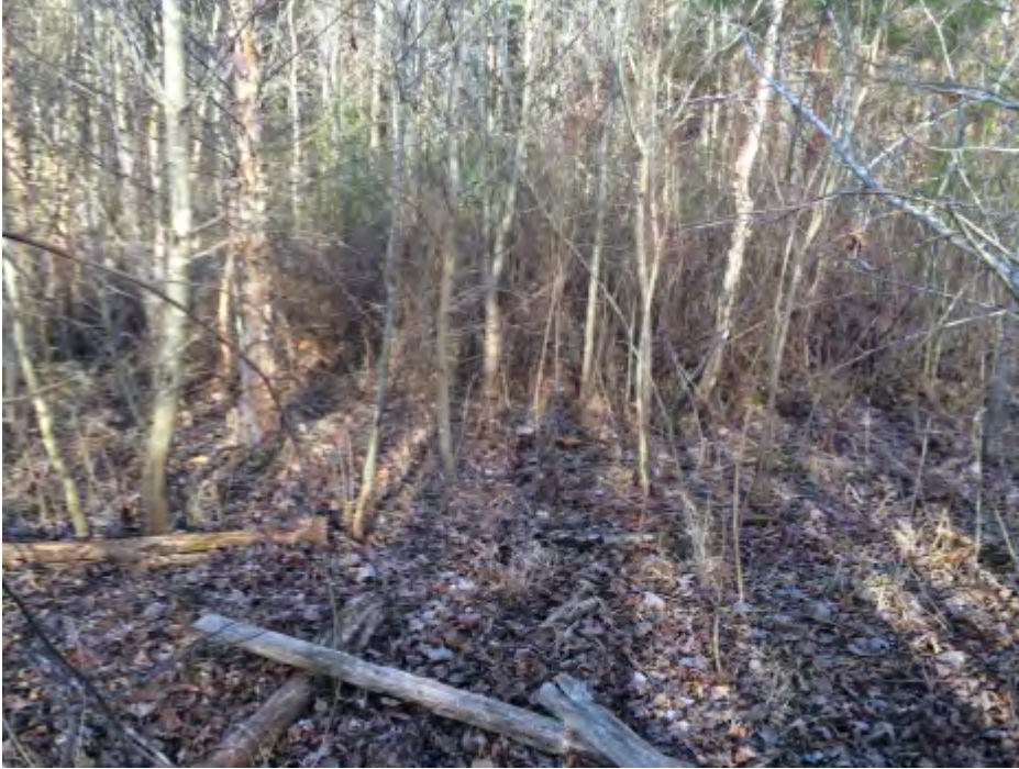
Photo 1 Wetland data point wsoa033f_w facing west