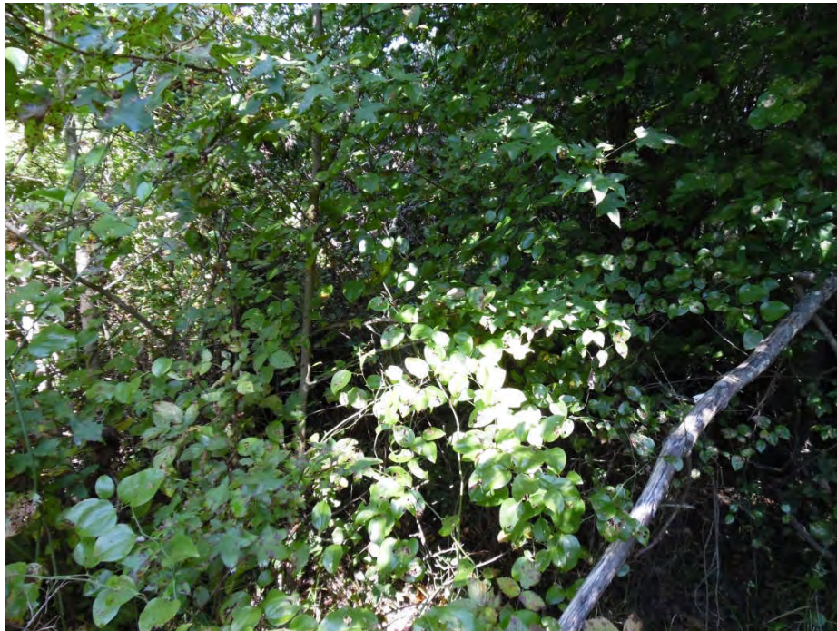
Upland data point wsol029_u facing north