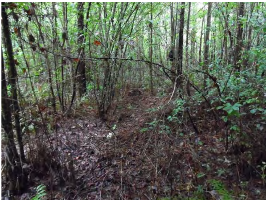
Wetland data point wsol016f_w facing west