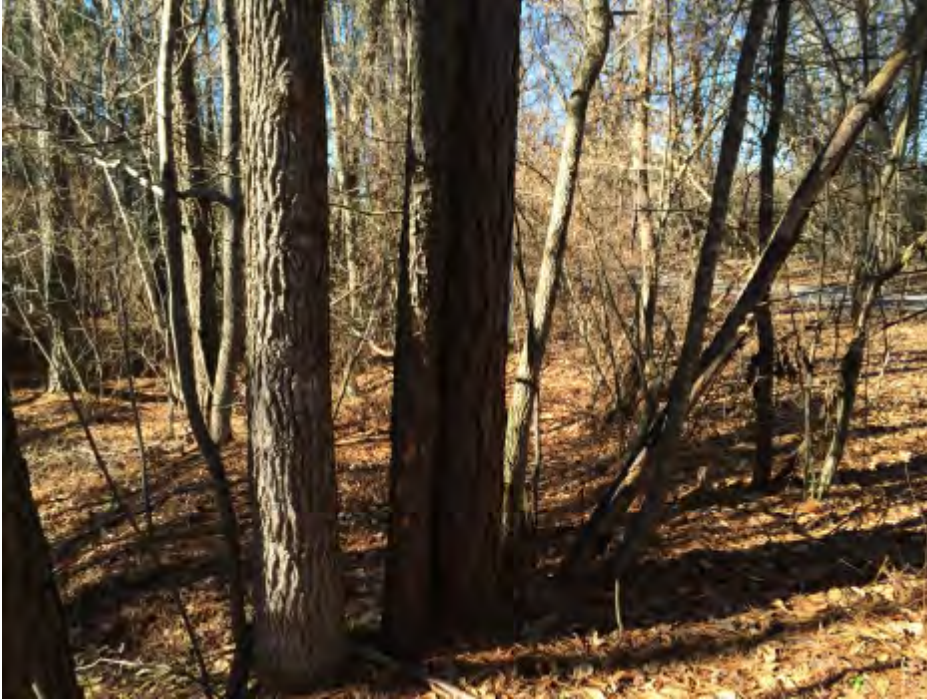
Photo 1 Upland data point wsoa029_u facing north