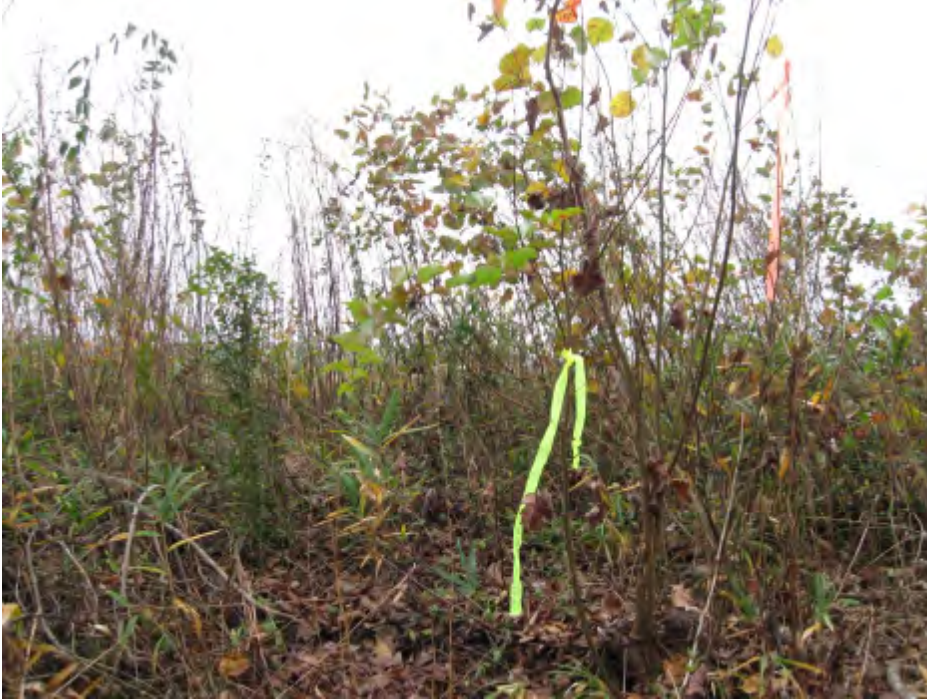
Photo 1 Upland data point wsoa017_u facing northwest