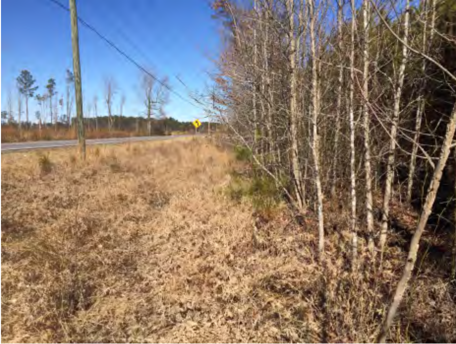
Photo 1 Wetland data point wsoa025e_w facing north