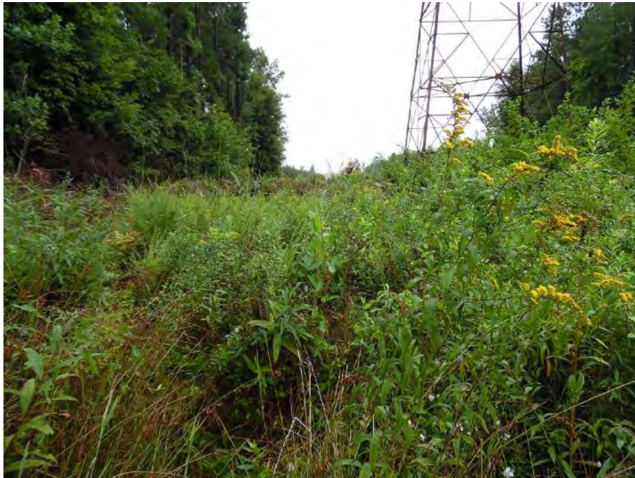
Upland data point wsol015_u facing east