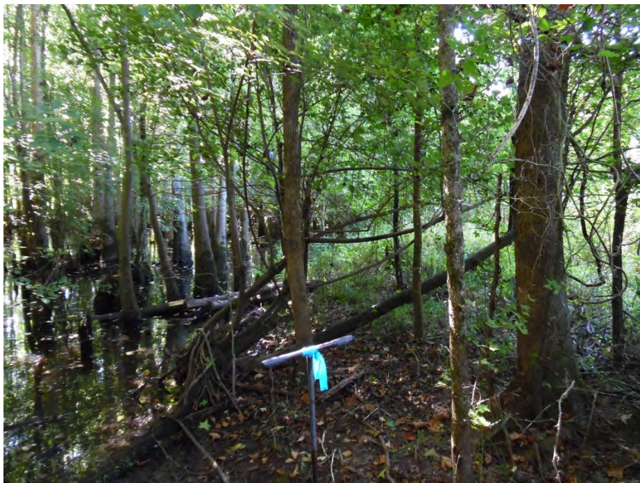
Wetland data point wsol029f_w facing south