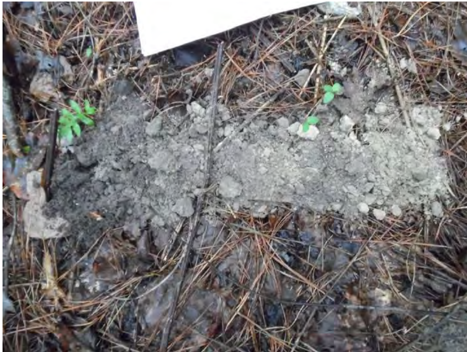
Upland data point wsol016_u soil sample