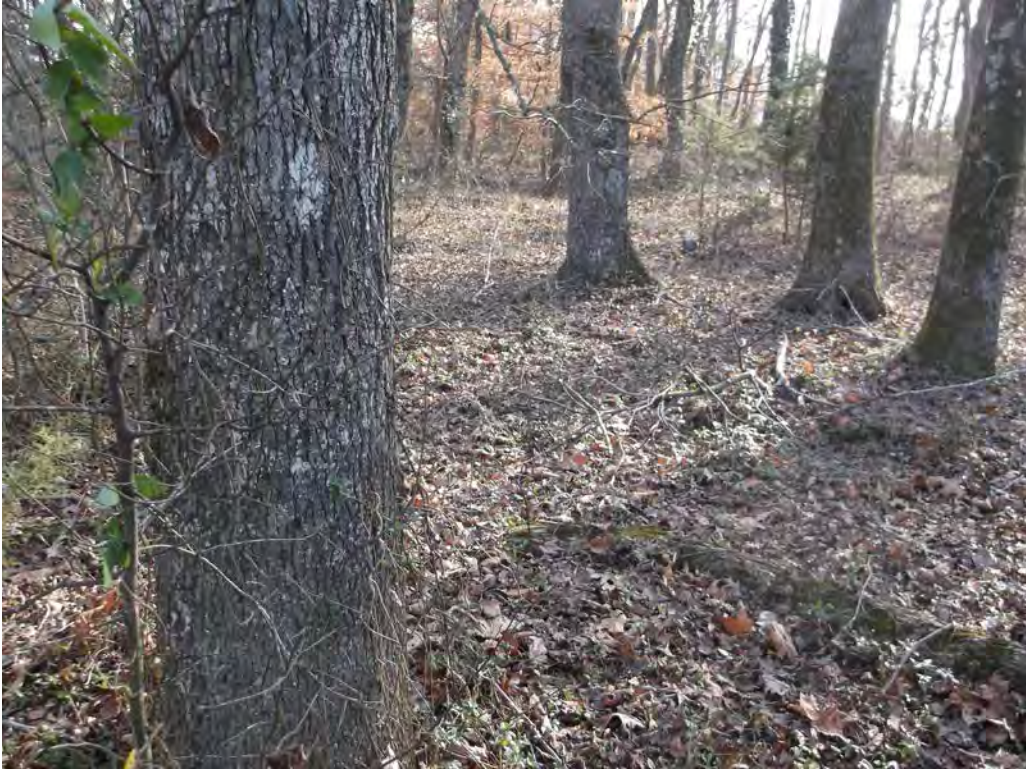
Upland data point wsoo010_u facing east.