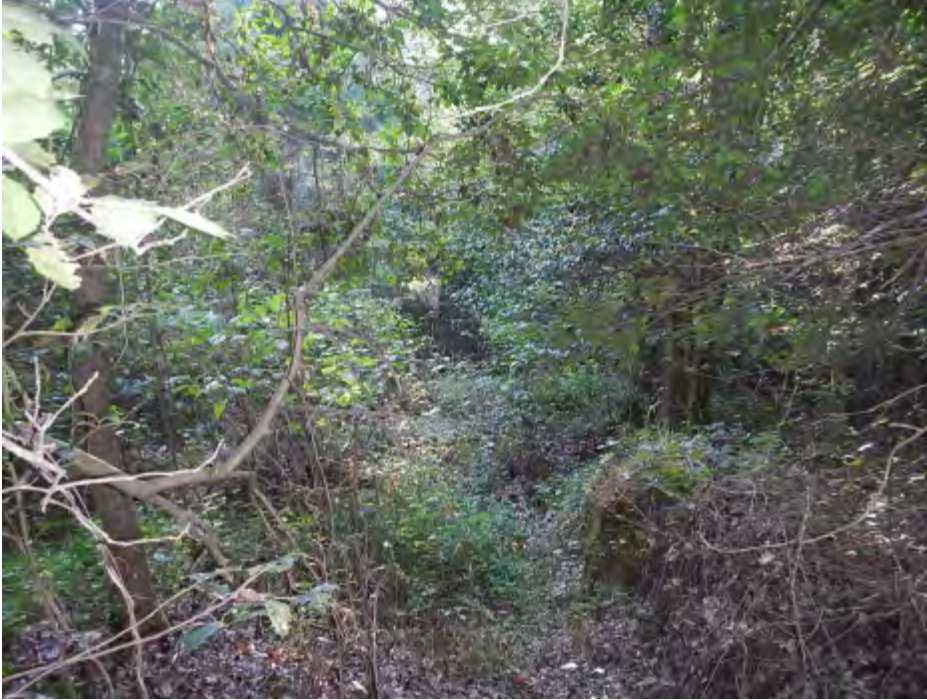
Photo 1 Upland data point WSOA001_u facing south