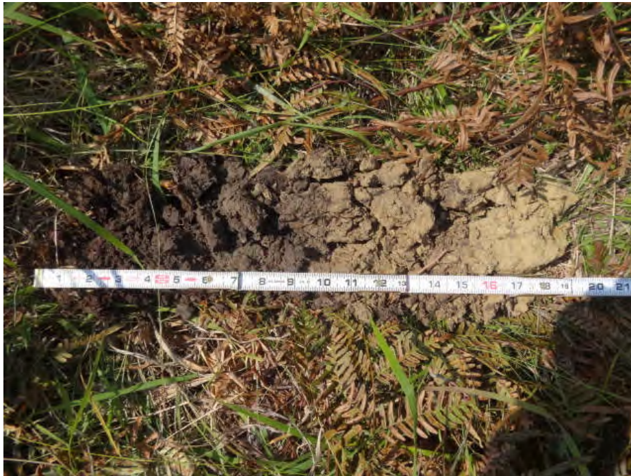
Upland data point wsol012_u soil sample