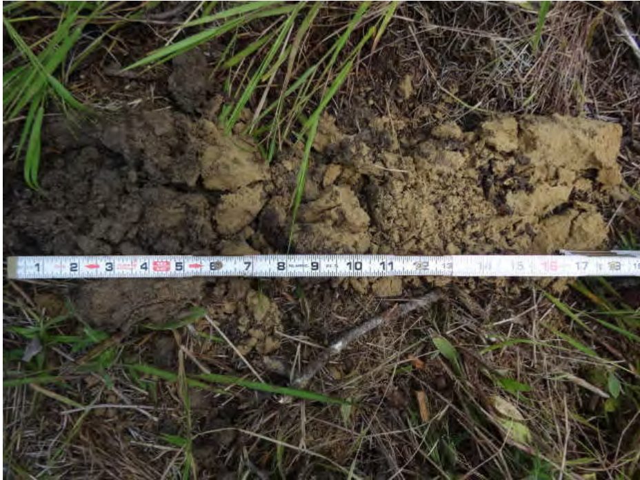
Upland data point wsol011_u soil sample