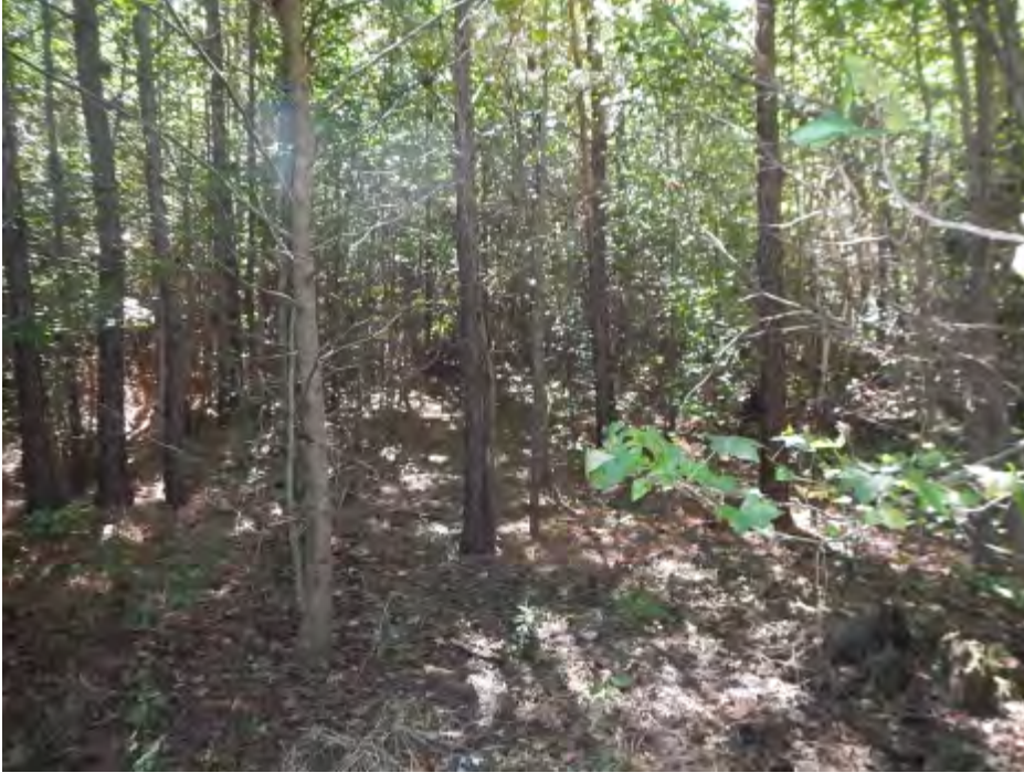
Photo 1 Wetland data point WSOA003f_w facing south