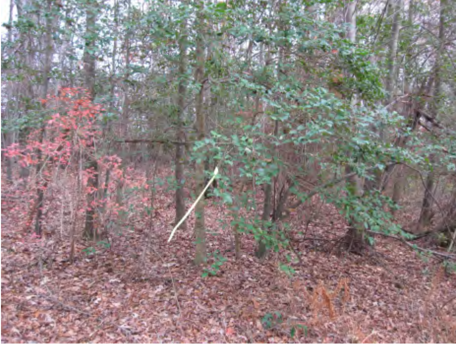
Photo 1 Wetland data point wsoa020f_w facing east