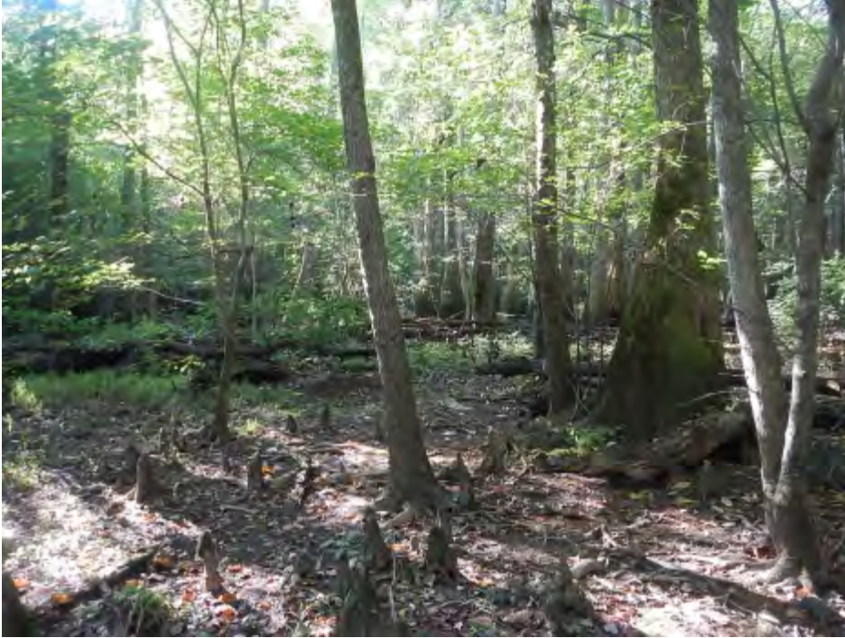
Photo 1 Wetland data point WSOA001f_w facing south