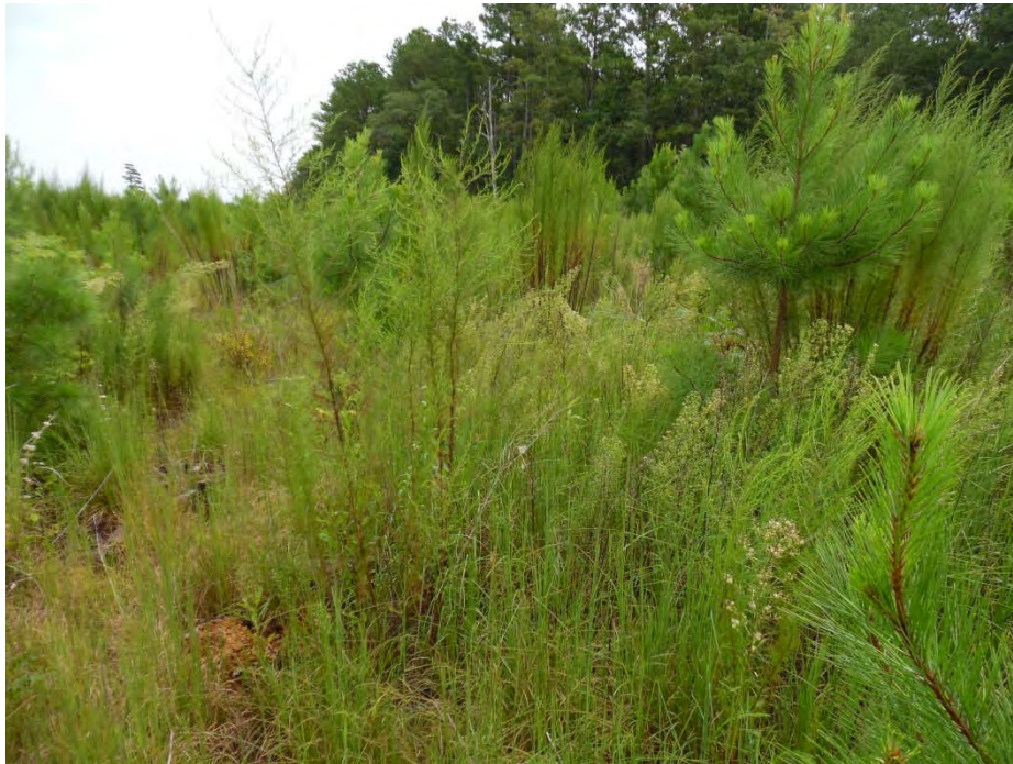
Upland data point wsol033_u facing east