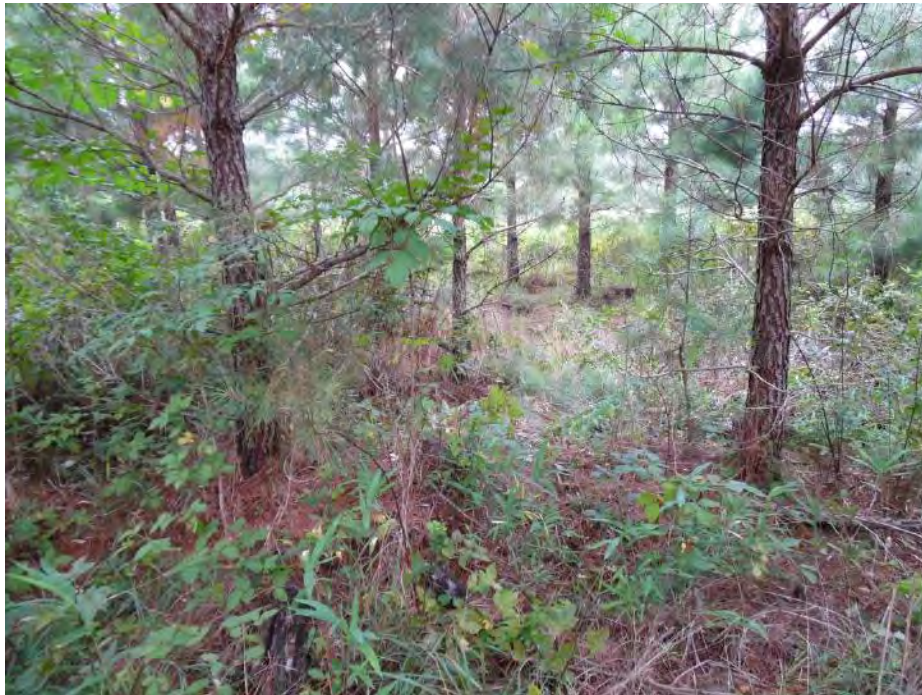
Upland data point wsol017_u facing north