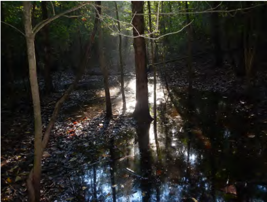
Photo 2 Wetland data point WSOA007f_w facing east