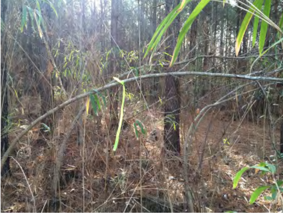
Photo 1 Upland data point wsoa033_u facing east