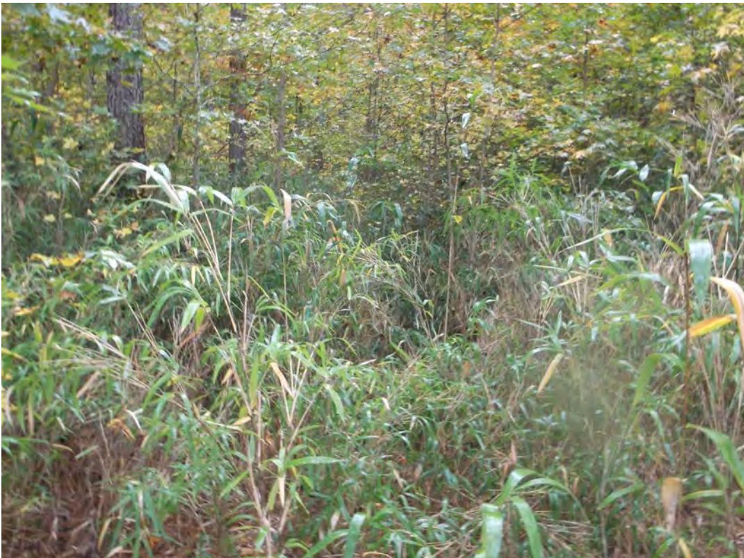
Wetland data point wsop100f_w facing south.