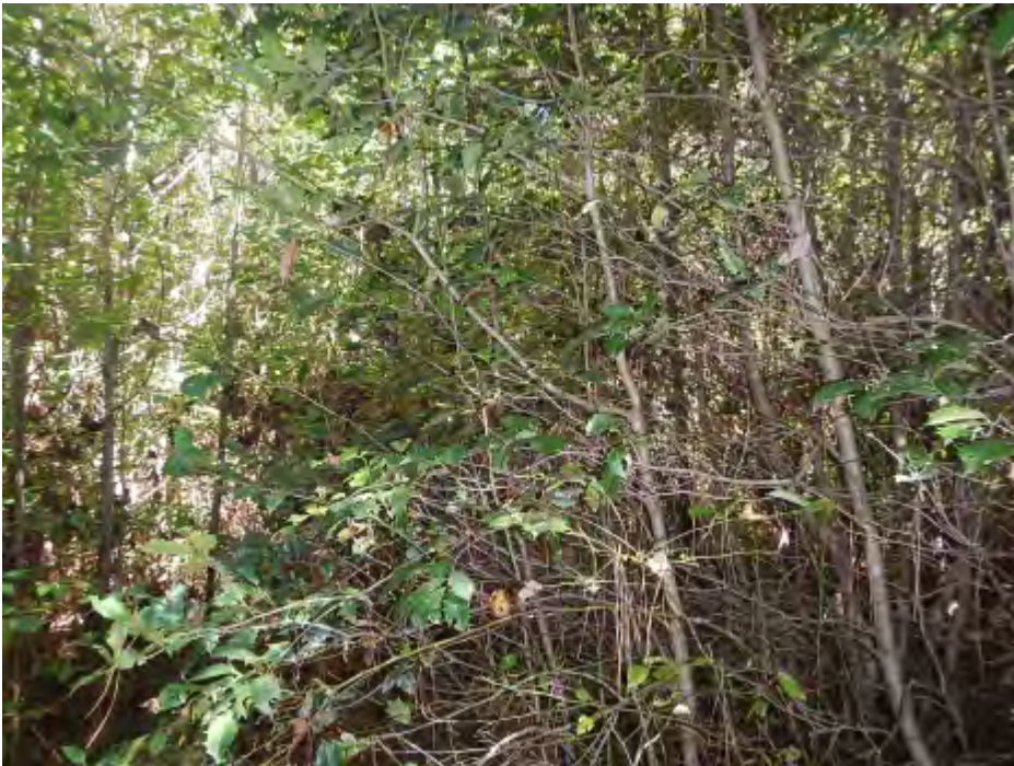
Photo 2 Upland data point WSOA003_u facing north