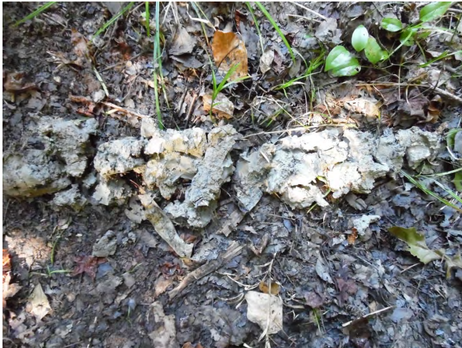
Wetland data point wsol029f_w soil sample