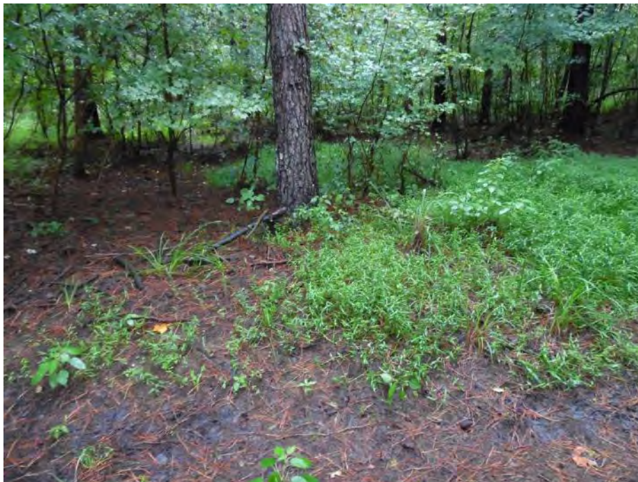
Wetland data point wsol015f_w facing north