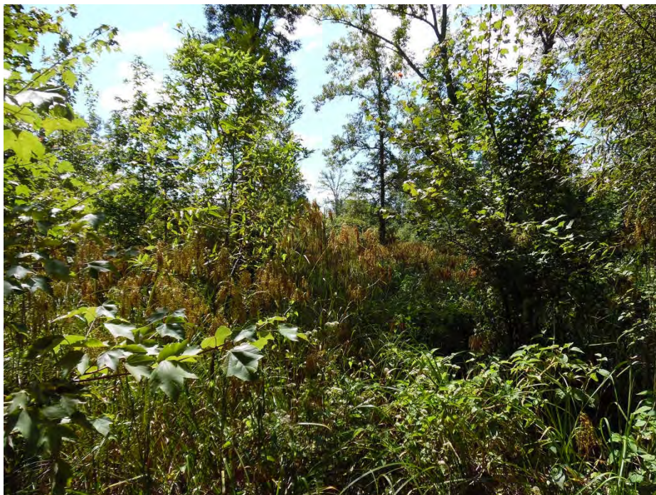
Wetland data point wsol029s_w facing south