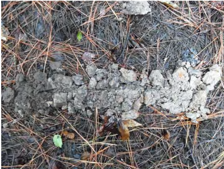
Wetland data point wsol015f_w soil sample