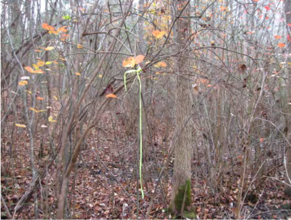
Photo 1 Wetland data point wsoa023f_w facing south