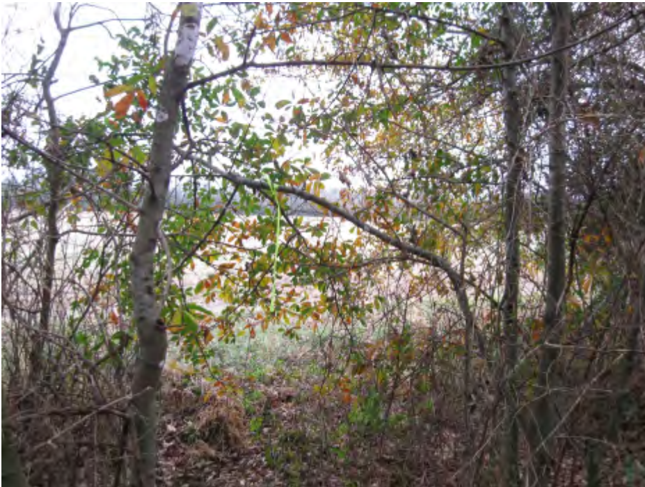
Photo 2 Upland data point wsoa018_u facing southwest