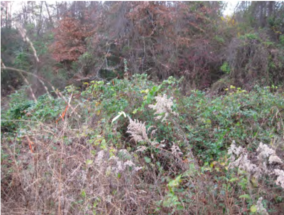
Photo 2 Upland data point wsoa020_u facing west