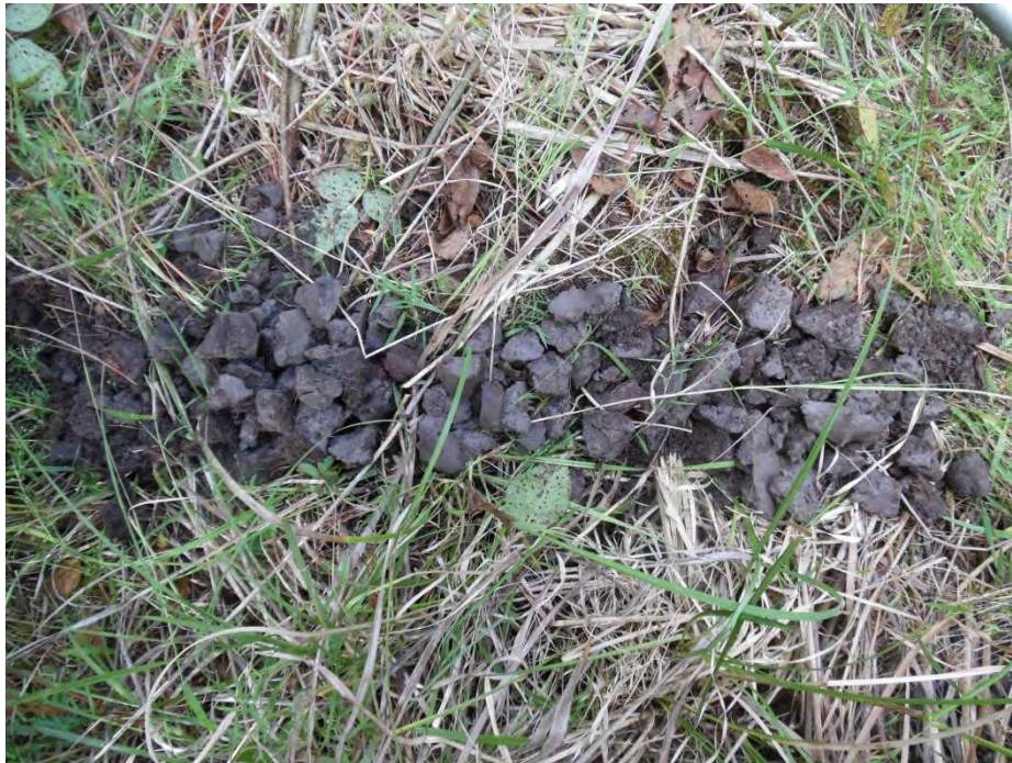
Wetland data point wsol025s_w soil sample