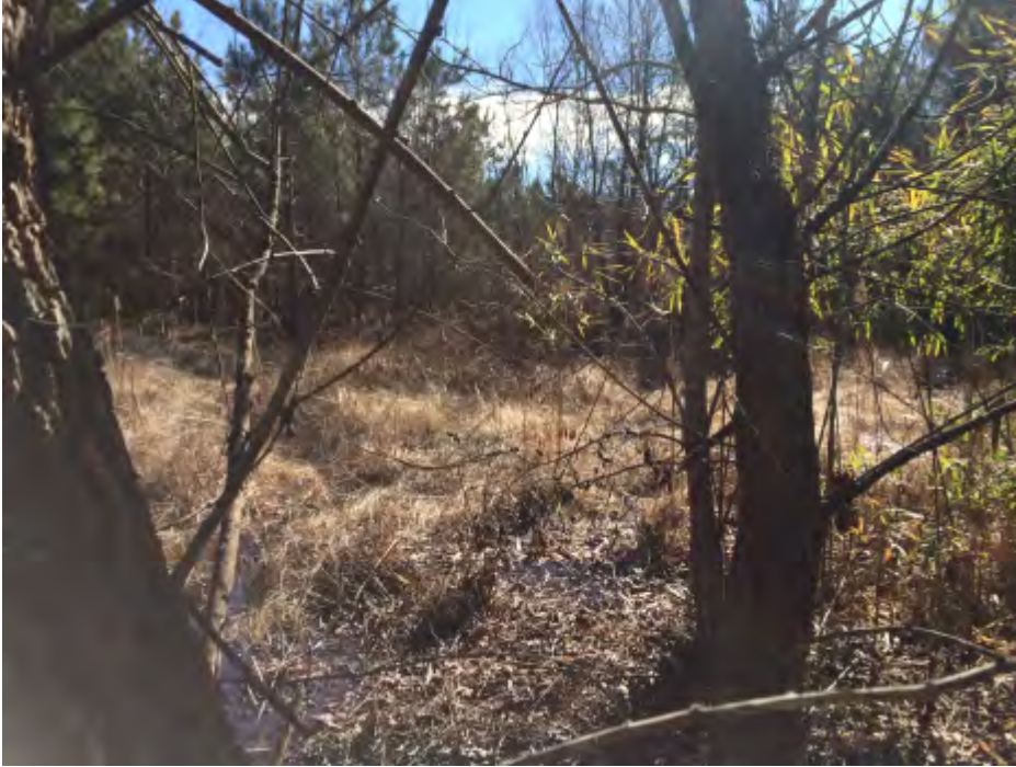
Photo 1 Wetland data point wsoa027s_w facing east