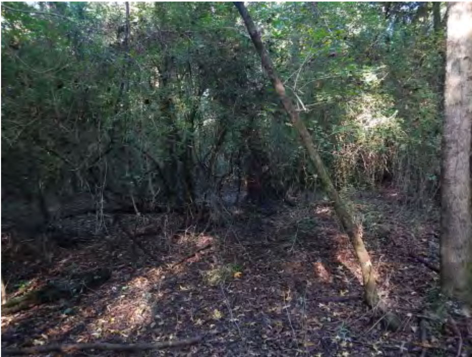
Photo 2 Upland data point WSOA007_u facing west