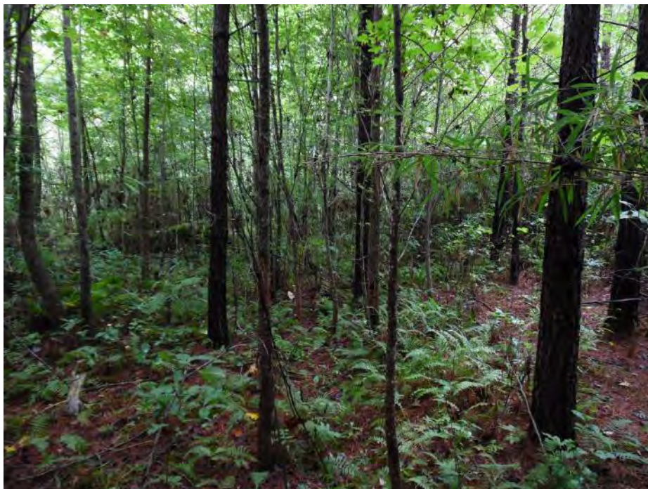
Upland data point wsol016_u facing south