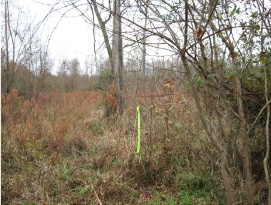
Photo 1 Wetland data point wsoa019s_w facing south