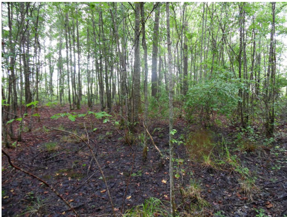
Wetland data point wsol025f_w1 facing west