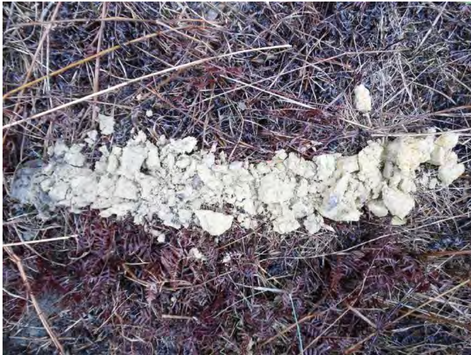
Wetland data point wsol015e_w soil sample