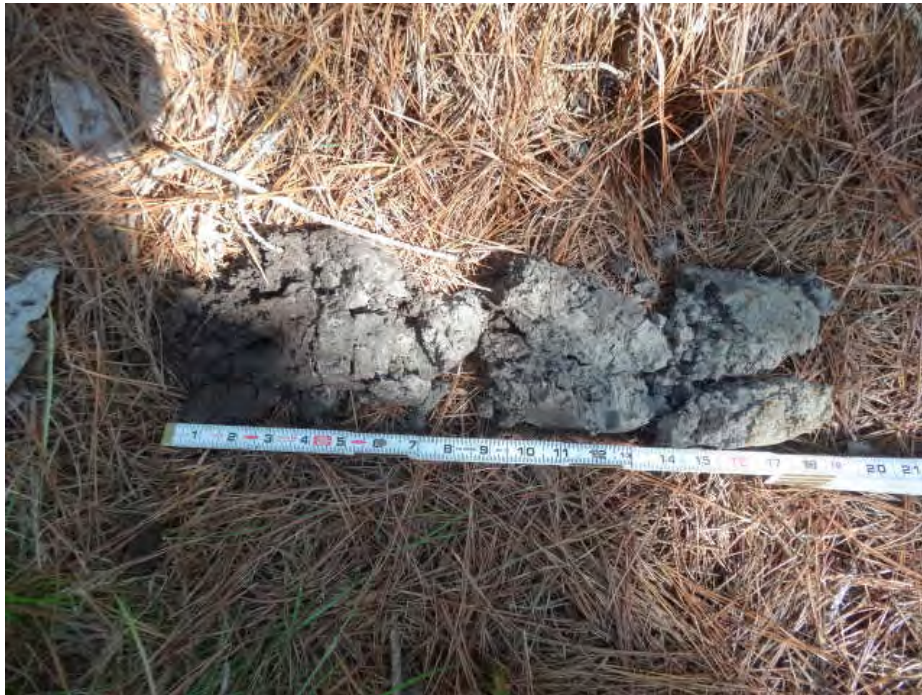
Wetland data point wsol012f_w soil sample