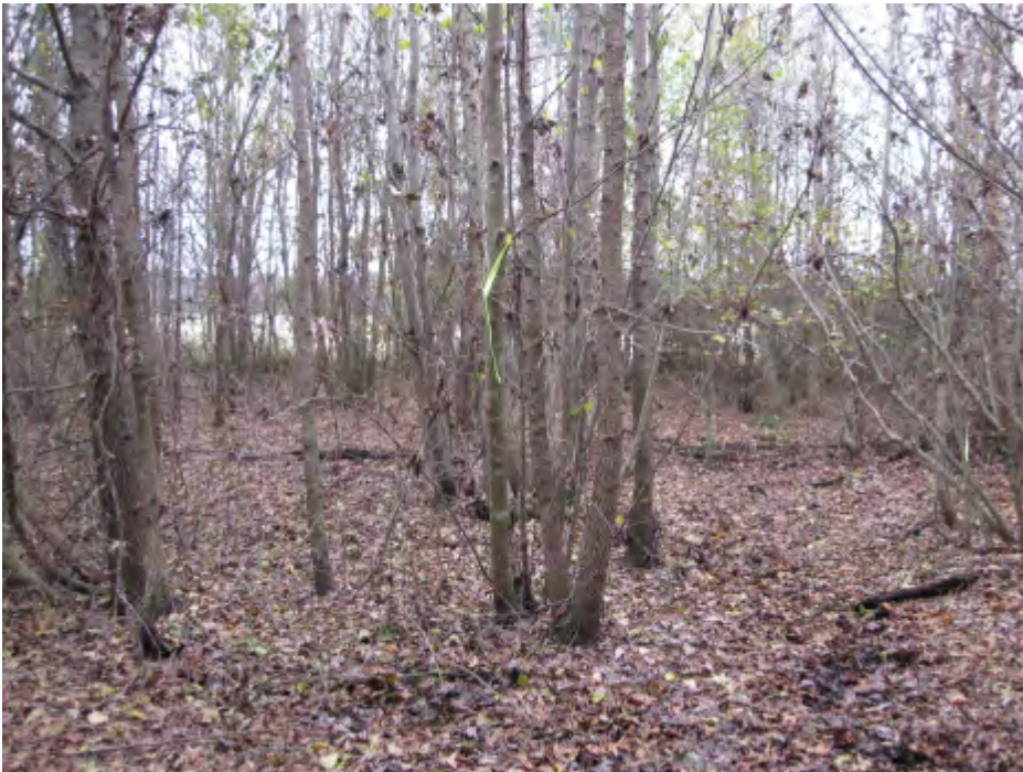
Photo 2 Wetland data point wsoa018f_w facing southwest