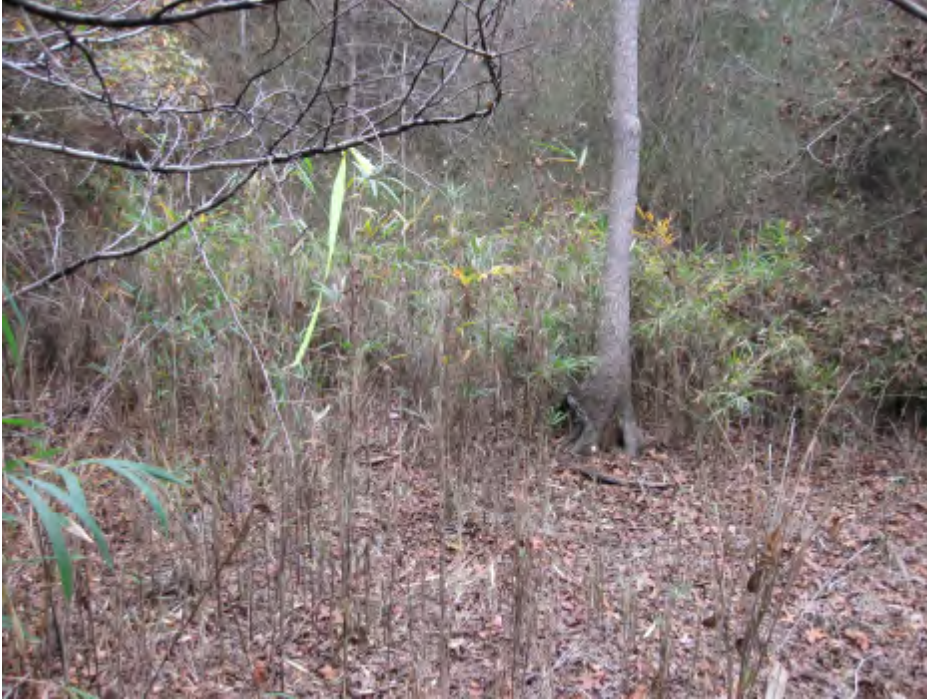
Photo 1 Wetland data point WSOA022f_w facing north