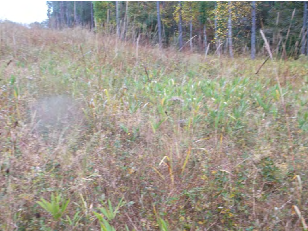
Upland data point wsop100_u facing northwest.