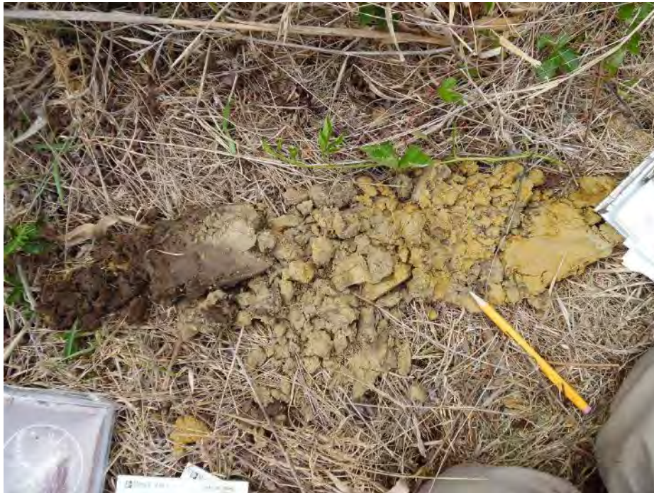
Wetland data point wsol013e_w soil sample