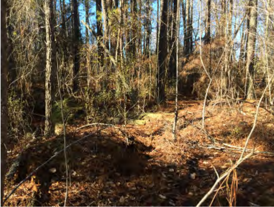
Photo 1 Wetland data point wsoa029f_w facing north