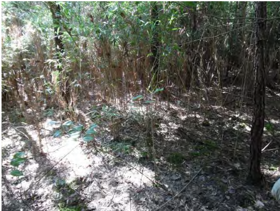
Wetland data point wsol020f_w facing south