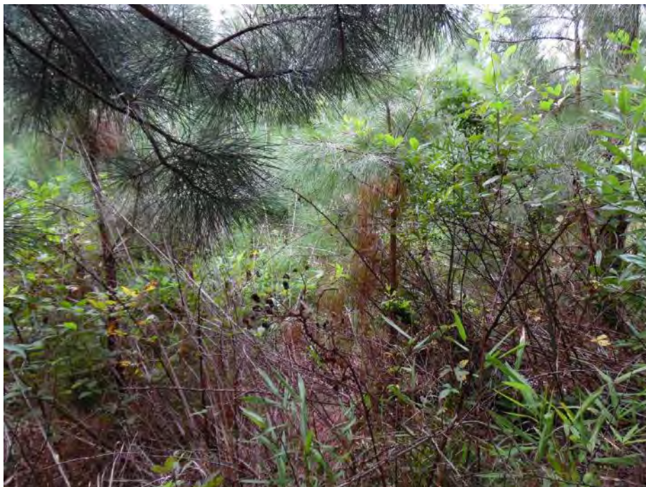
Upland data point wsol017_u facing south