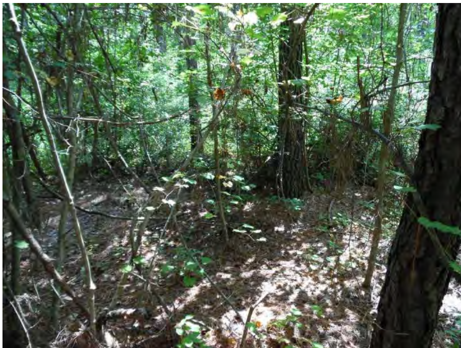
Upland data point wsol018_u facing south