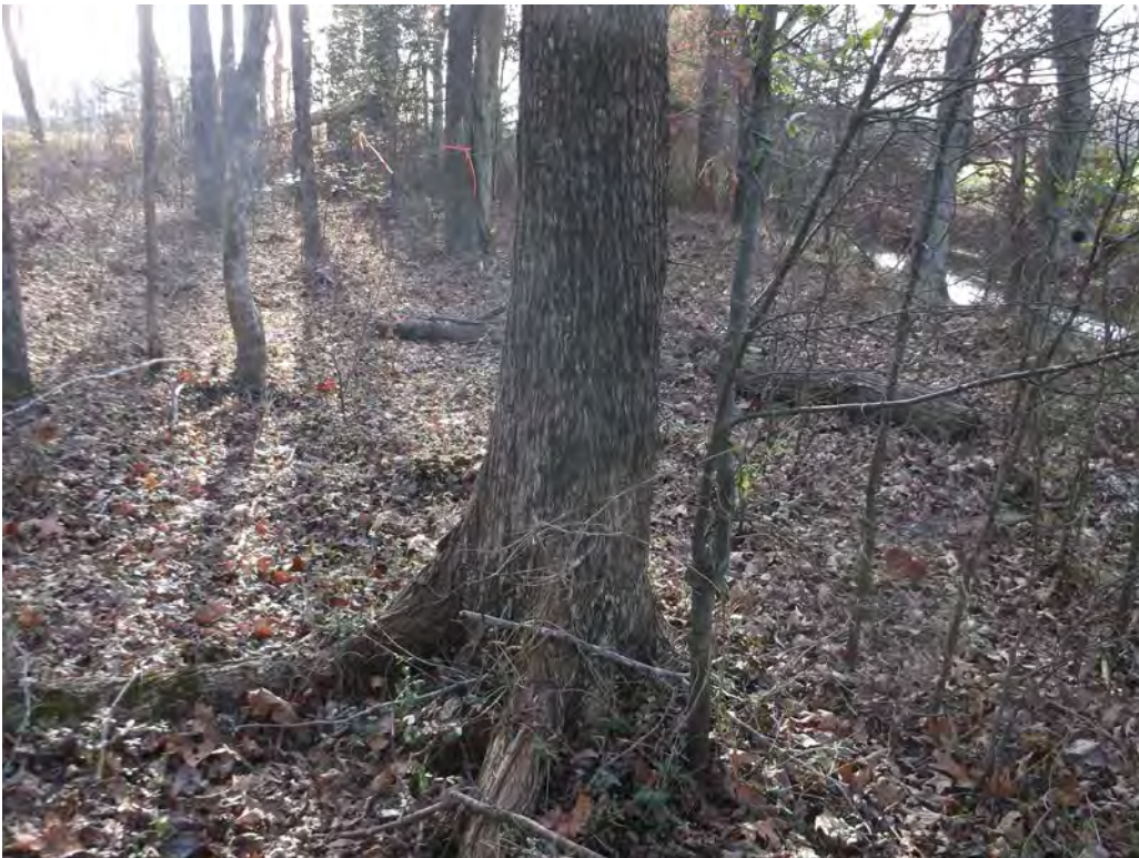
Upland data point wsoo010_u facing south.