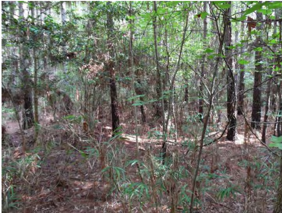
Upland data point wsol019_u facing north