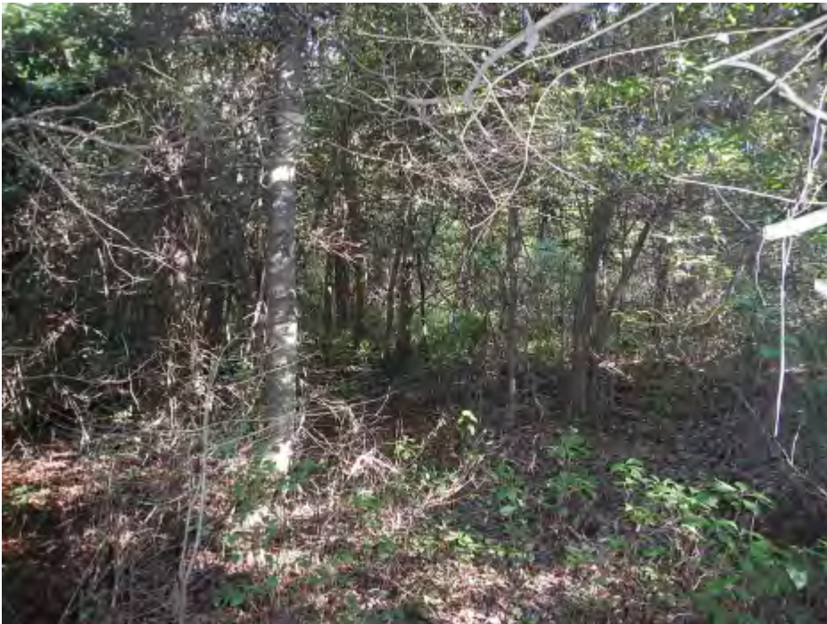
Photo 2 Upland data point WSOA001_u facing north