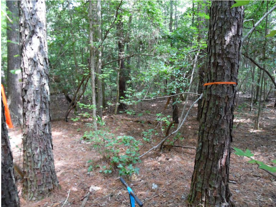
Upland data point wsol034_u facing east