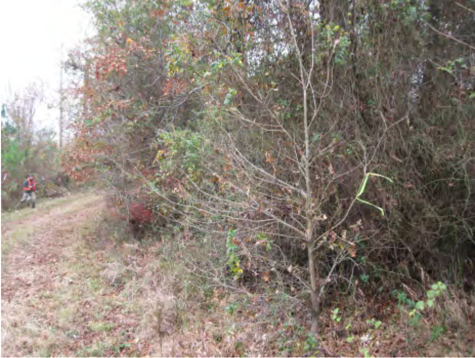
Photo 1 Upland data point wsoa019_u facing west