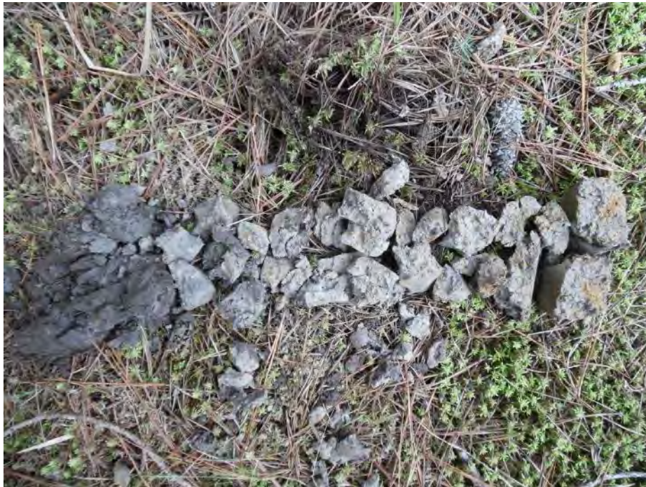
Wetland data point wsol019f_w soil sample