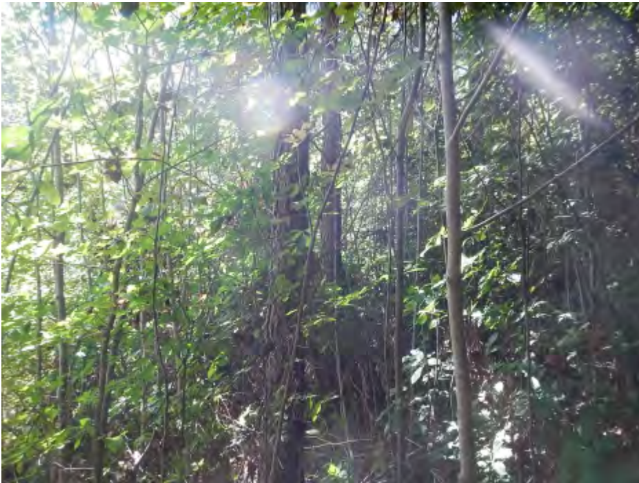
Photo 2 Upland data point WSOA004_u facing south