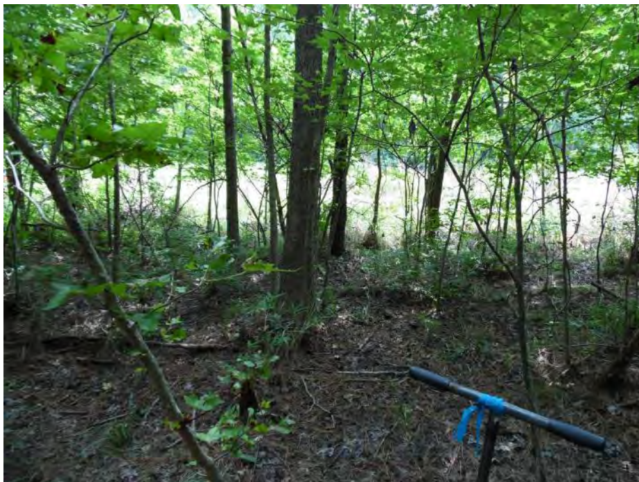
Wetland data point wsol014f_w facing south