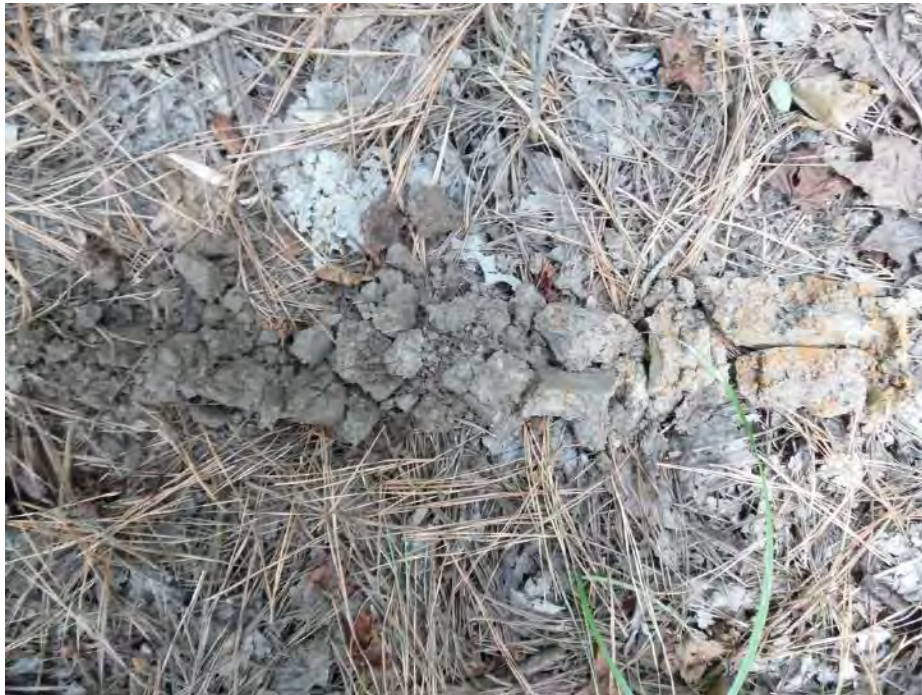
Wetland data point wsol014f_w soil sample