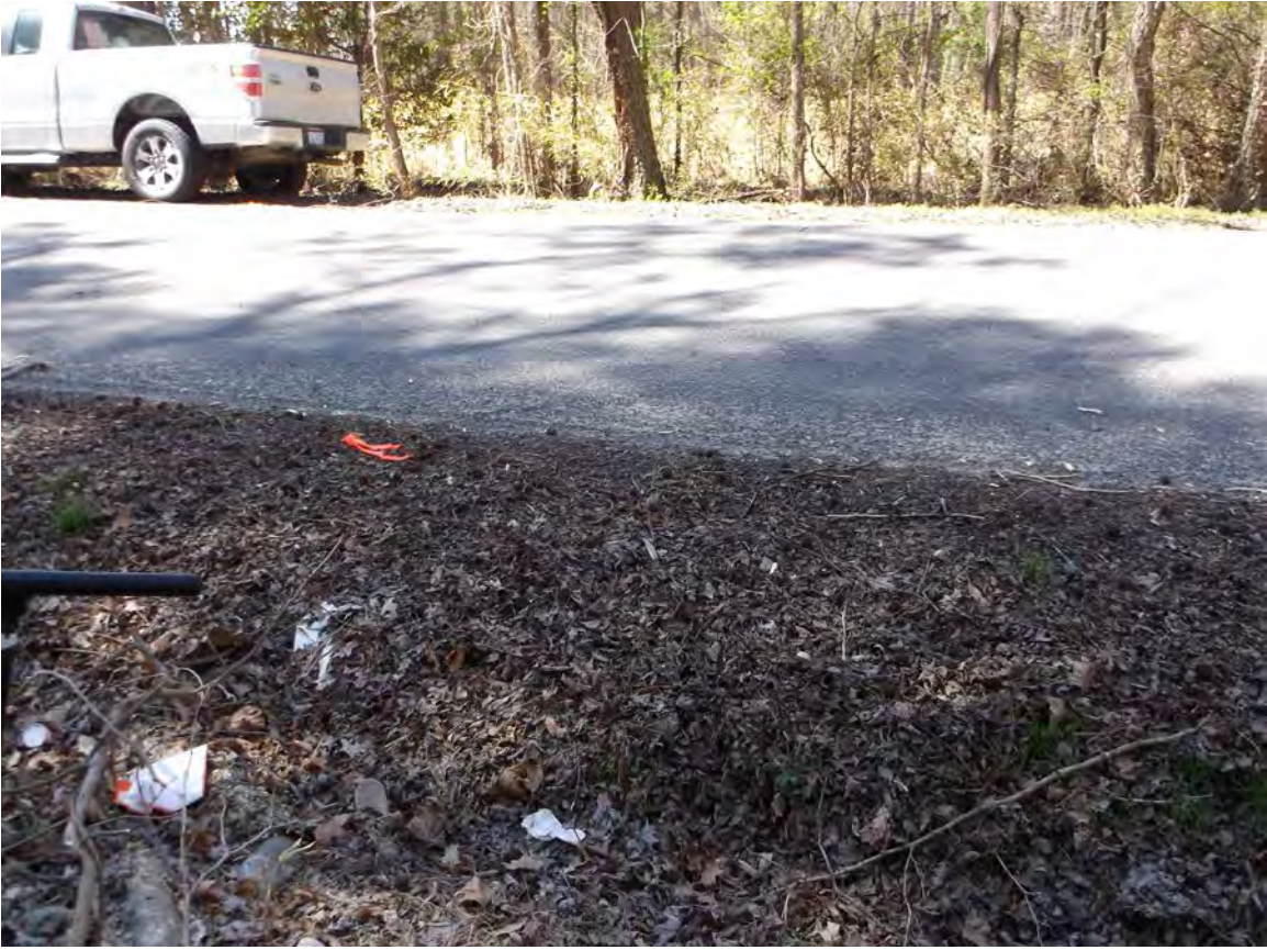
Upland data point wsop001_u facing north.