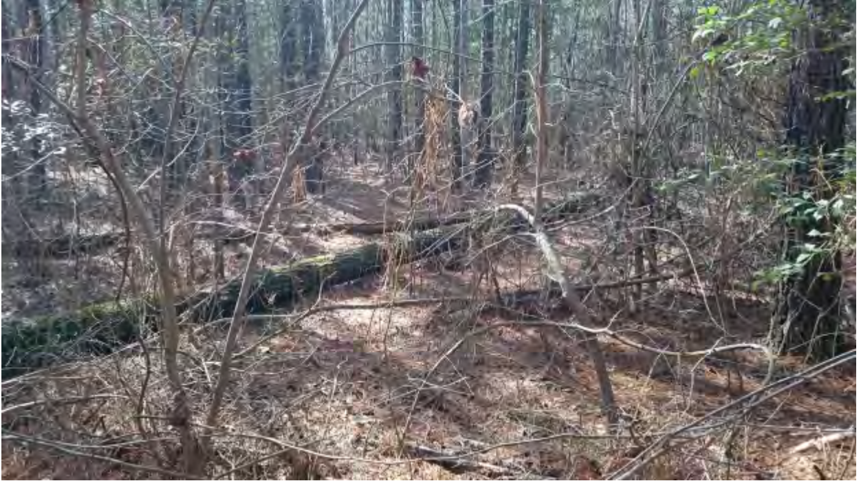
Photo 1 Upland data point wsoc008_u facing south