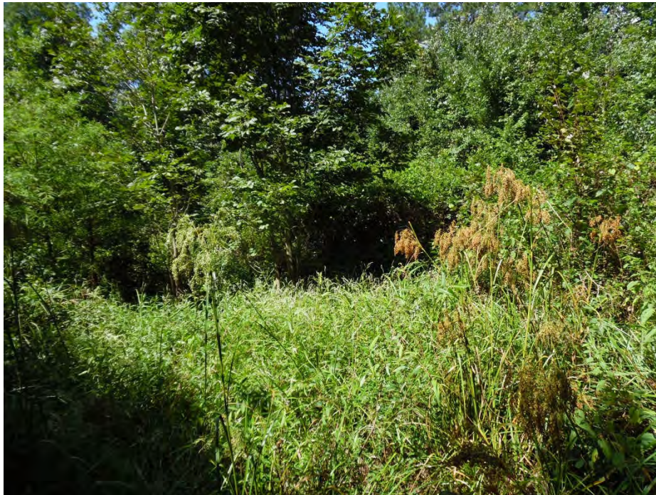
Wetland data point wsol028s_w facing north