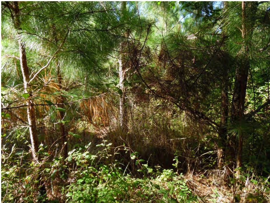
Upland data point wsol025_u facing south