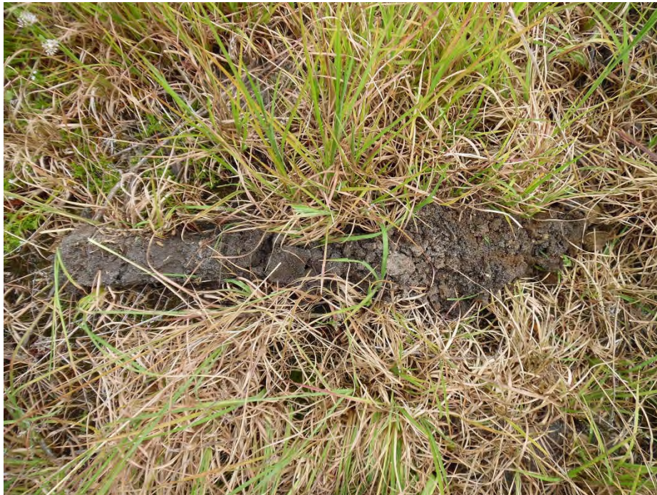
Upland data point wsol033_u soil sample