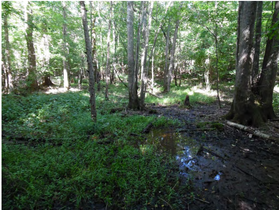
Wetland data point wsol031f_w facing east