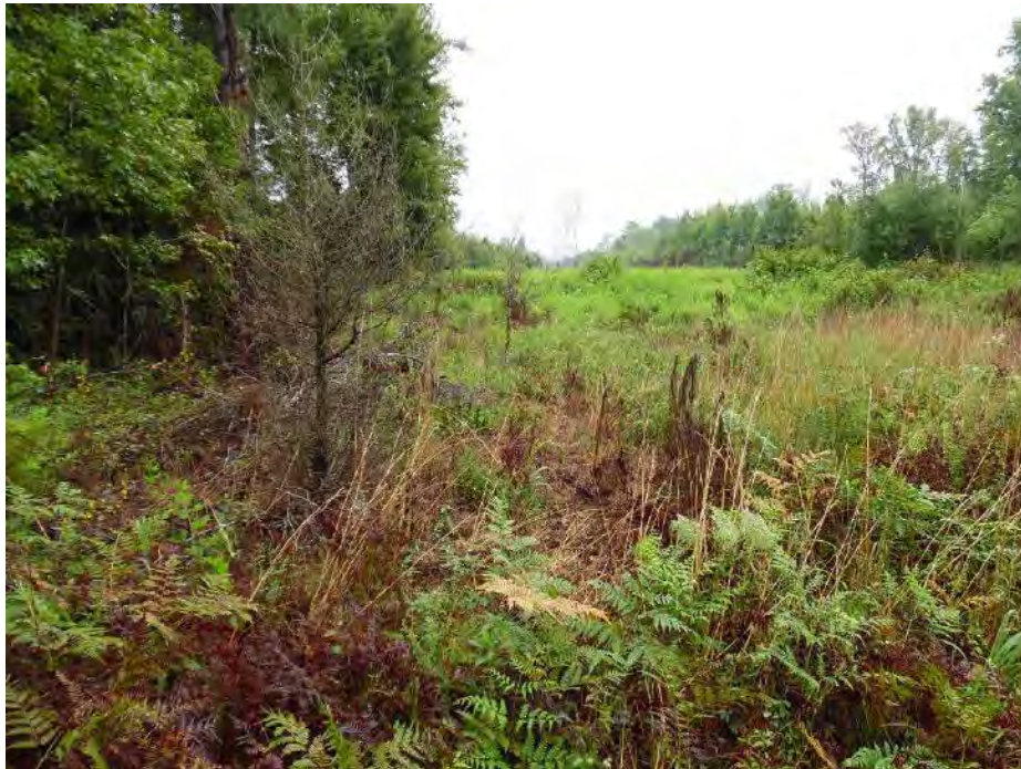
Wetland data point wsol015e_w facing east