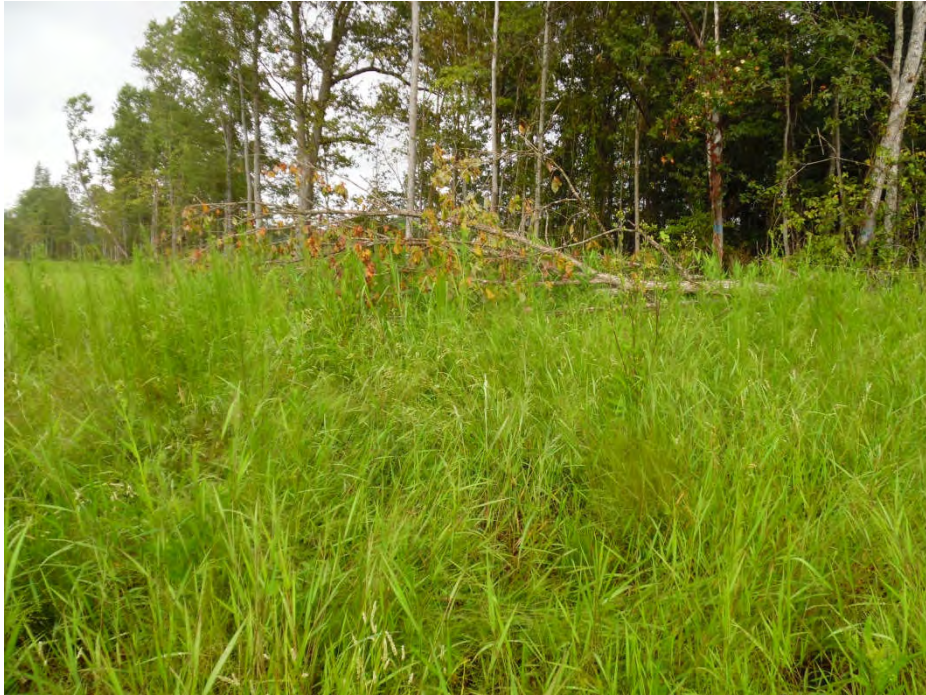
Wetland data point wsol025e_w facing north