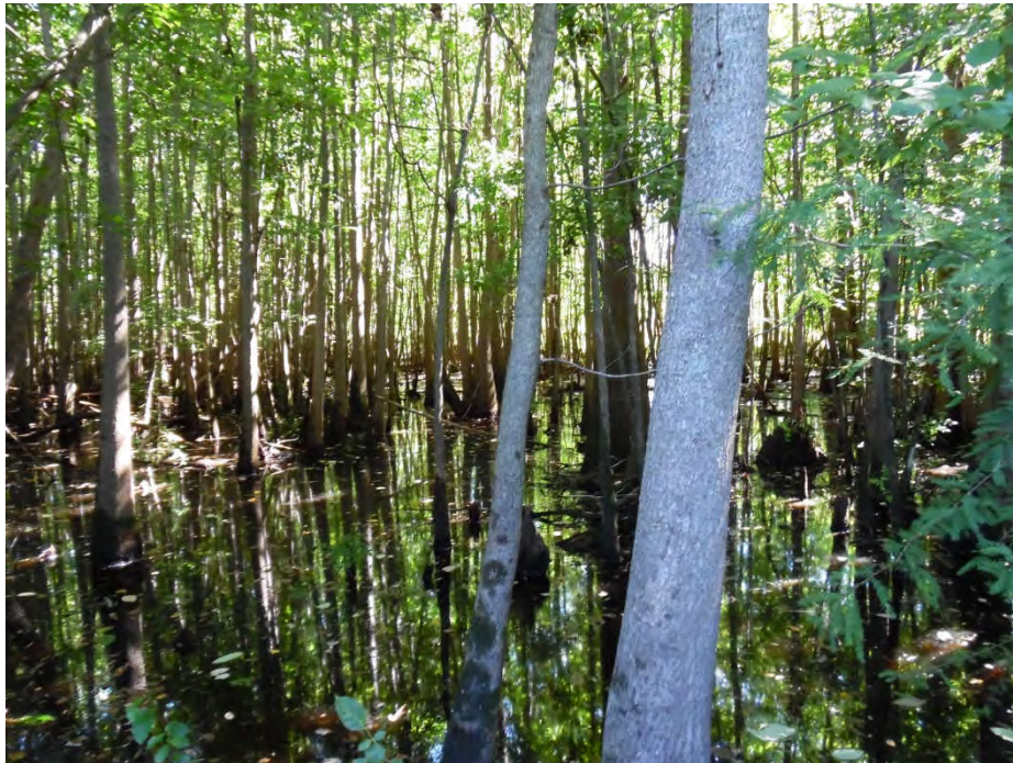
Wetland data point wsol029f_w facing east