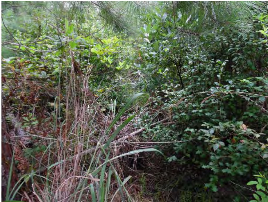
Wetland data point wsol017f_w facing east