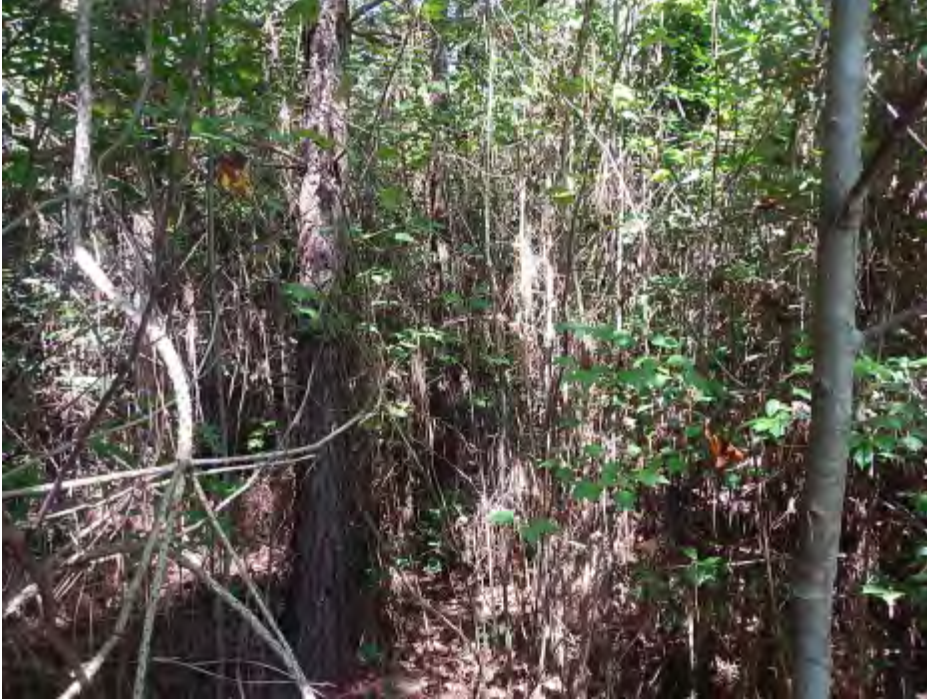
Photo 1 Upland data point WSOA004_u facing north