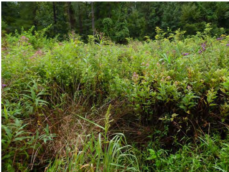
Upland data point wsol015_u facing south