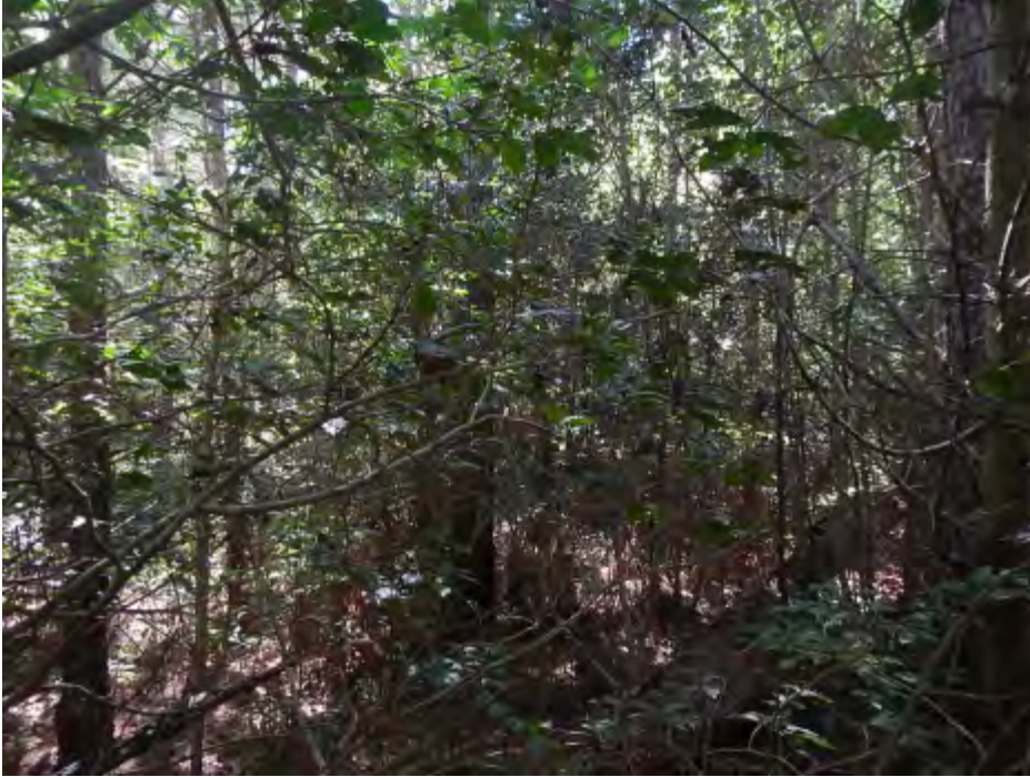
Photo 1 Upland data point WSOA003_u facing south