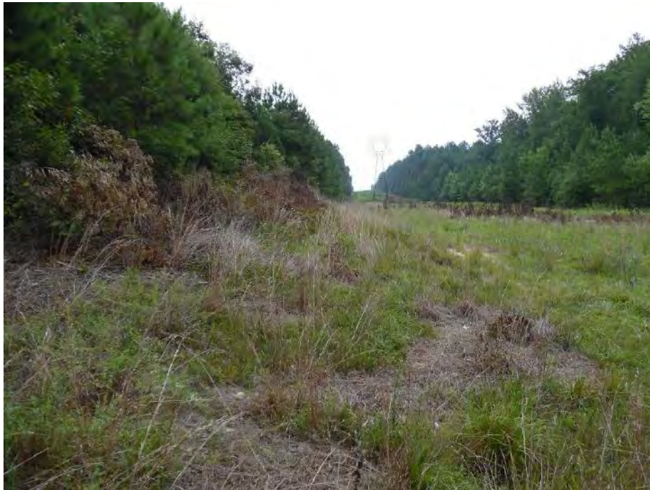
Upland data point wsol013_u facing east