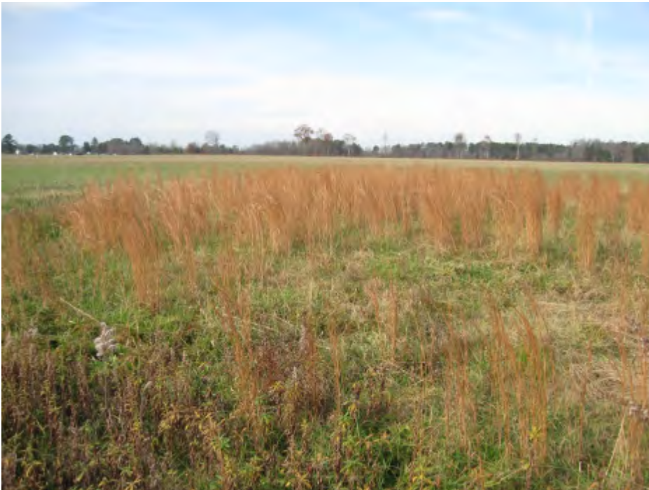
Photo 2 Wetland data point WSOA017e_w facing northwest