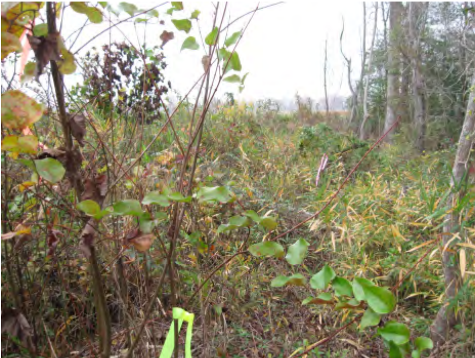
Photo 2 Upland data point wsoa017_u facing northeast