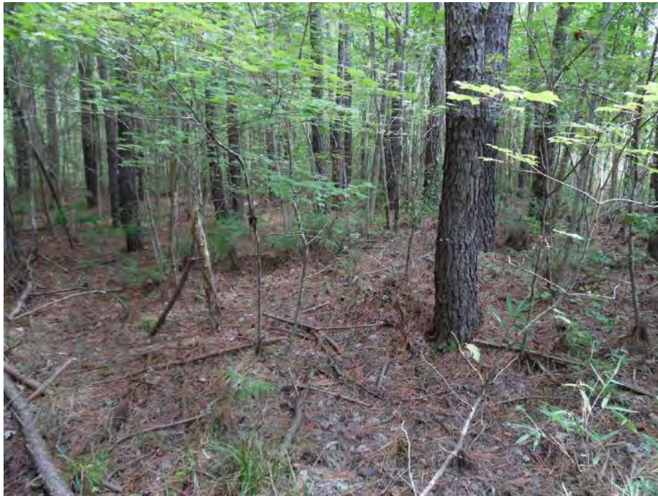
Wetland data point wsol014f_w facing east