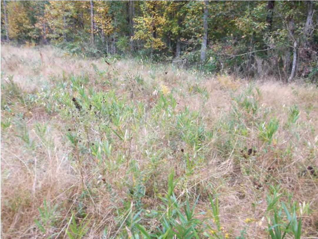
Wetland data point wsop100e_w facing northeast.