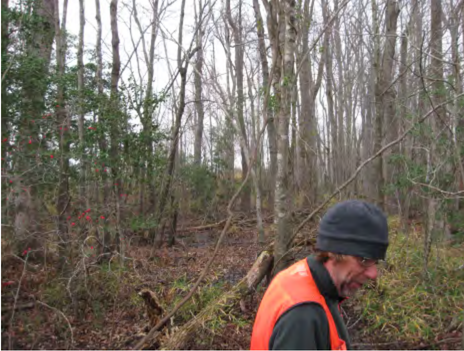
Photo 1 Wetland data point wsoa017f_w facing northeast