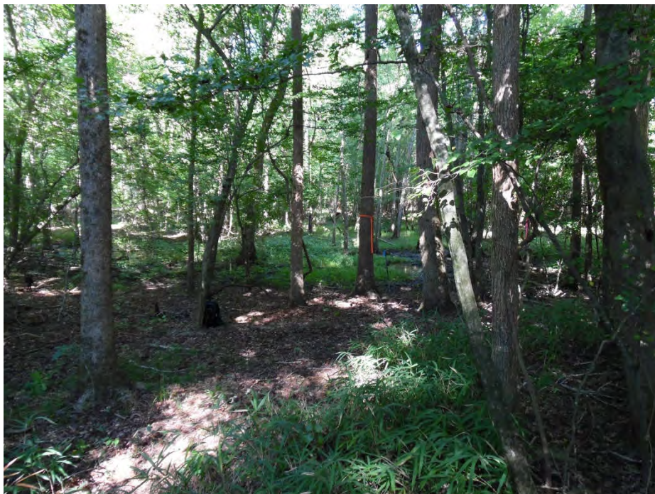
Upland data point wsol031_u facing east