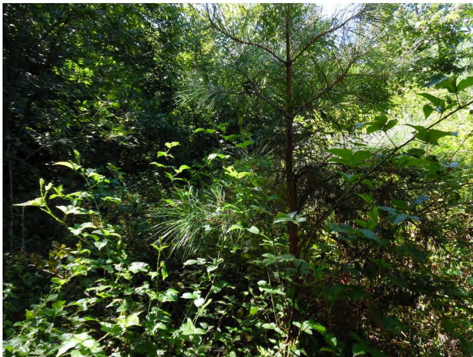
Upland data point wsol029_u facing south