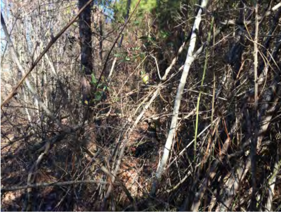
Photo 1 Upland data point wsoa025_u facing north