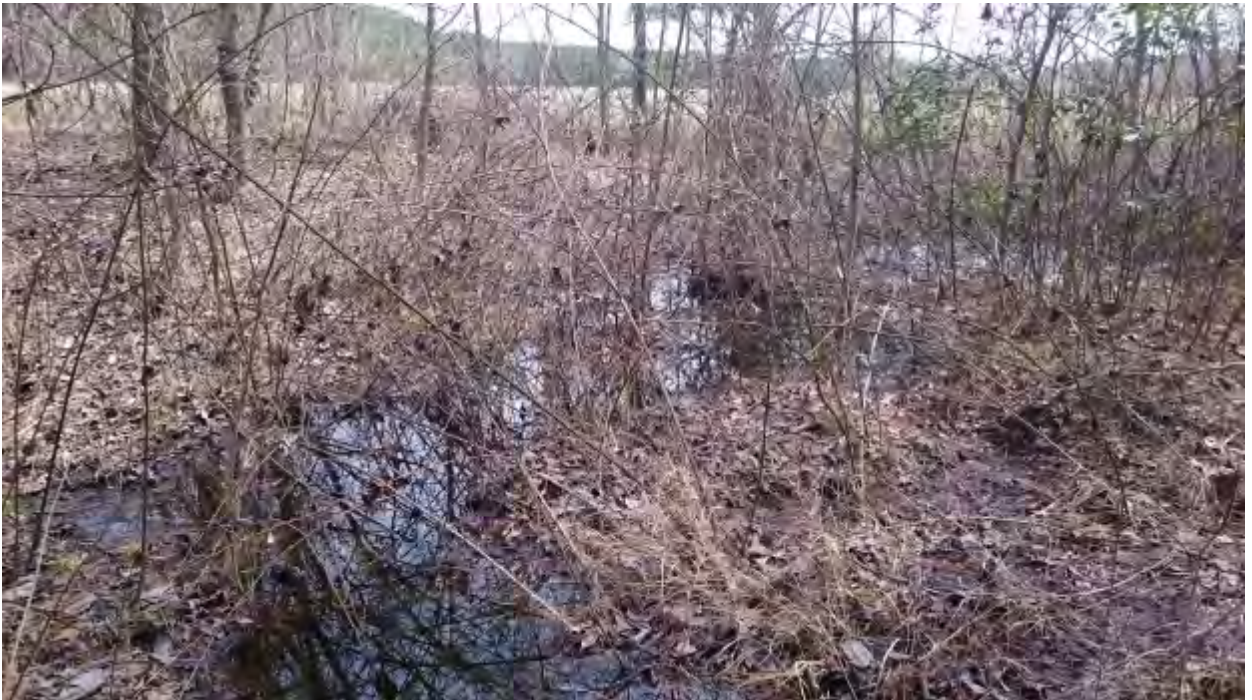
Photo 2 Wetland data point wsoc009f_w facing southeast