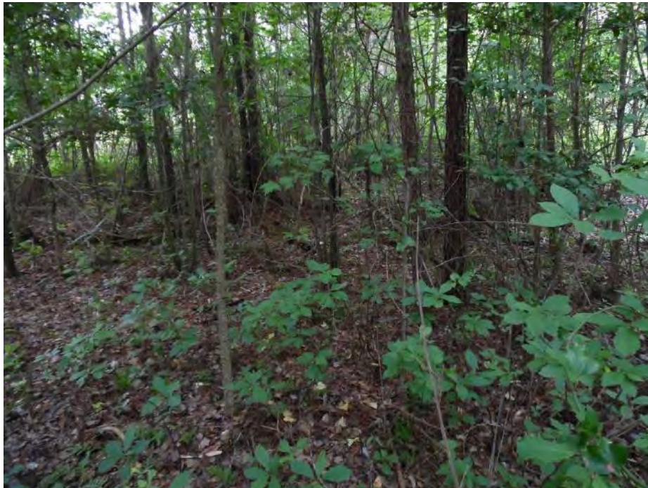
Wetland data point wsol013f_w facing east