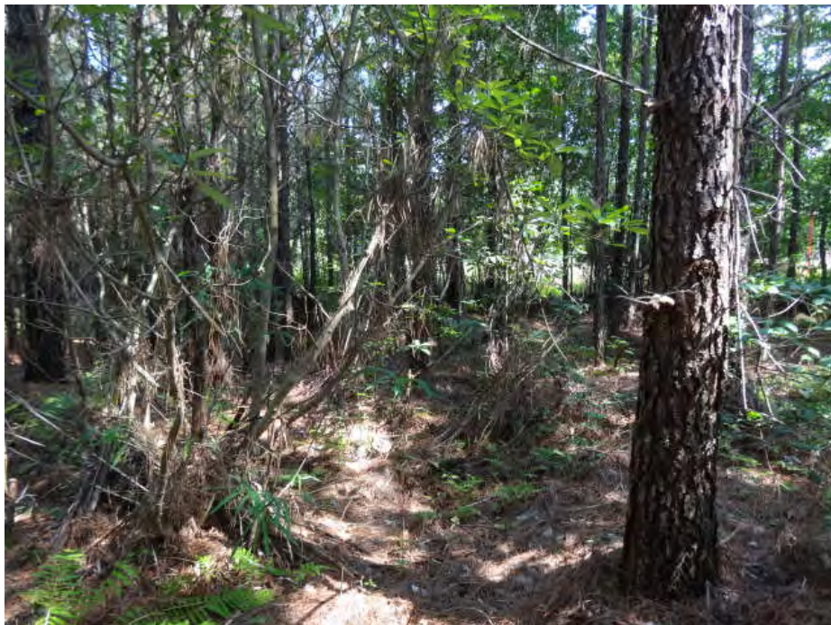
Wetland data point wsol012f_w facing South