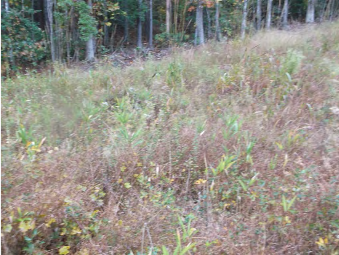
Upland data point wsop100_u facing southwest.