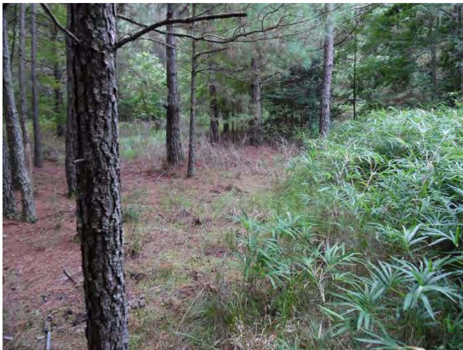
Wetland data point wsol019f_w facing south