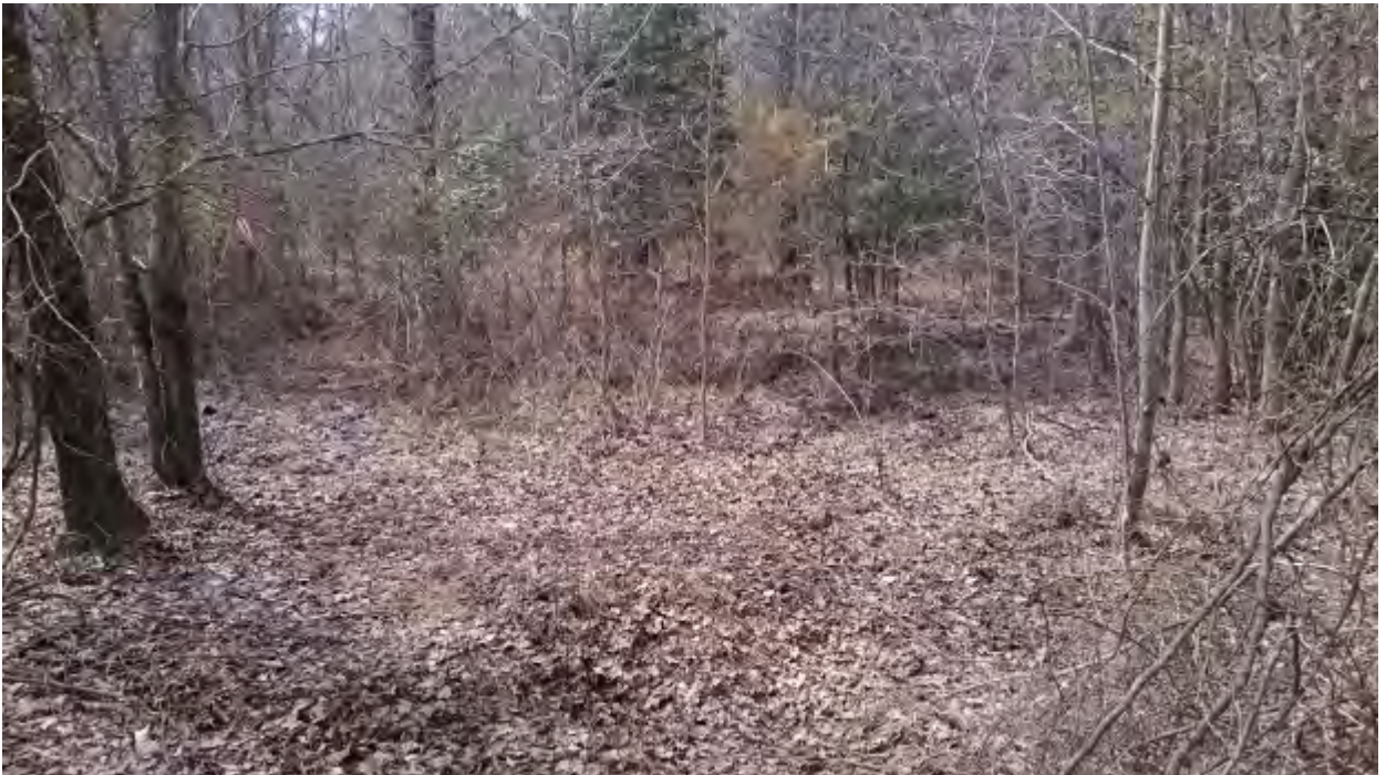
Photo 2 Upland data point wsoc009_u facing southwest