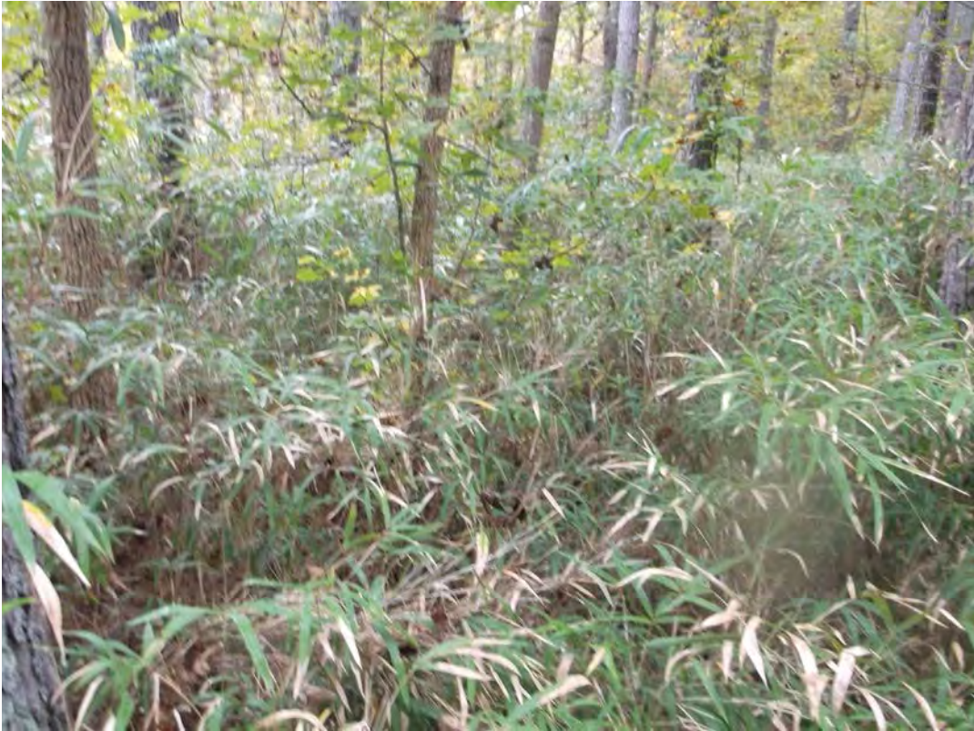
Wetland data point wsop100f_w facing west.