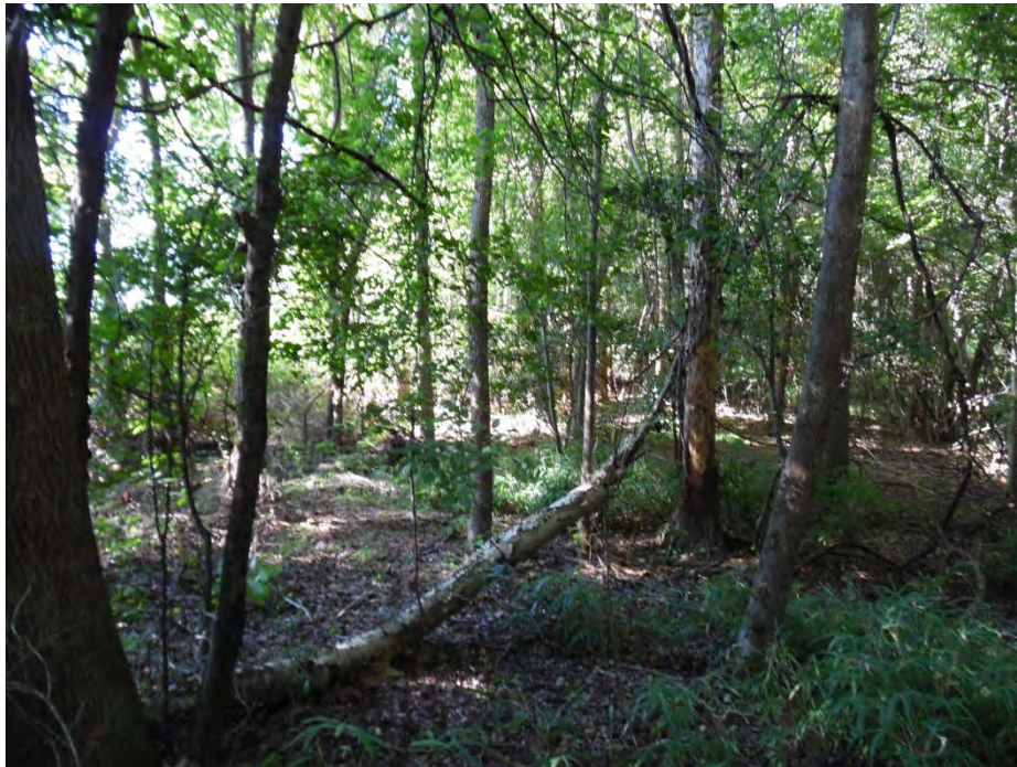
Upland data point wsol031_u facing north