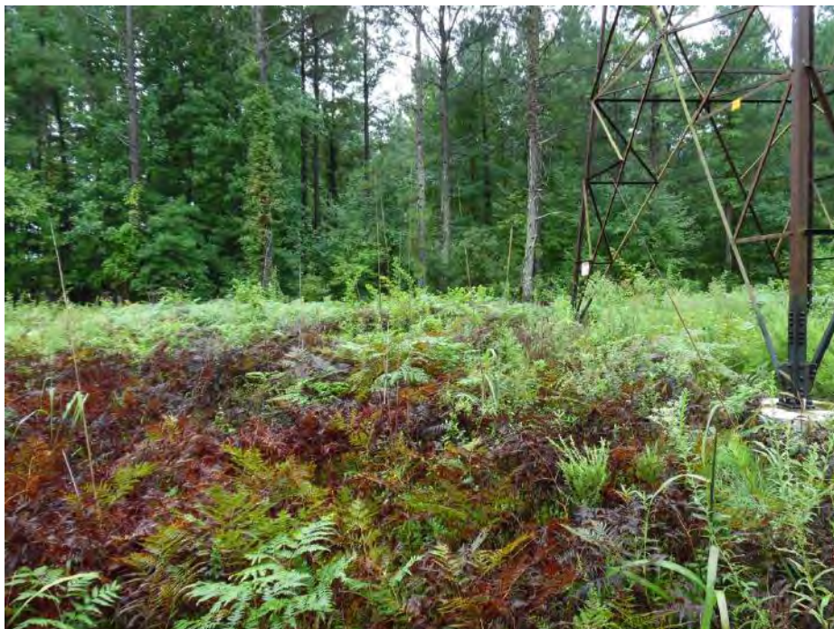
Wetland data point wsol015e_w facing south