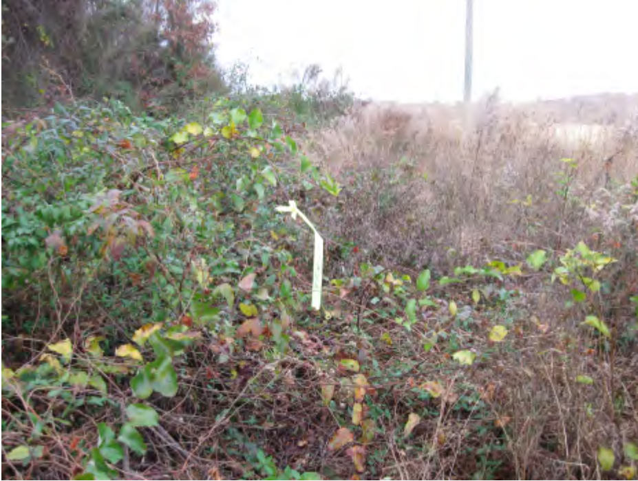
Photo 1 Upland data point wsoa020_u facing north