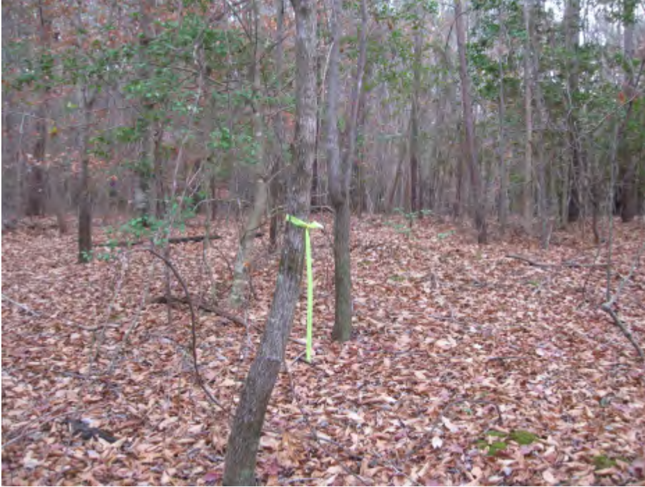
Photo 1 Upland data point wsoa023_u facing east