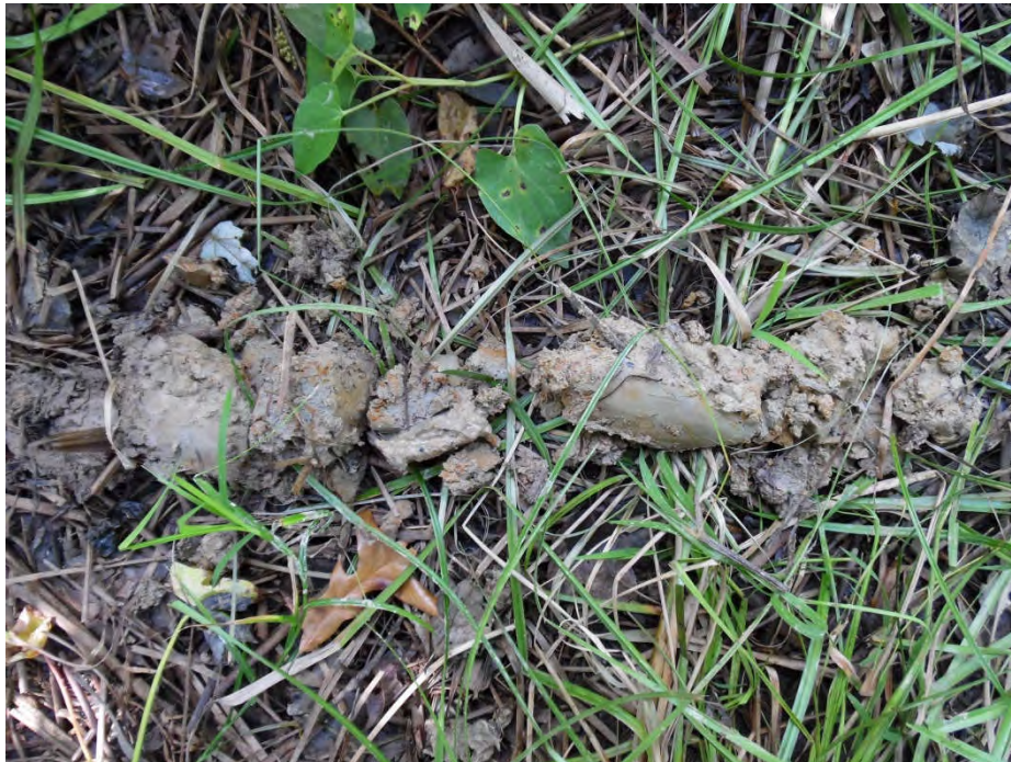
Wetland data point wsol029s_w soil sample