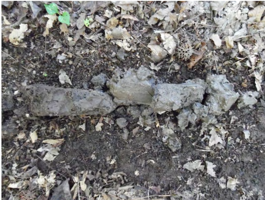
Wetland data point wsol031f_w soil sample