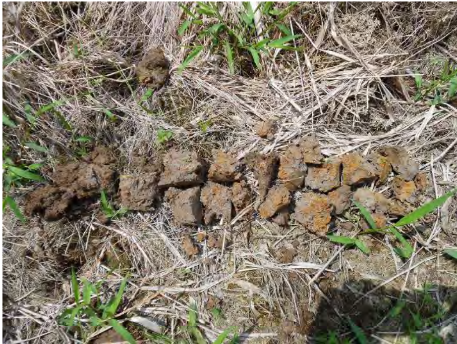
Wetland data point wsol014e_w soil sample