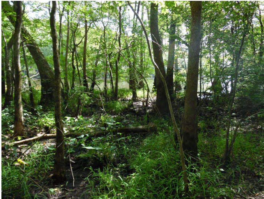
Wetland data point wsol026f_w facing east