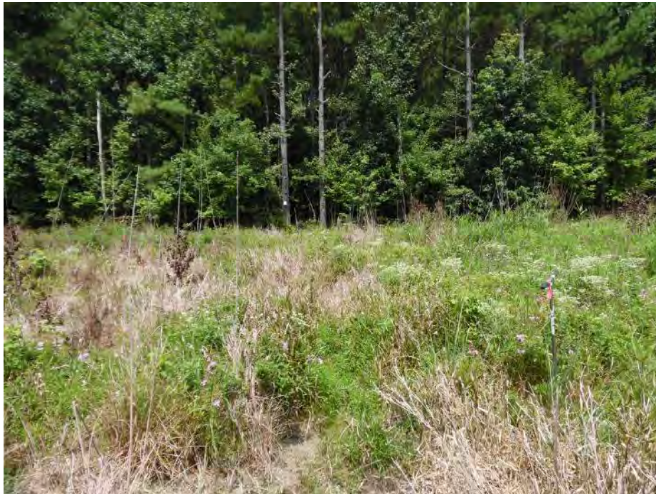
Wetland data point wsol014e_w facing north