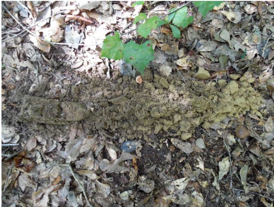
Upland data point wsol026_u soil sample