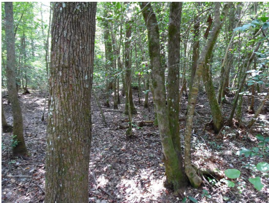
Wetland data point wsol034f_w facing south