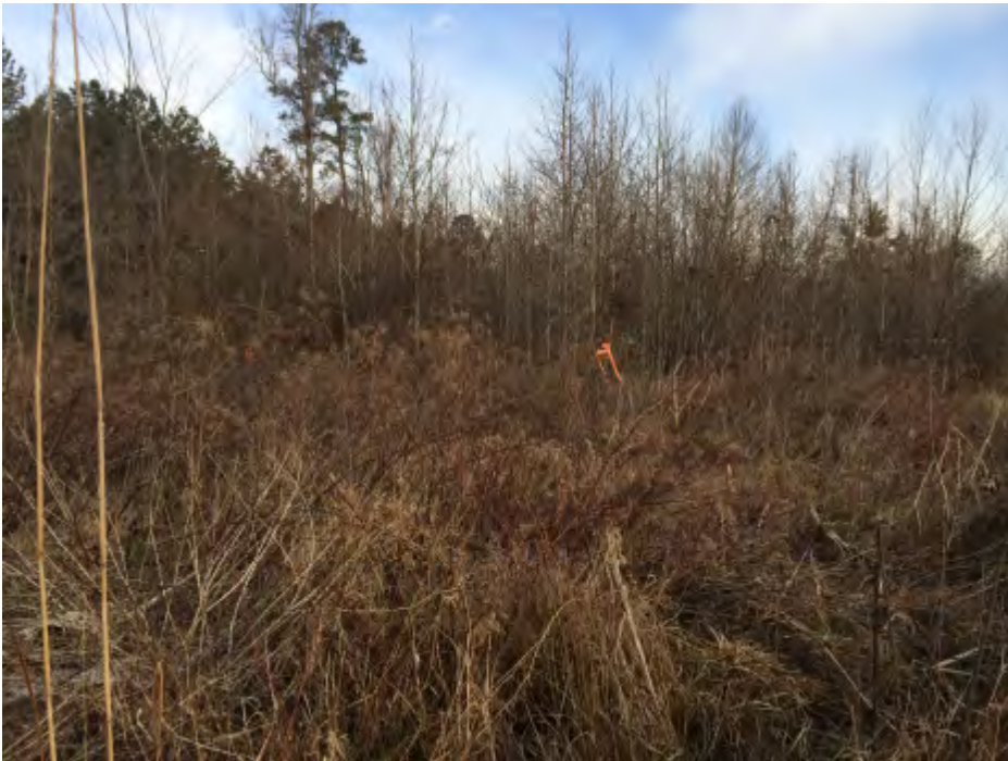
Photo 2 Wetland data point WSOA033e_w facing north