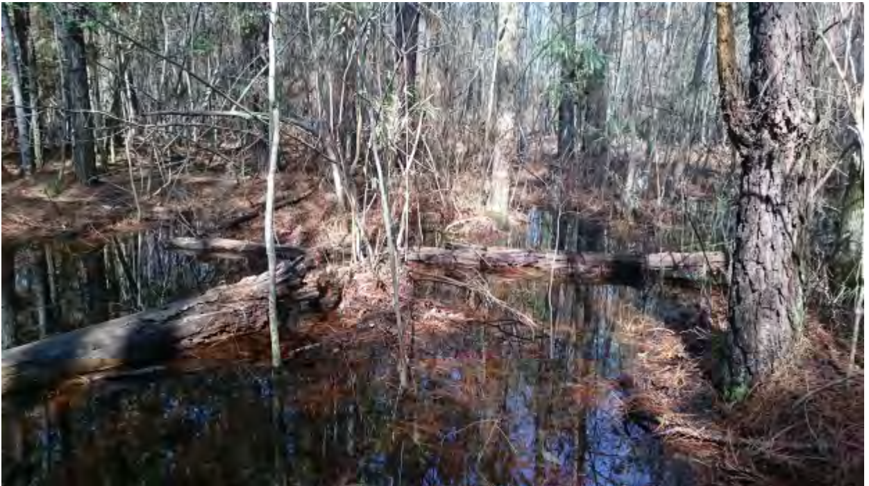
Photo 2 Wetland data point wsoc008f_w facing northwest