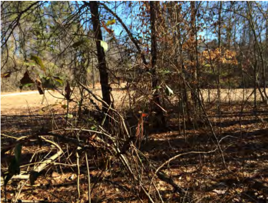
Photo 2 Upland data point wsoa029_u facing south