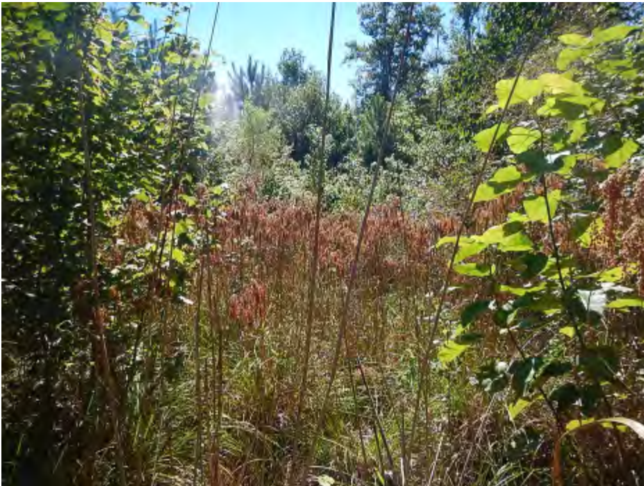
Photo 2 Wetland data point WSOA004f_w facing south