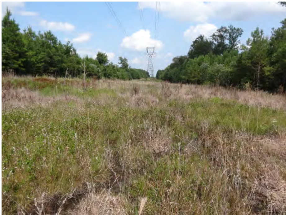
Wetland data point wsol012e_w facing East