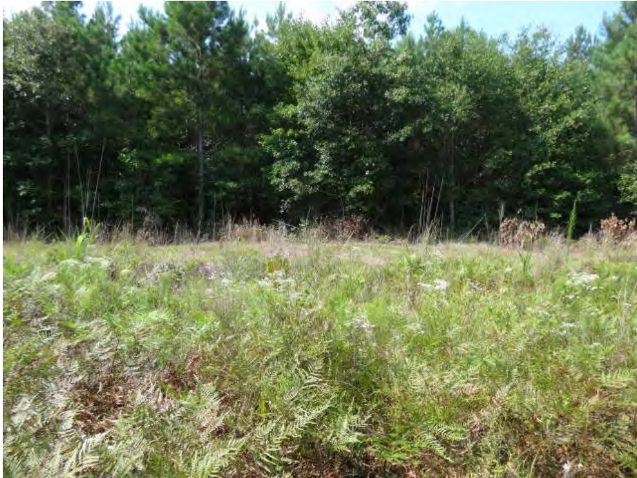
Upland data point wsol012_u facing North