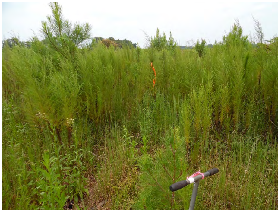
Upland data point wsol033_u facing west