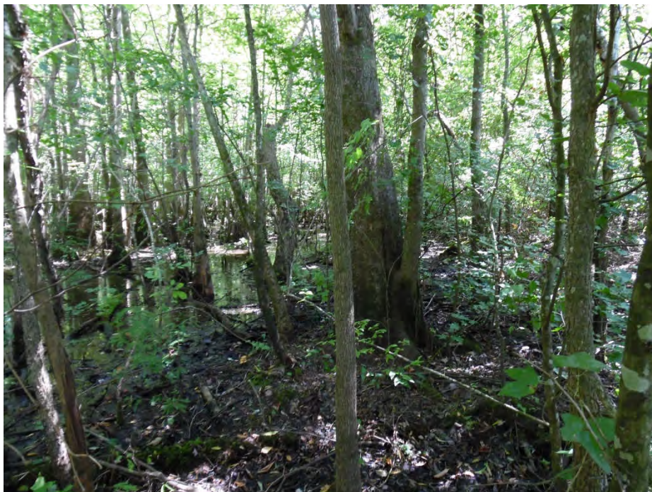
Wetland data point wsol030f_w facing south