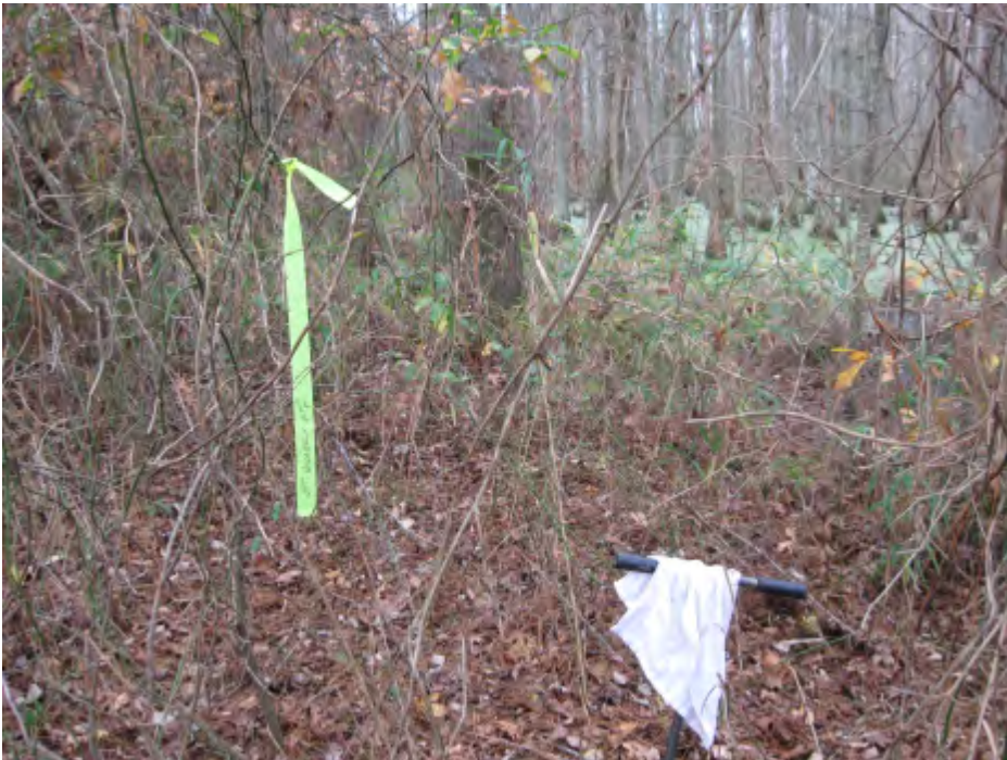
Photo 2 Upland data point WSOA021_u facing west