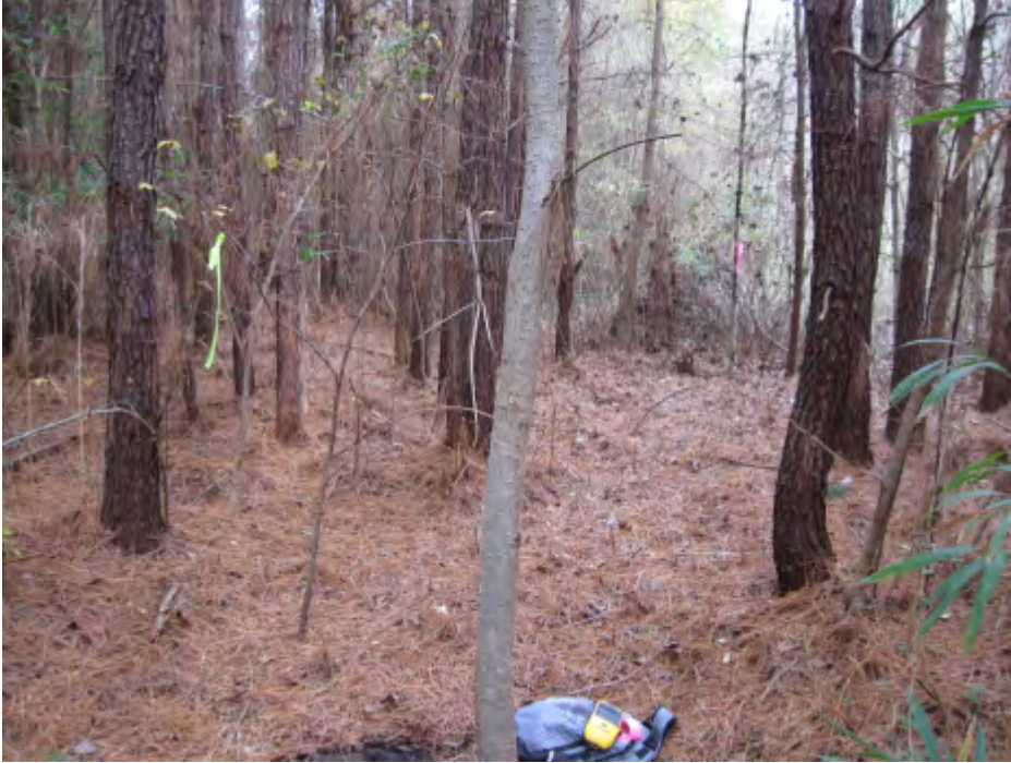
Photo 1 Upland data point WSOA022_u facing north