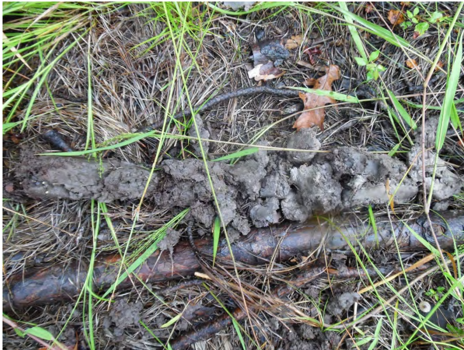
Wetland data point wsol025e_w soil sample