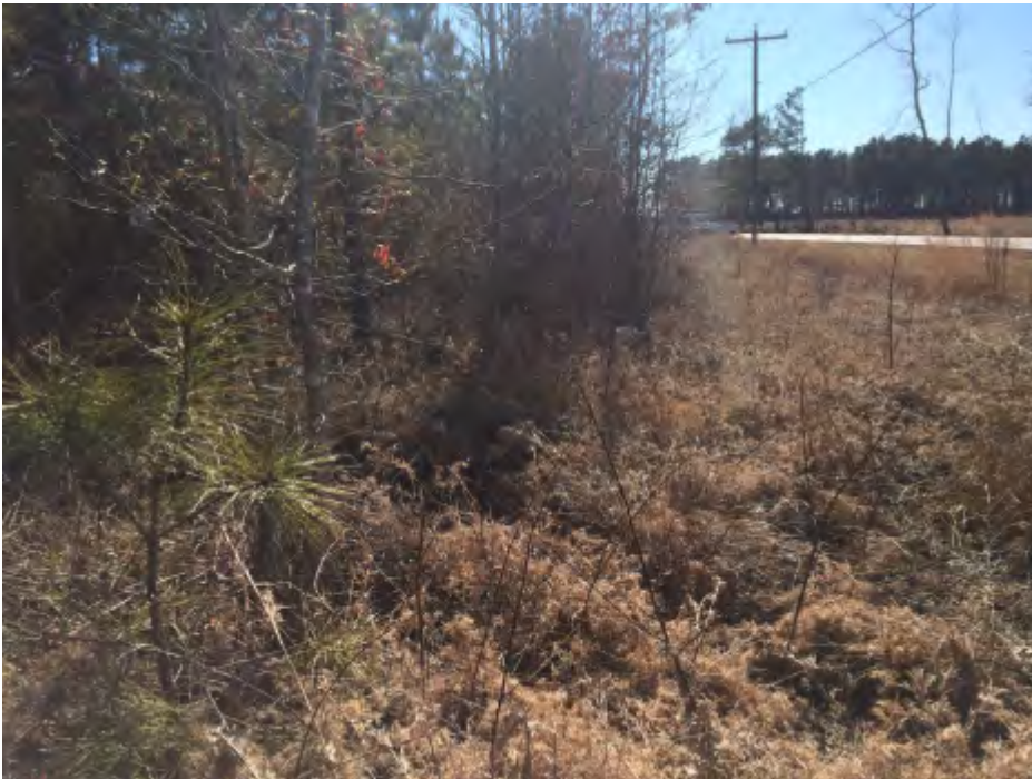
Photo 2 Wetland data point wsoa025e_w facing south