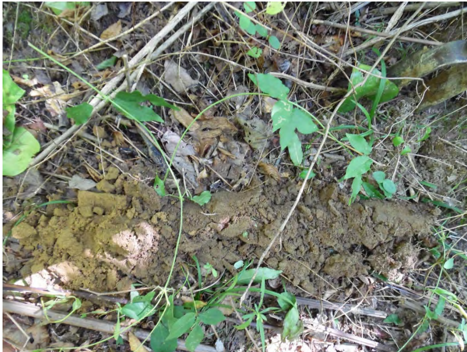
Upland data point wsol028_u soil sample