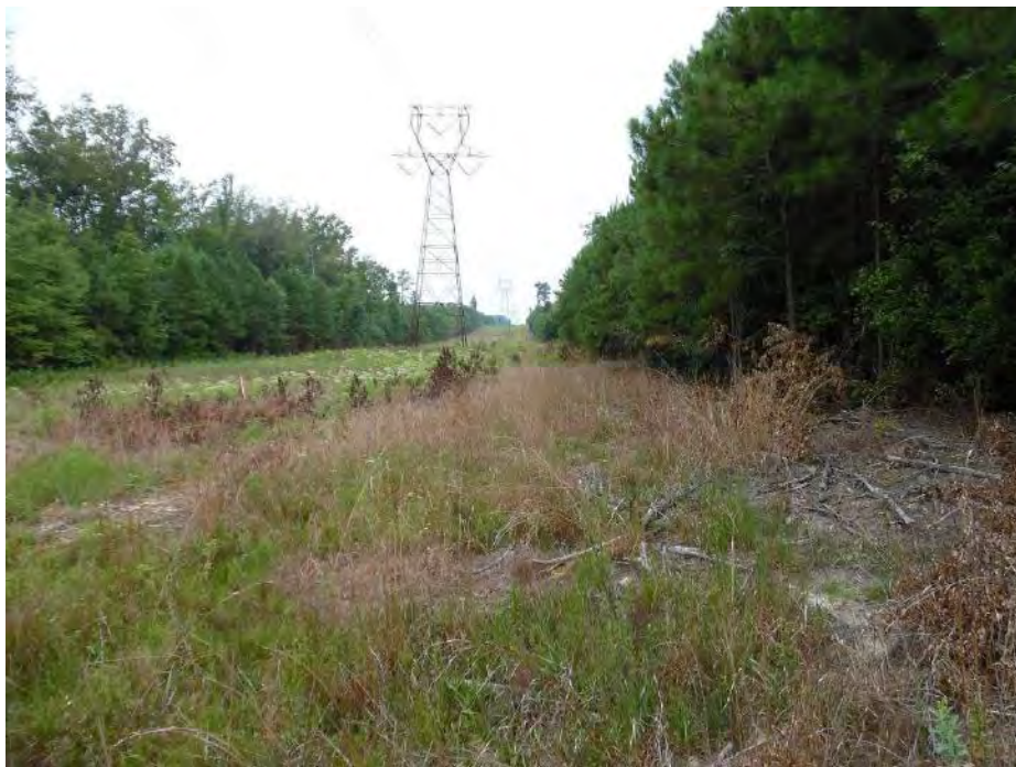
Upland data point wsol013_u facing west