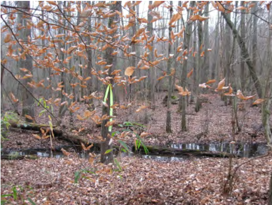
Photo 2 Upland data point WSOA024_u facing southeast