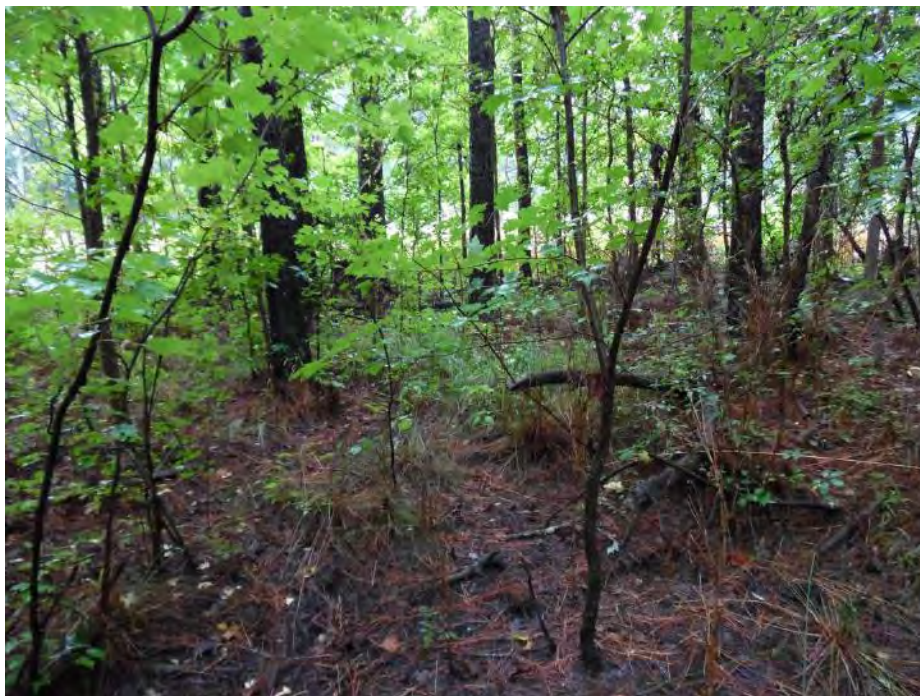
Wetland data point wsol015f_w facing south