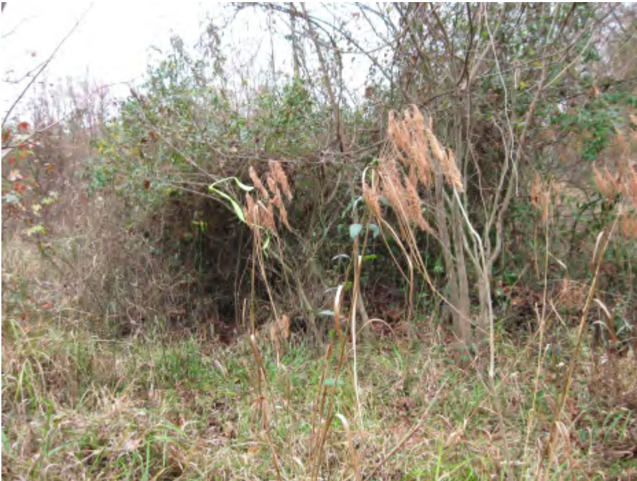
Photo 2 Wetland data point wsoa019s_w facing west