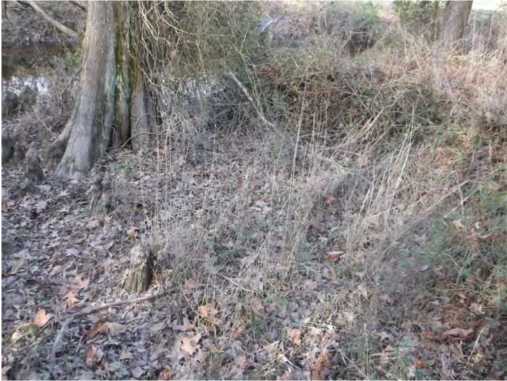
Wetland data point wsoo010f_w facing northwest.