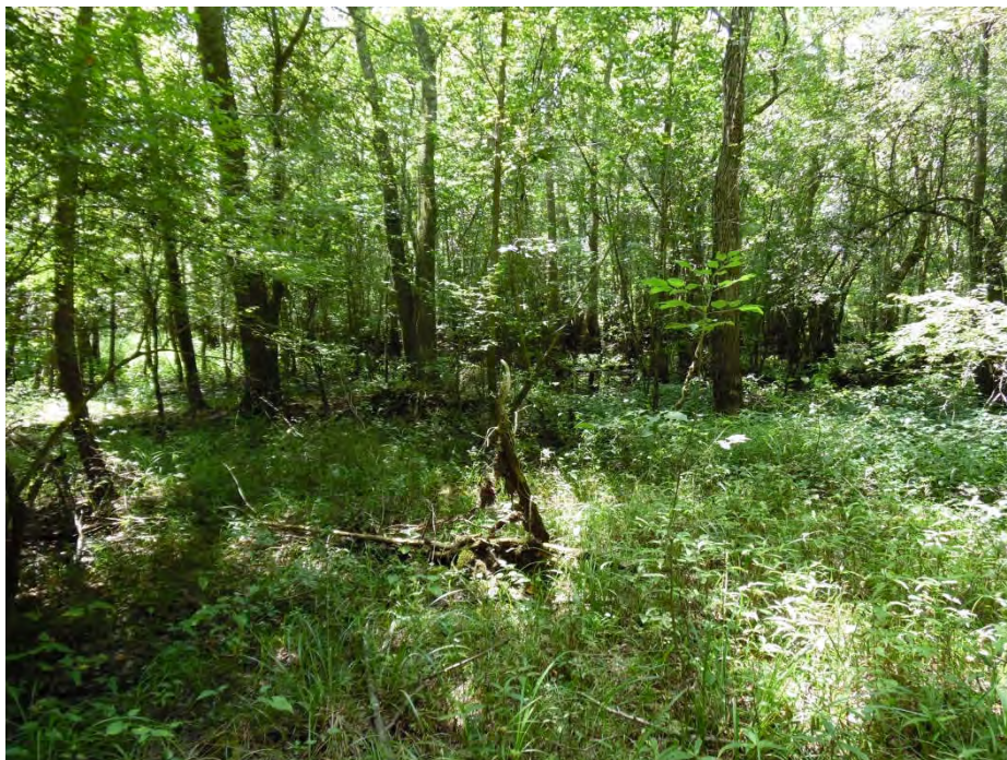
Wetland data point wsol027f_w facing south