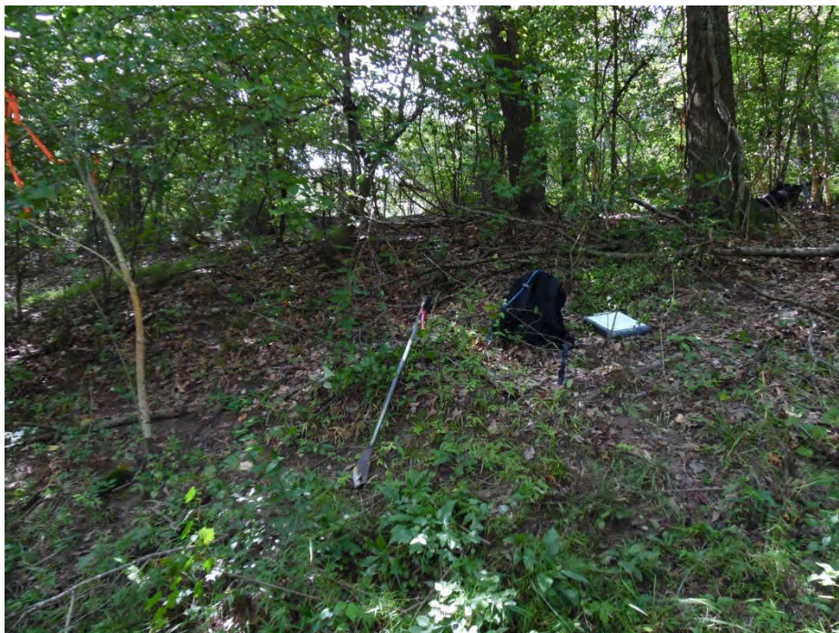
Wetland data point wsol026f_w facing south