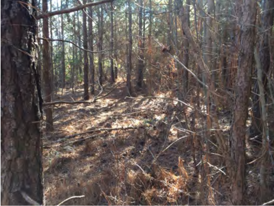
Photo 1 Upland data point wsoa027_u facing east