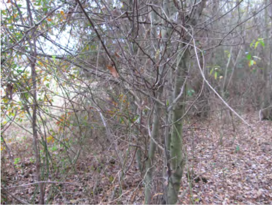
Photo 1 Upland data point wsoa018_u facing northwest