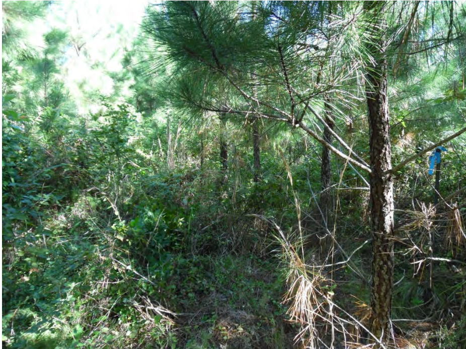
Upland data point wsol025_u facing north