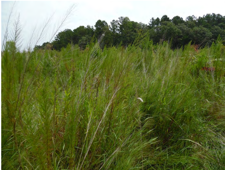
Wetland data point wsol033e_w facing east