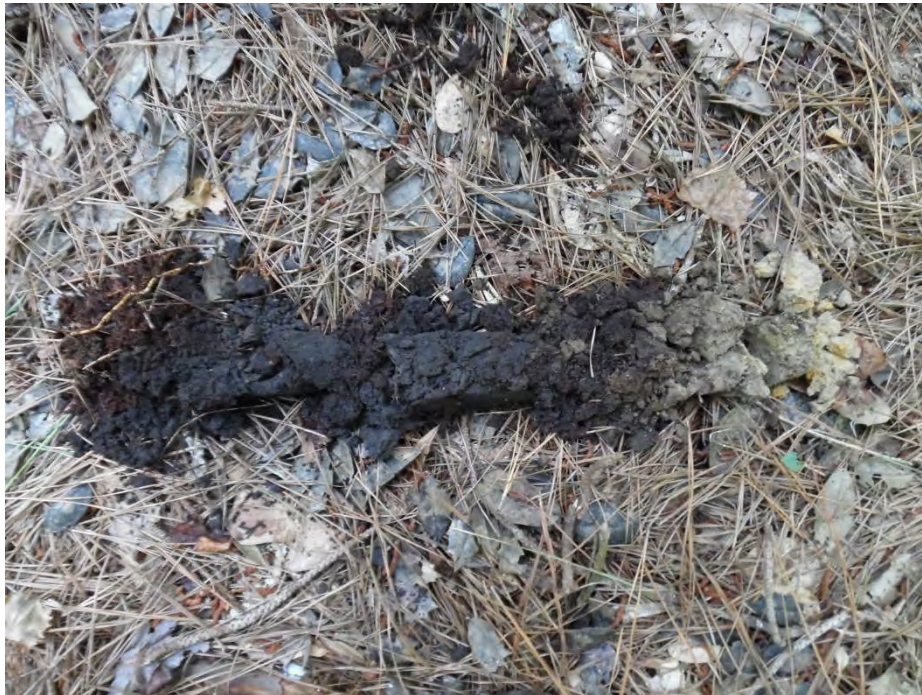
Upland data point wsol034_u soil sample