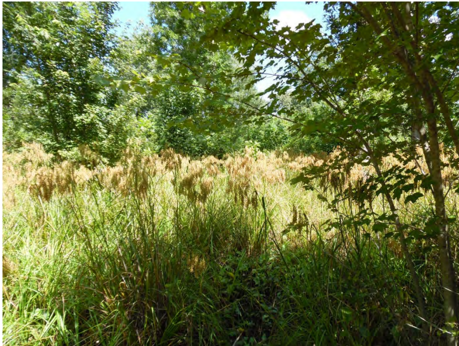
Wetland data point wsol029s_w facing north