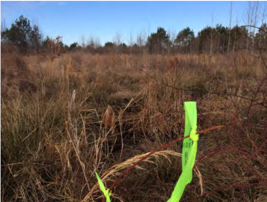
Photo 2 Wetland data point wsoa026e_w facing west