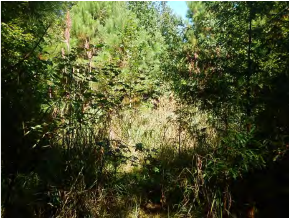
Photo 2 Wetland data point WSOA003f_w facing north