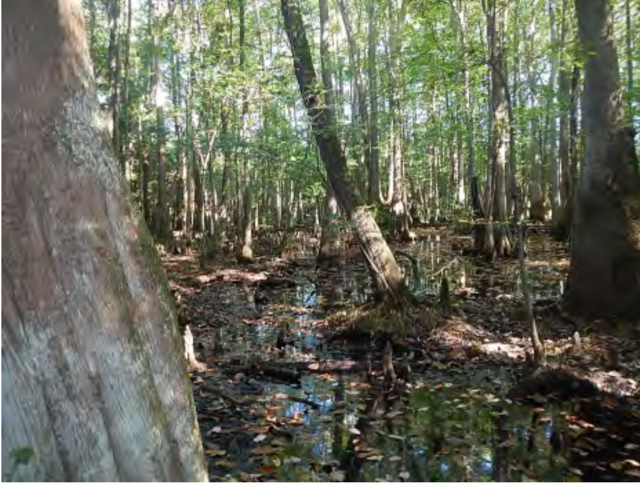
Photo 1 Wetland data point WSOA002f_w facing north