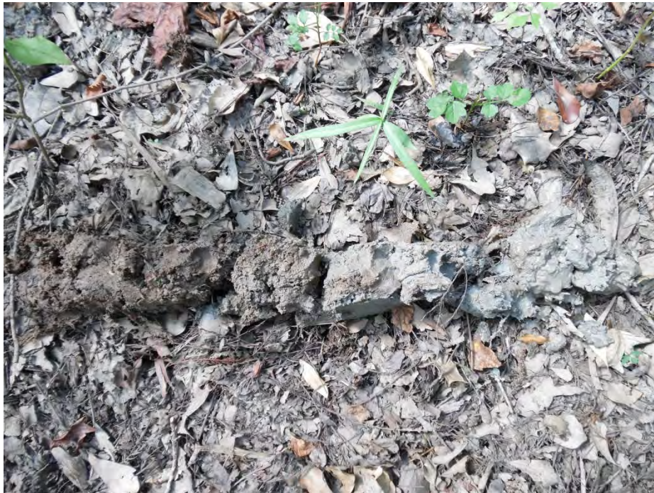
Wetland data point wsol026f_w soil sample