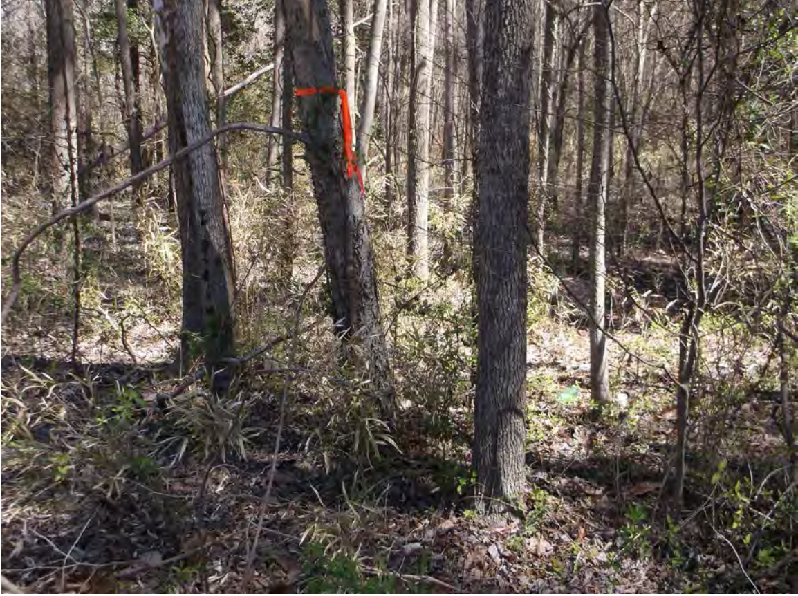
Wetland data point wsop001f_w facing east.