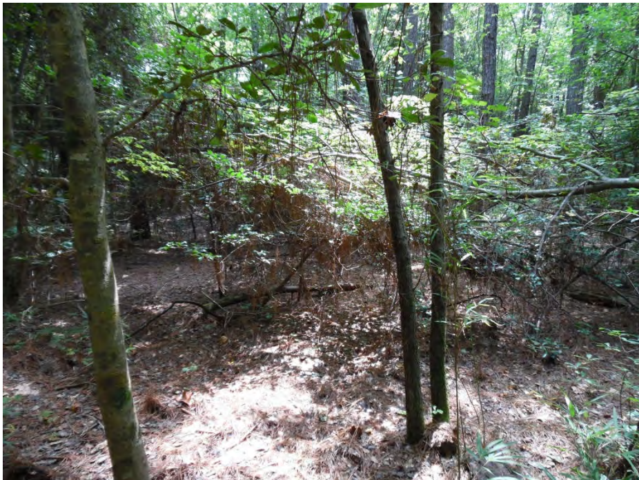
Upland data point wsol034_u facing east