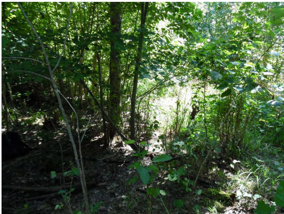
Wetland data point wsol028s_w facing south