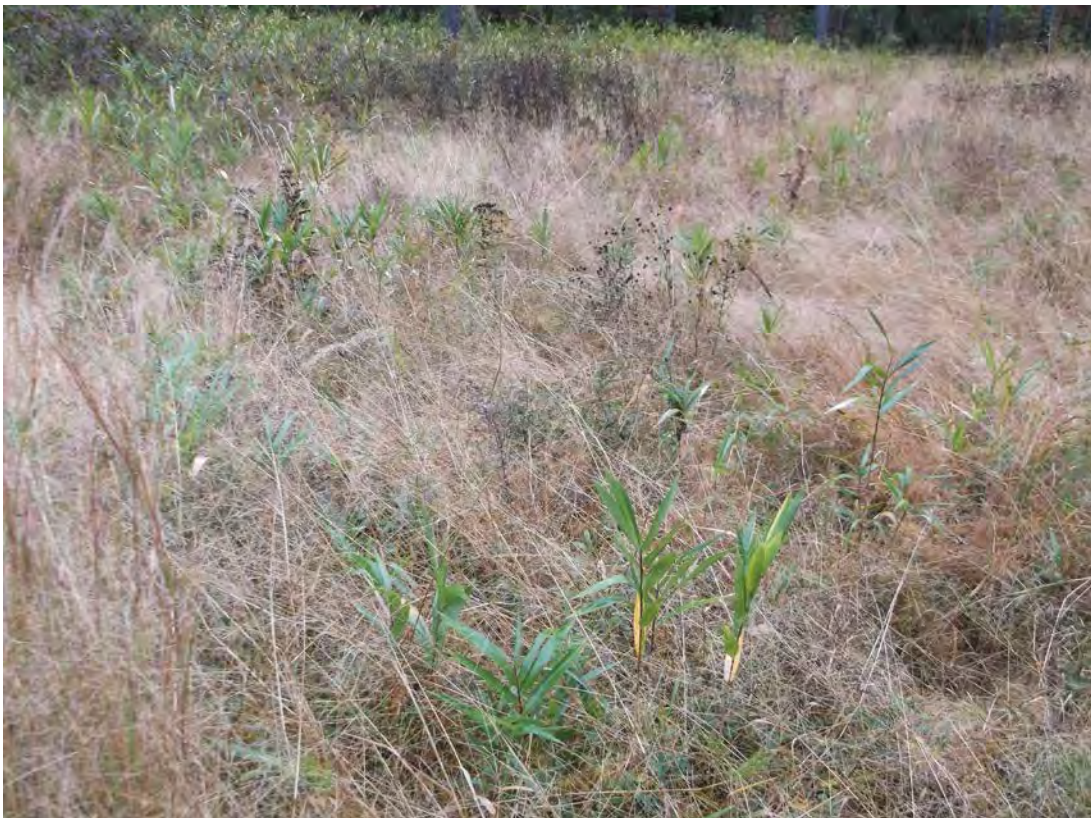
Wetland data point wsop100e_w facing southeast.