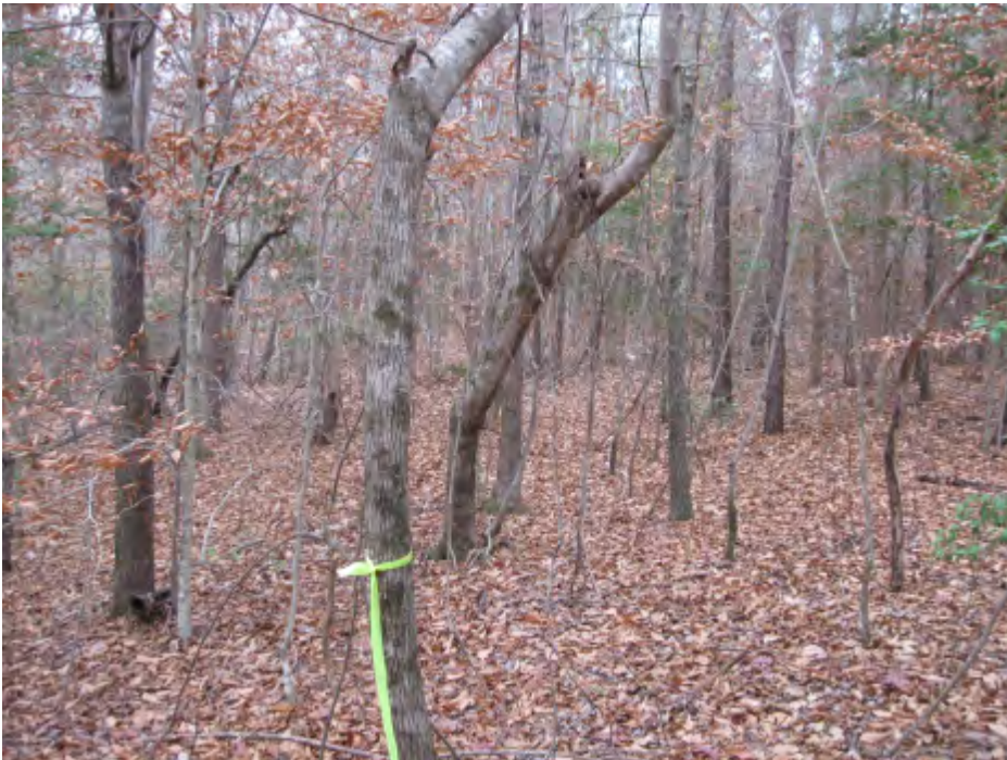
Photo 2 Upland data point wsoa023_u facing north