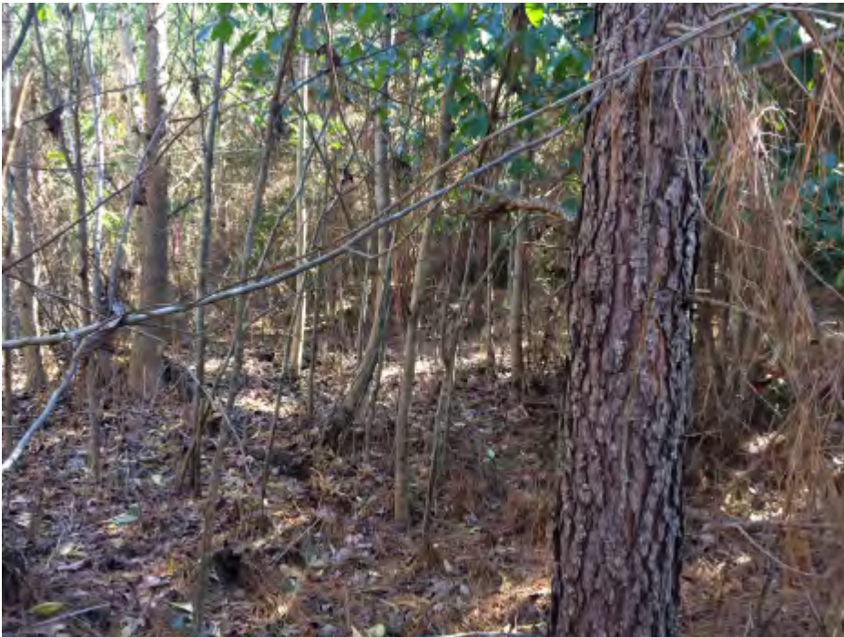
Photo 2 Upland data point wsoa028_u facing south