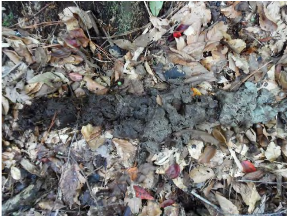
Wetland data point wsol022f_w soil sample