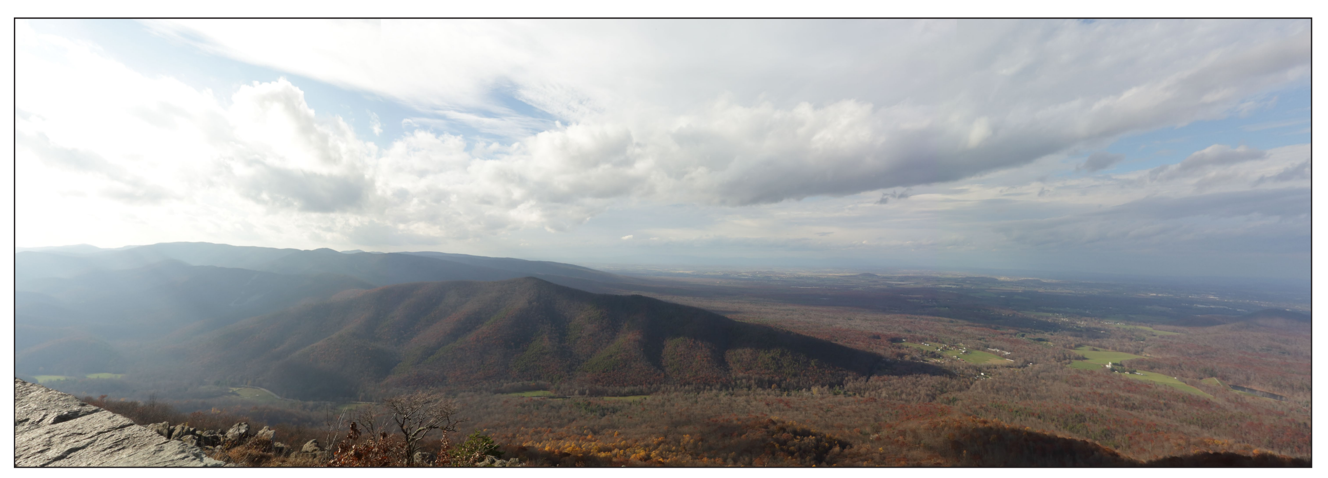
KOP38 - Raven's Roost, Blue Ridge Parkway Overlook, Looking Northwest - Existing View