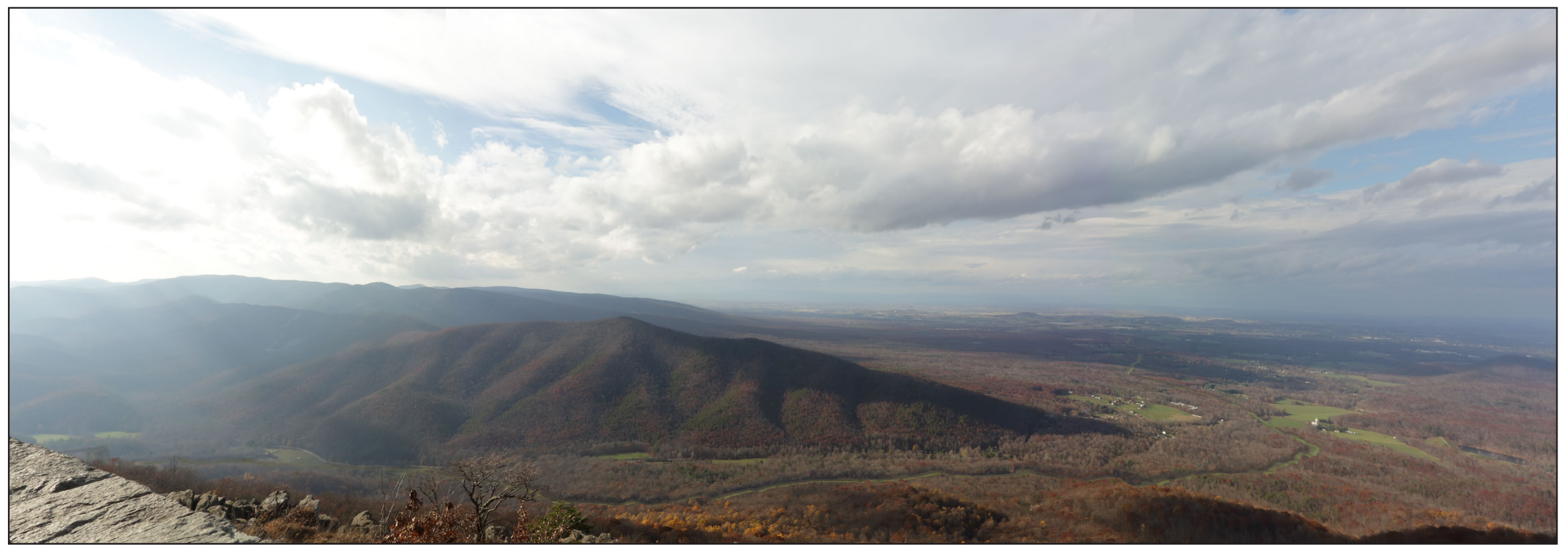
KOP38 - Raven's Roost, Blue Ridge Parkway Overlook, Looking Northwest - Proposed View 50' Permanent ROW (5 Year Tree Growth)