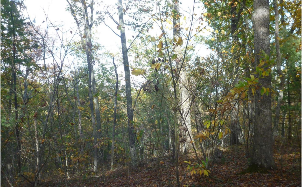
SSF 04: Loop Road (Public Road 1/10)