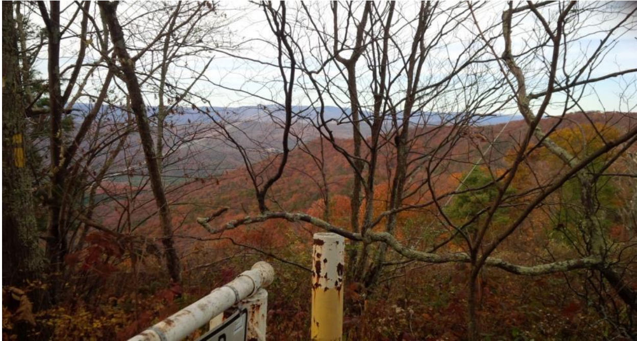
KOP 15: Shenandoah Mountain Trail 4, Looking West (ACP corridor no longer in this view)

Unless otherwise specified, all images are in the general direction of the nearest proposed portions of the ACP corridor.