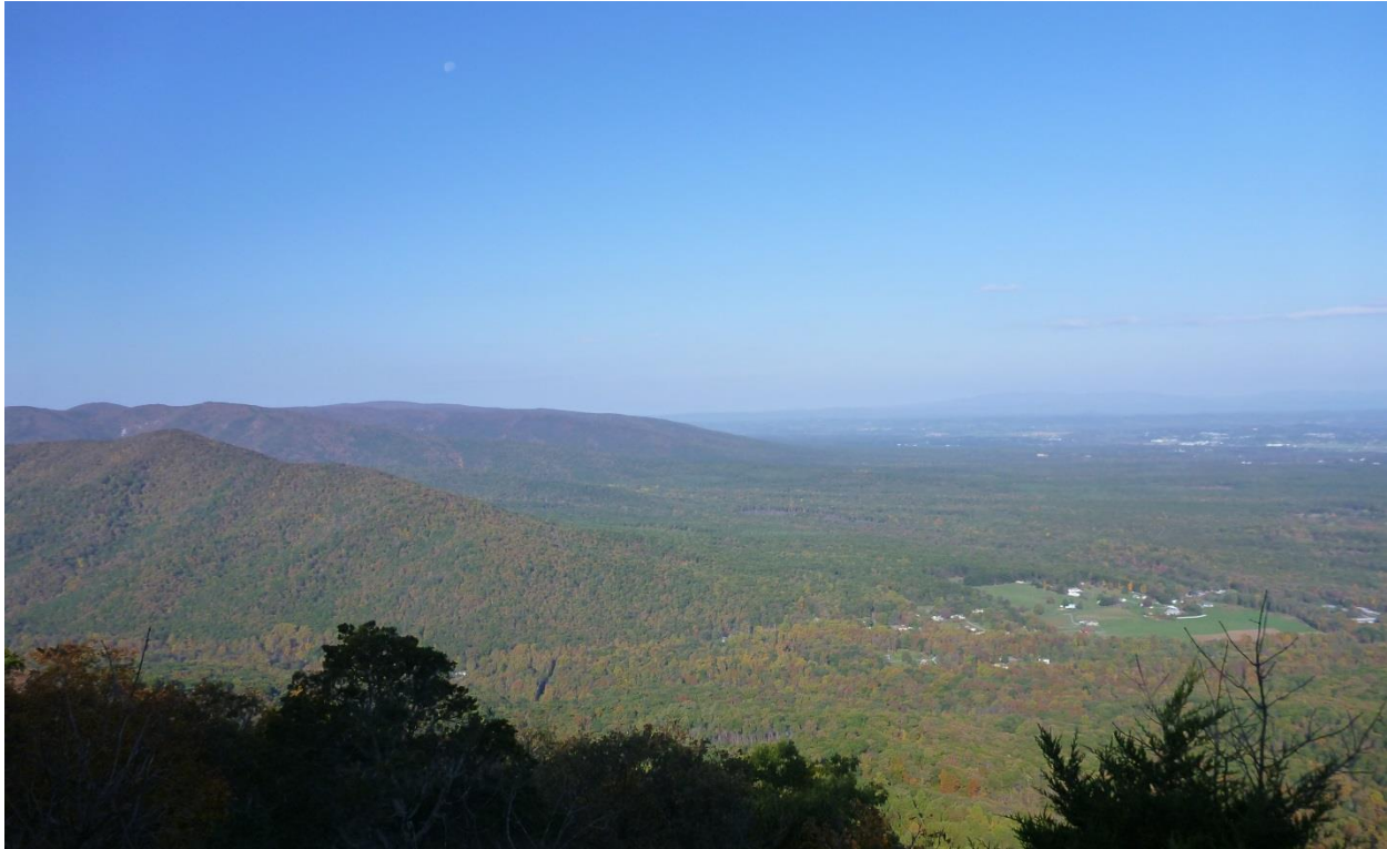
ANST 05: Cedar Cliffs