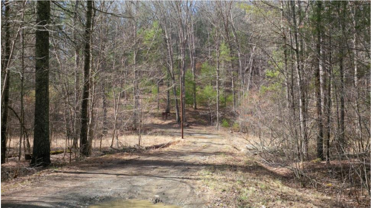
KOP 53: Trailhead of FST 717 (Short Ridge Trail)