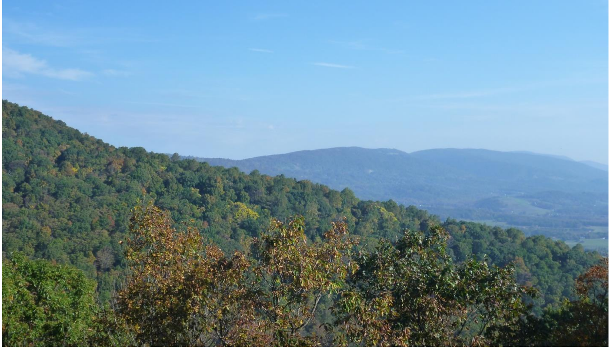
ANST 01: Afton Mountain

Unless otherwise specified, all images are in the general direction of the nearest proposed portions of the ACP corridor.