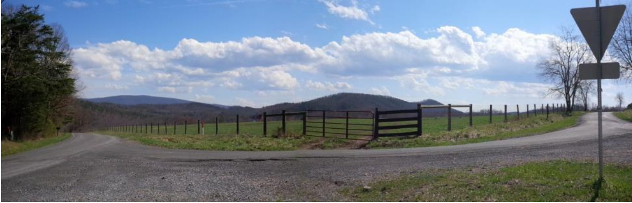
KOP 62: Route 625 at Route 678 (Fort Lewis Area)