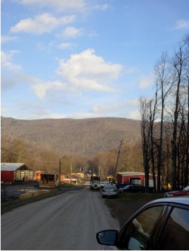
Slaty Fork, WV, looking in the direction of KOP 50. Actual KOP (FR 24) not accessible.