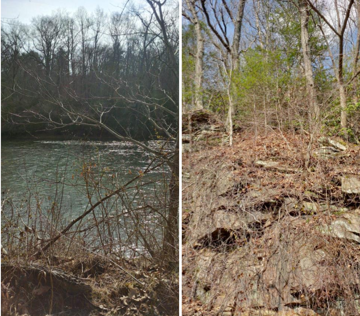
KOP 45: Greenbrier River Trail near ACP Corridor Crossing looking East (left) and West (right) Note: Crossing location has shifted south of this position since photos were taken.