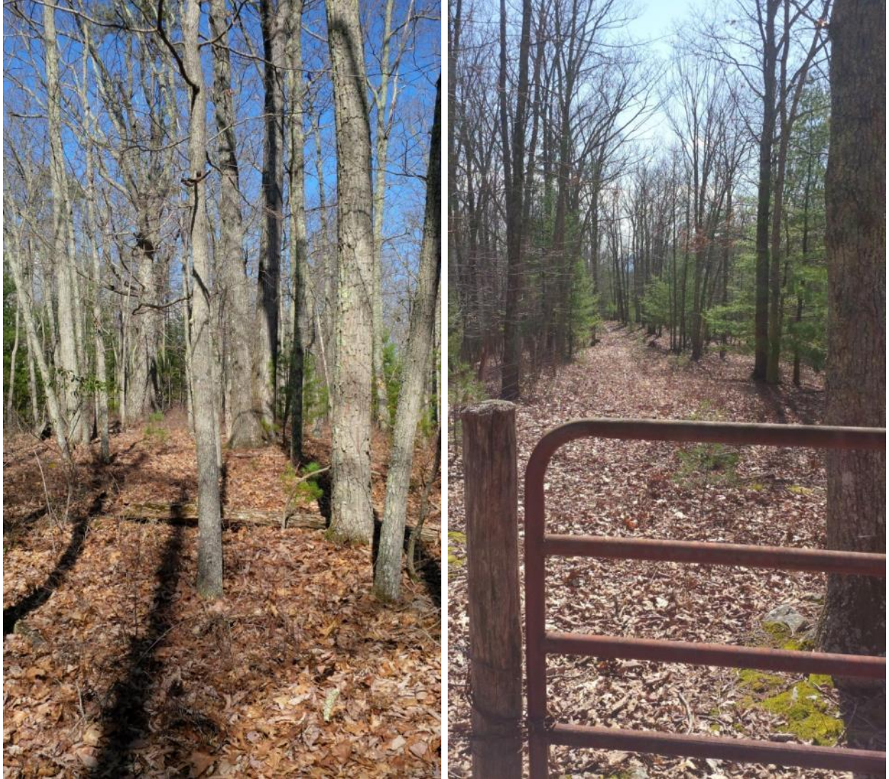
KOP 52: ACP crossing at FST 718 (Brushy Ridge Trail/Back Draft Trail), looking North (left) and South (top)