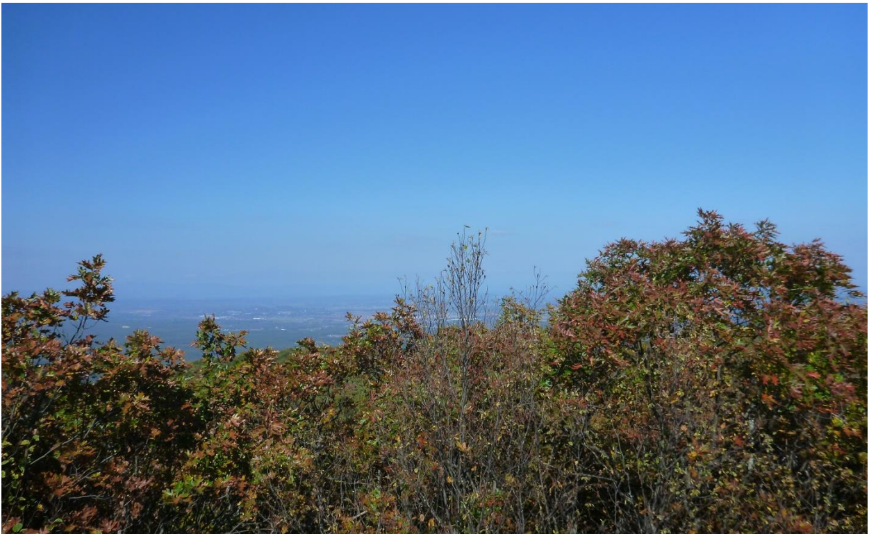
ANST 04: Laurel Springs