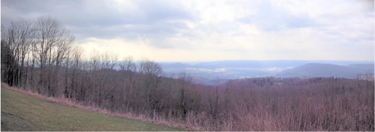
KOP 06: Highlands Scenic Highway near White Low Place

Unless otherwise specified, all images are in the general direction of the nearest proposed portions of the ACP corridor.