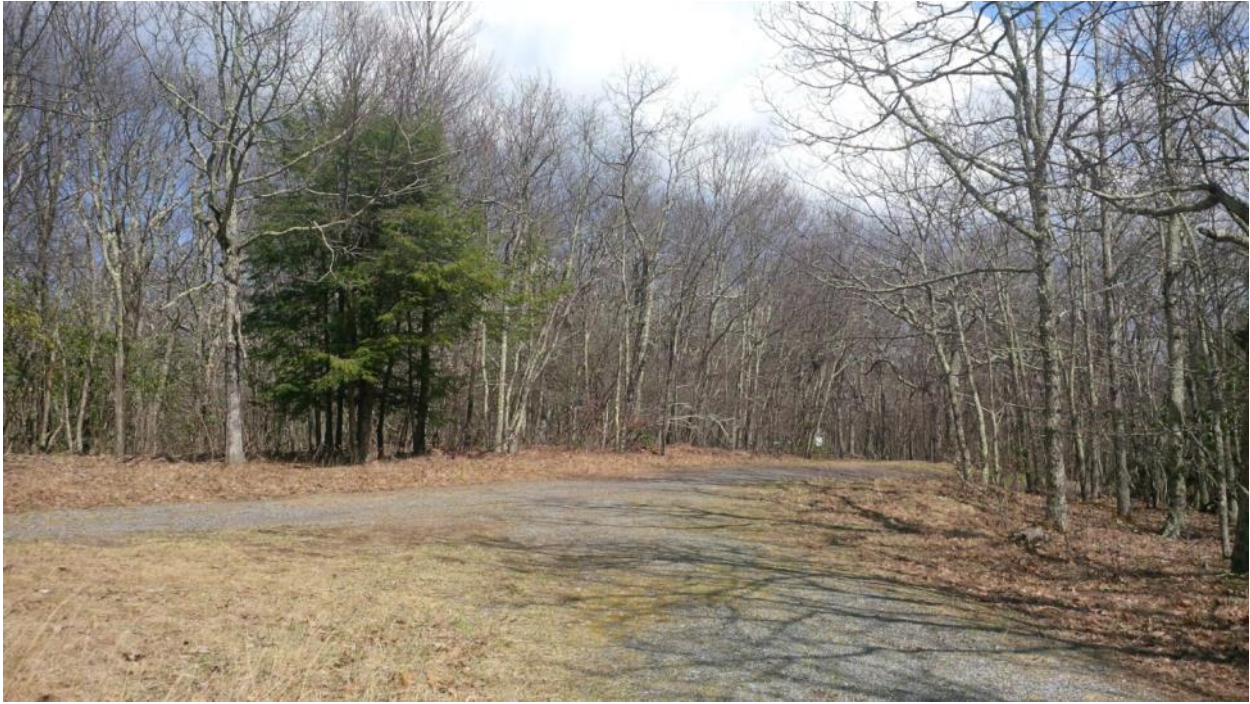
KOP 58: Duncan Knob Lookout