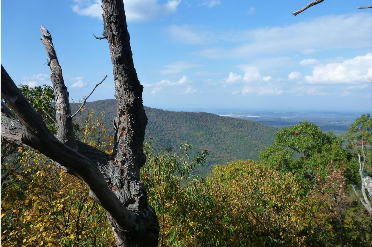
ANST 07: Sherando Valley