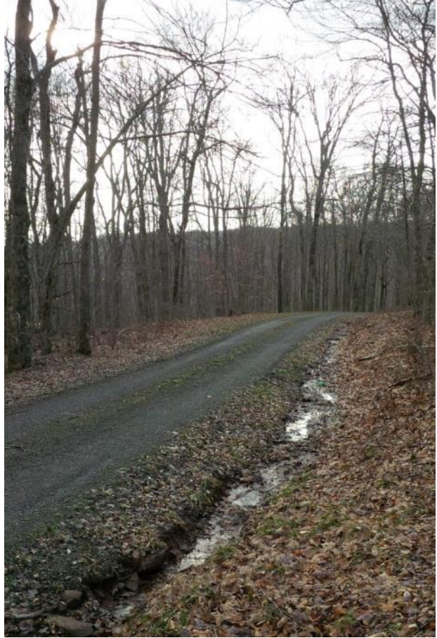
KOP 49: FR 1026