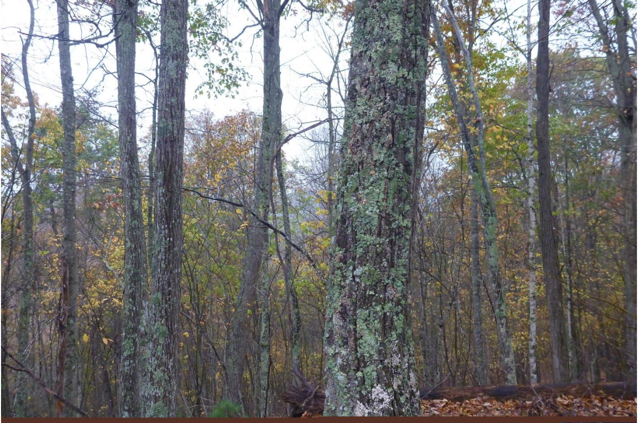
SSF 02:Public Road 1/8