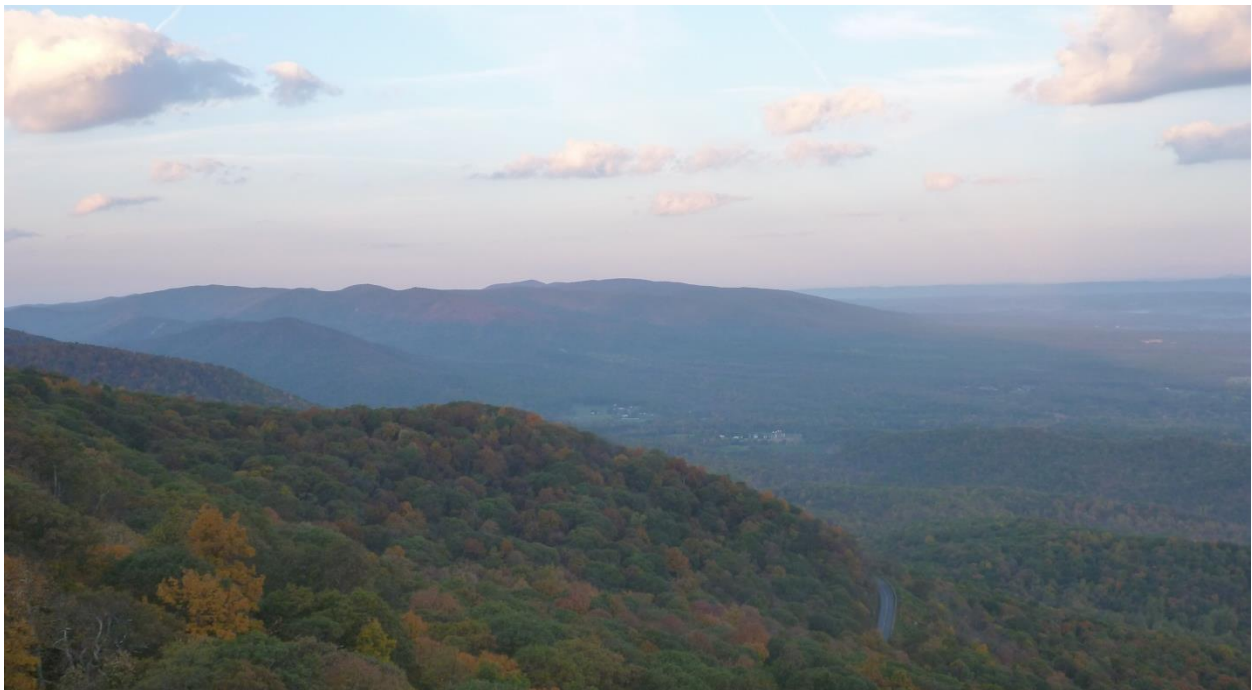
ANST 02: Humpback Rocks