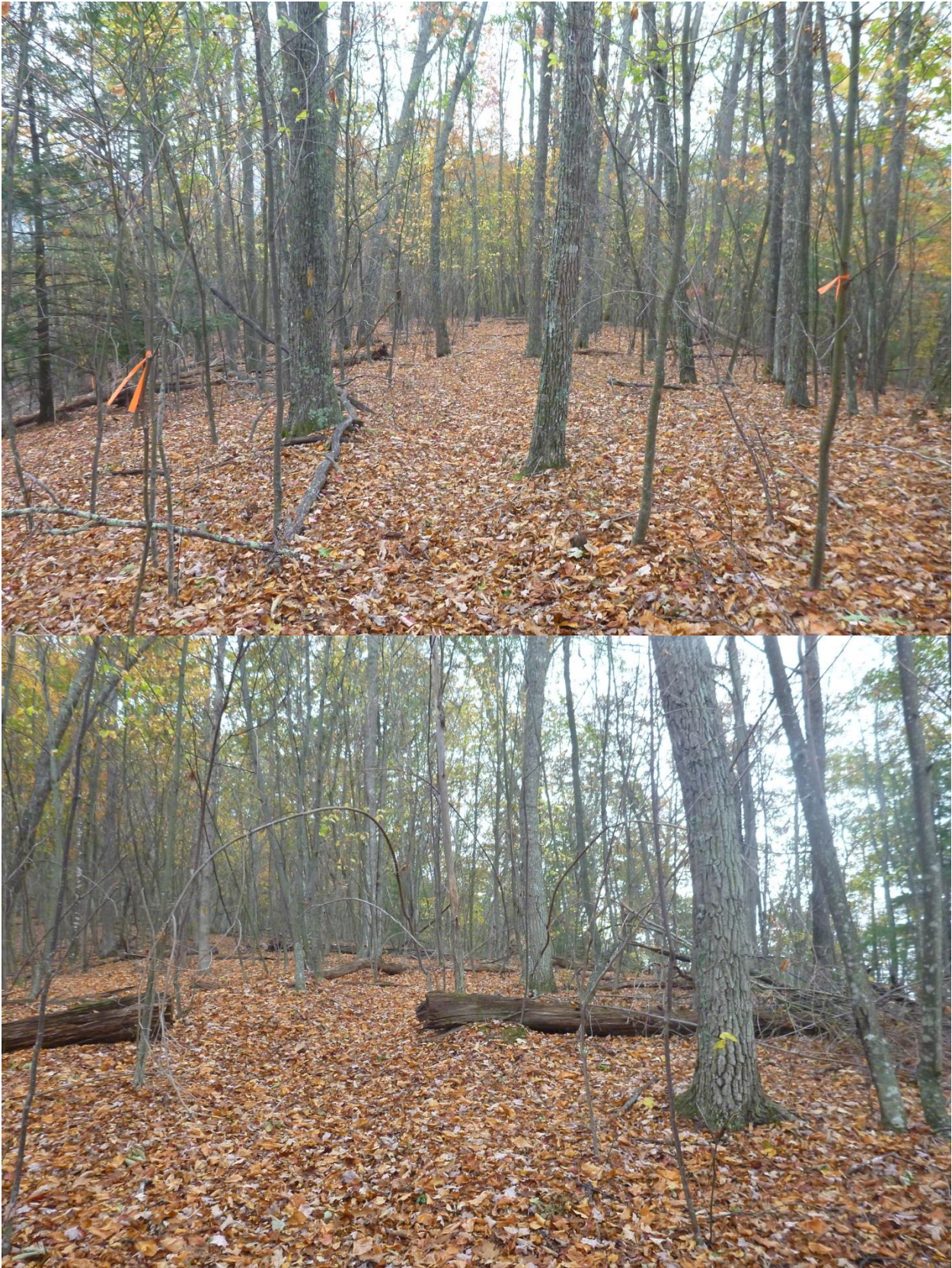
SSF 05: Allegheny Trail Looking East (top) and West (bottom)