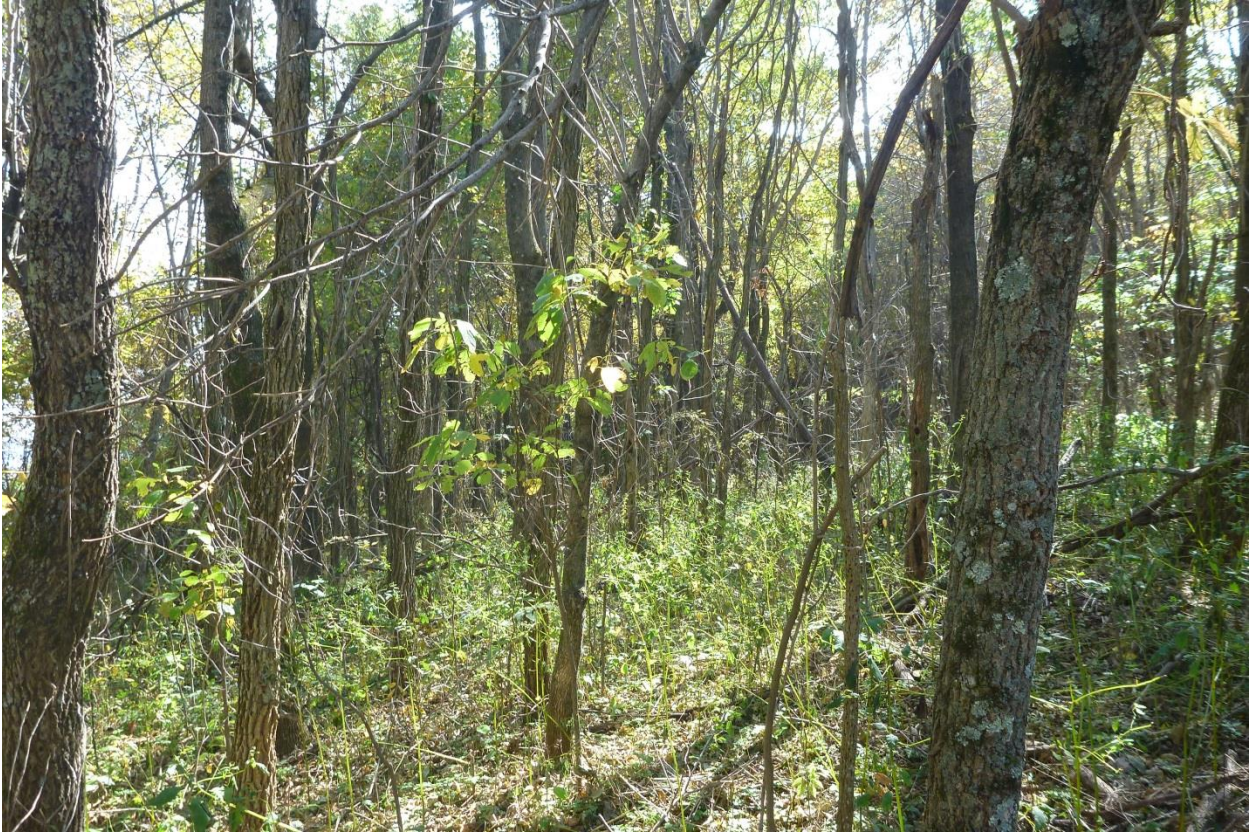
ANST 08b: Three Ridges Overlook (South)—Original Location Identified by NPS