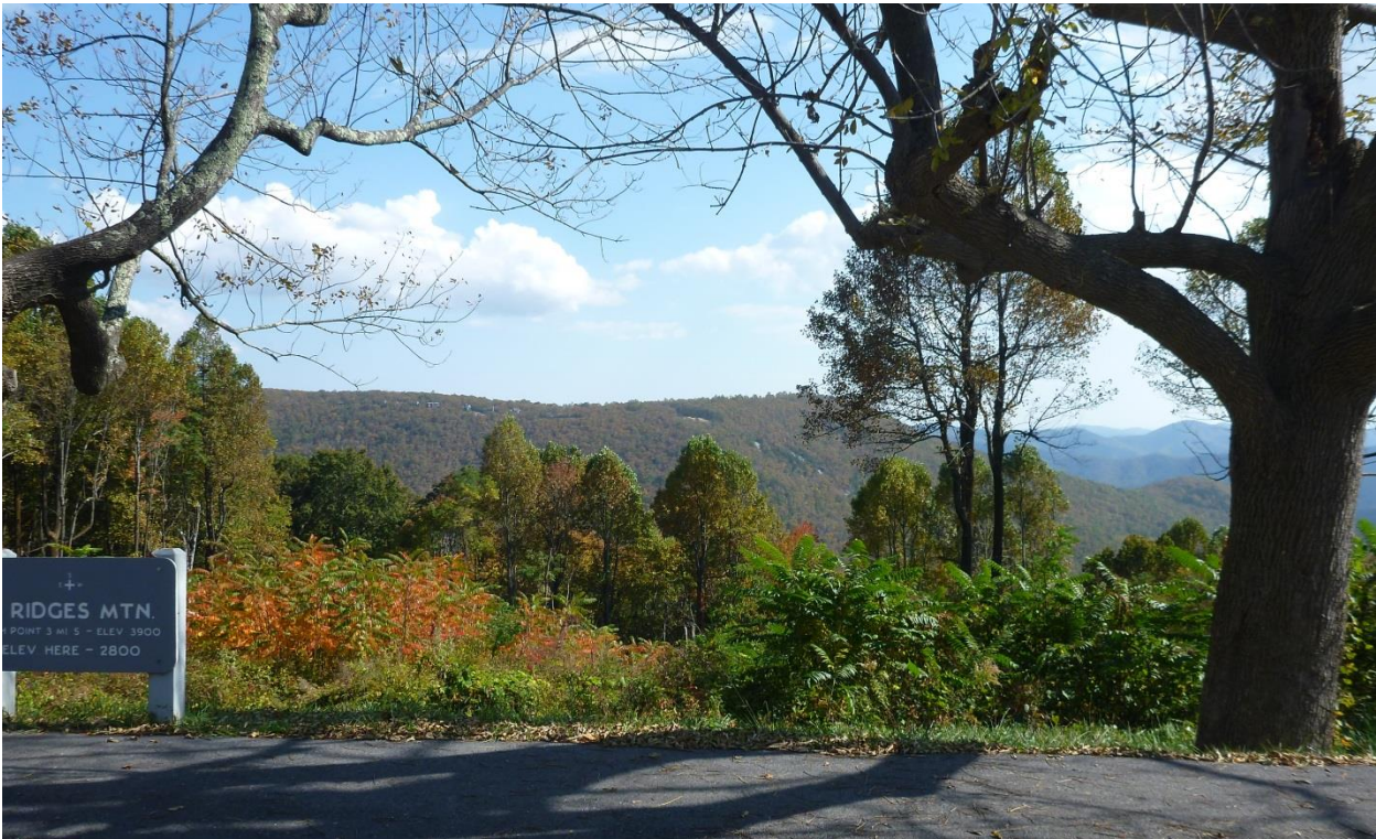
KOP 39: Three Ridges Overlook