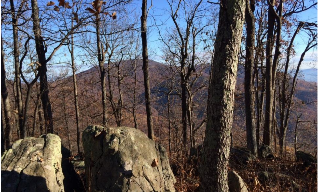
KOP 40: Bee Mountain (Appalachian Trail)