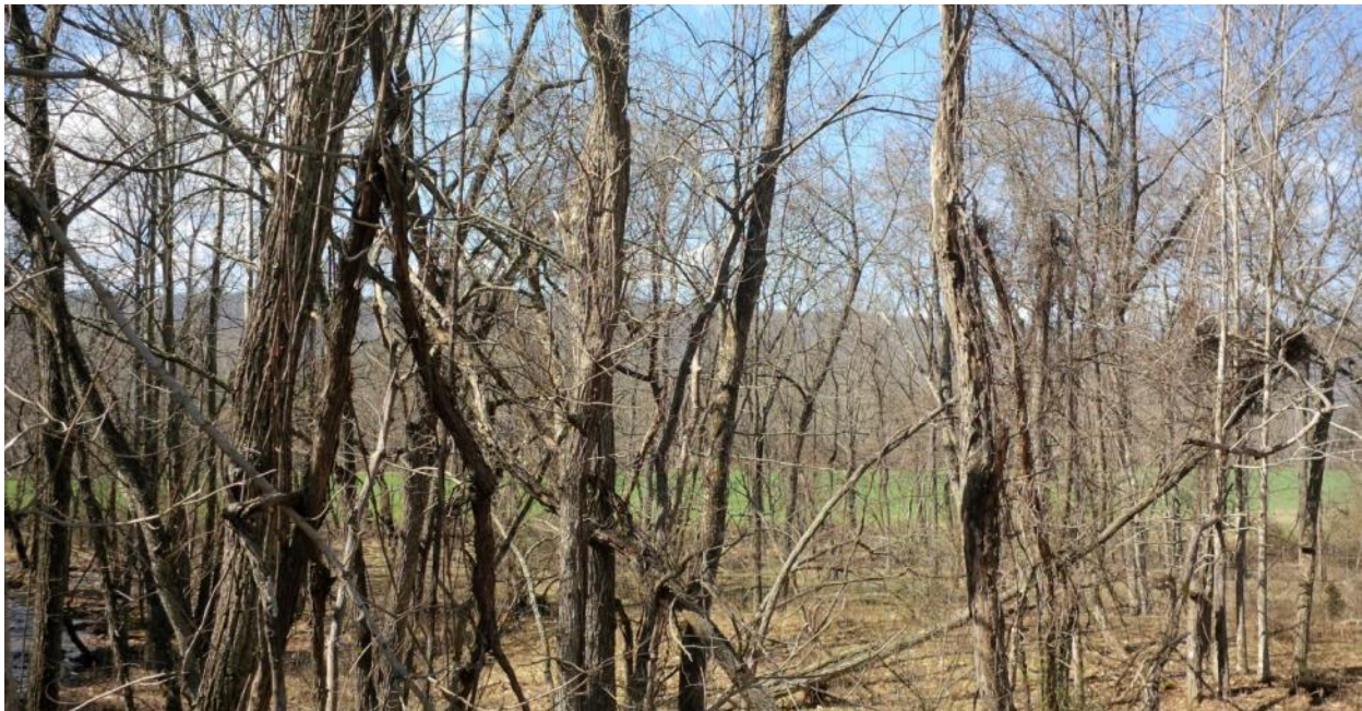
KOP 63: ACP corridor in vicinity of Cowpasture River crossing (looking west)