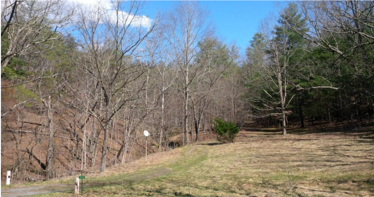
KOP 64: Near Southern Terminus of Shenandoah Mountain Trail