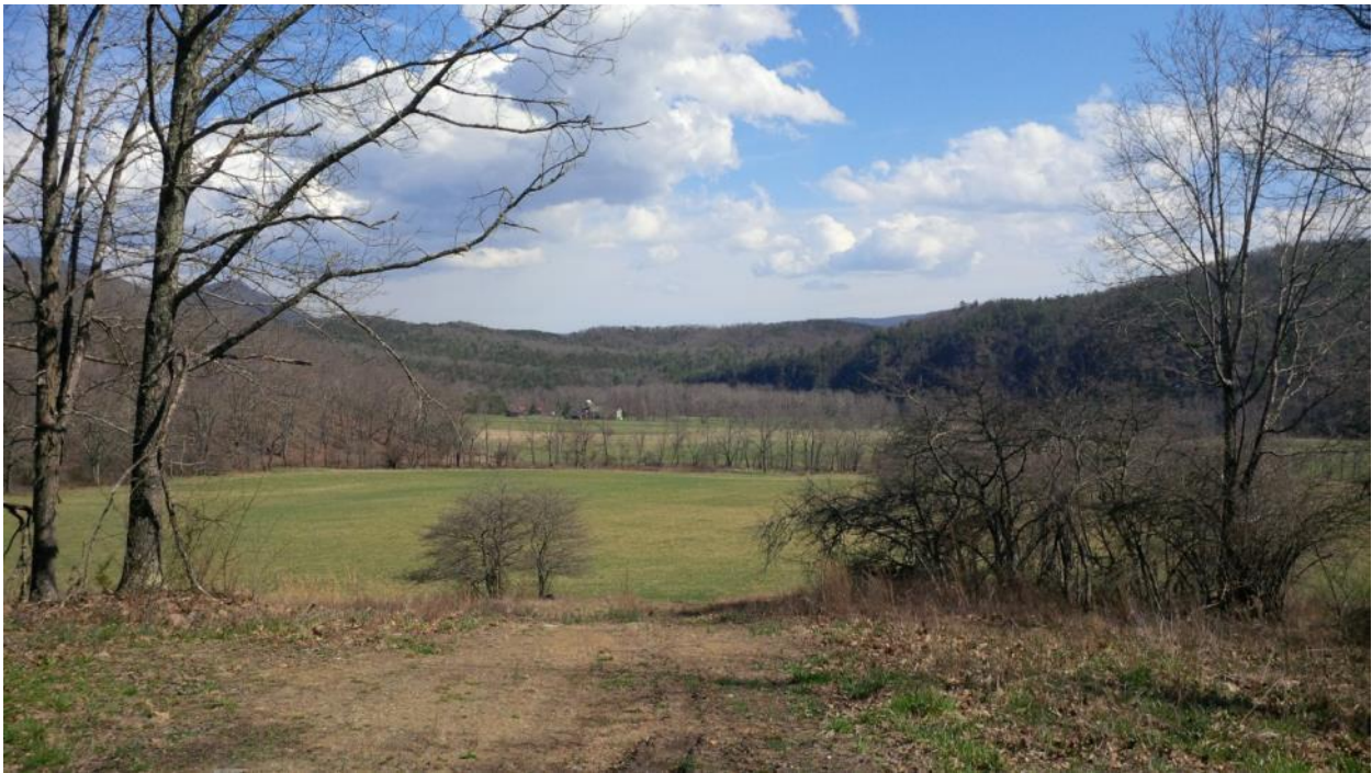
KOP 61: Route 624 at Route 625 (Fort Lewis Area)