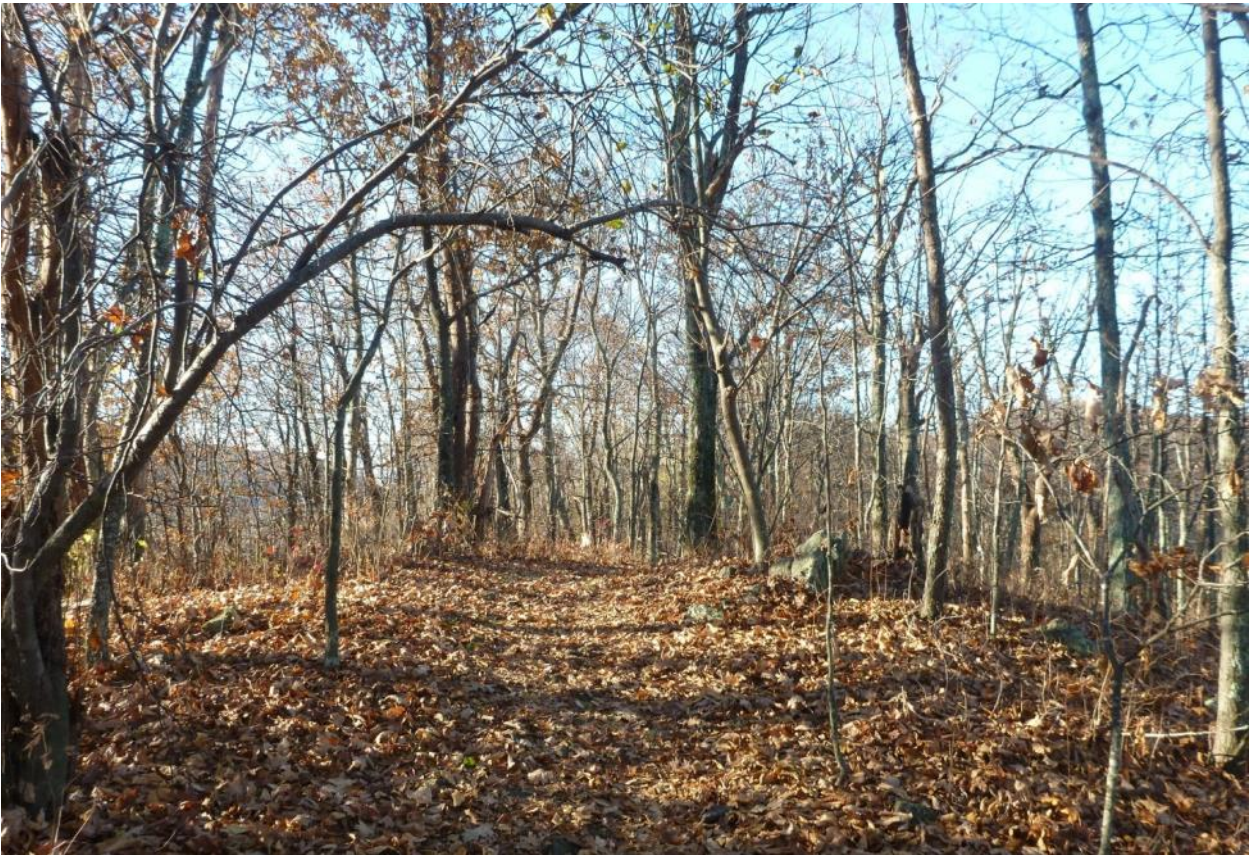
KOP 41: Three Ridges ridge top, Three Ridges Wilderness Area