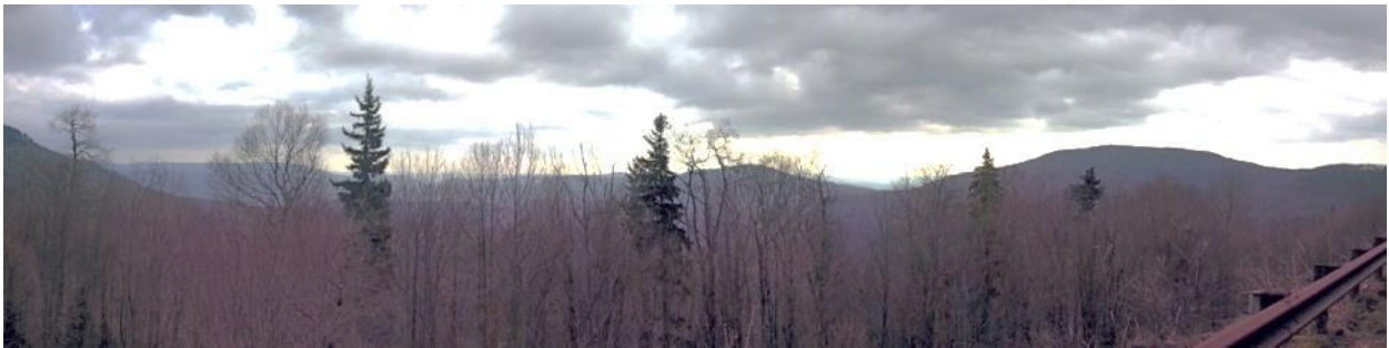
KOP 42: Highlands Scenic Highway at Red Lick Scenic Overlook