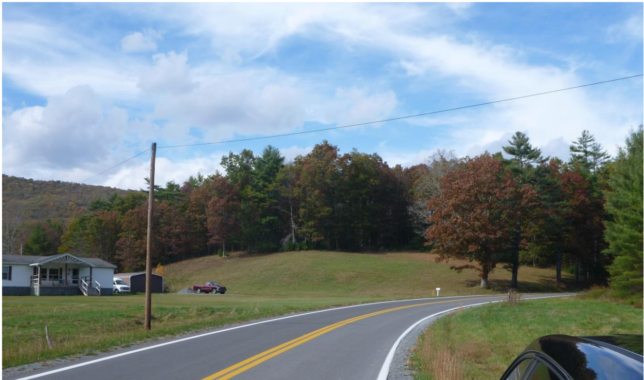
SSF 08: WV Route 92