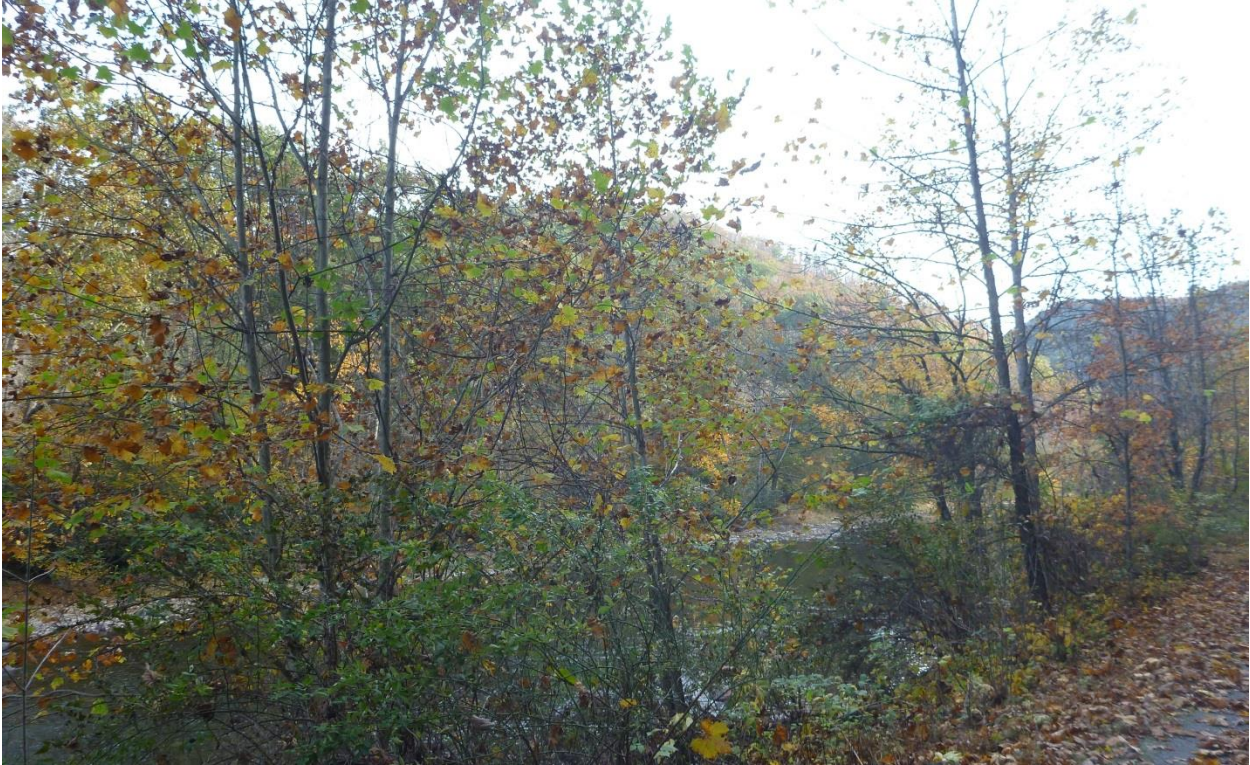
SSF 01: Greenbrier River

Unless otherwise specified, all images are in the general direction of the nearest proposed portions of the ACP corridor.