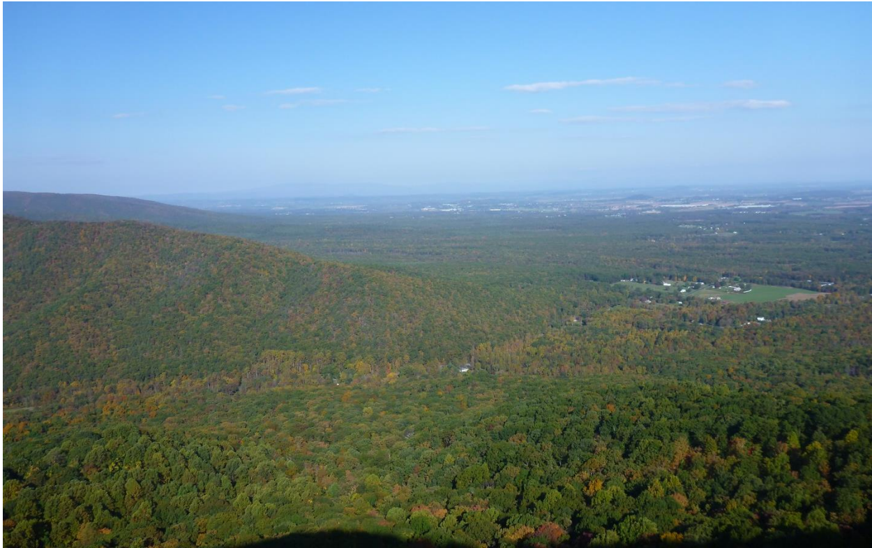
ANST 06: Little Ravens Roost