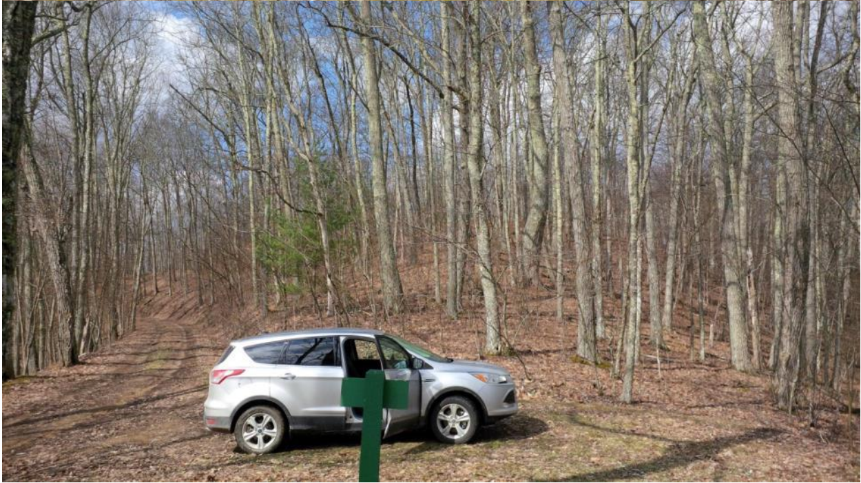
KOP 46: Allegheny Trail Crossing, looking East (top) and West (bottom)