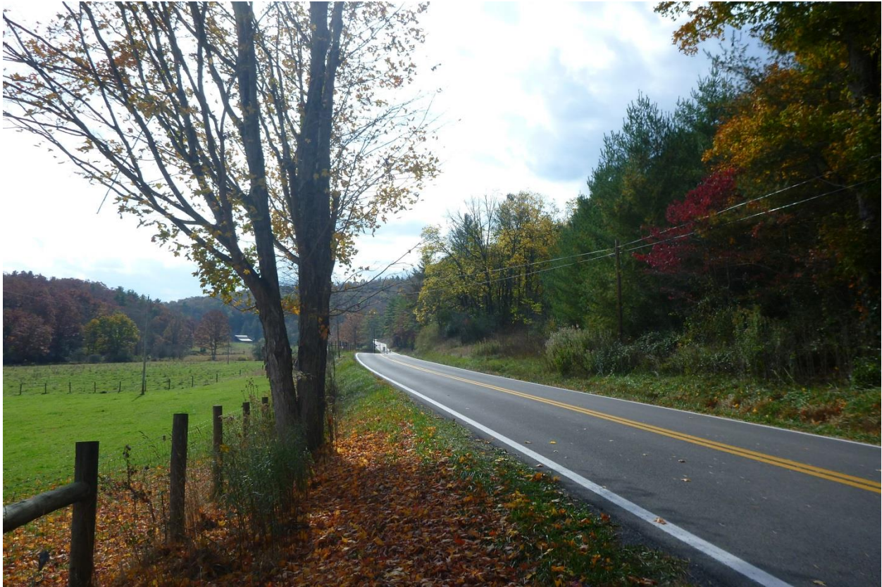
SSF 06: WV Route 28