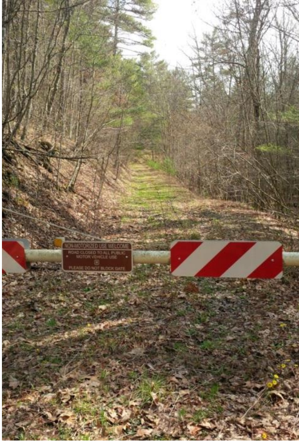
KOP 47: Entrance to FR 1012 (view of ACP Corridor not accessible)