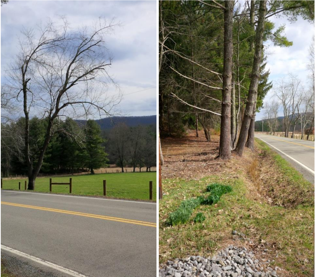
KOP 44: WV 28 at ACP Crossing, Looking East (left) and Northwest (right)