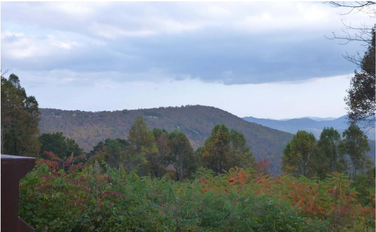
ANST 08a: Three Ridges Overlook (North)