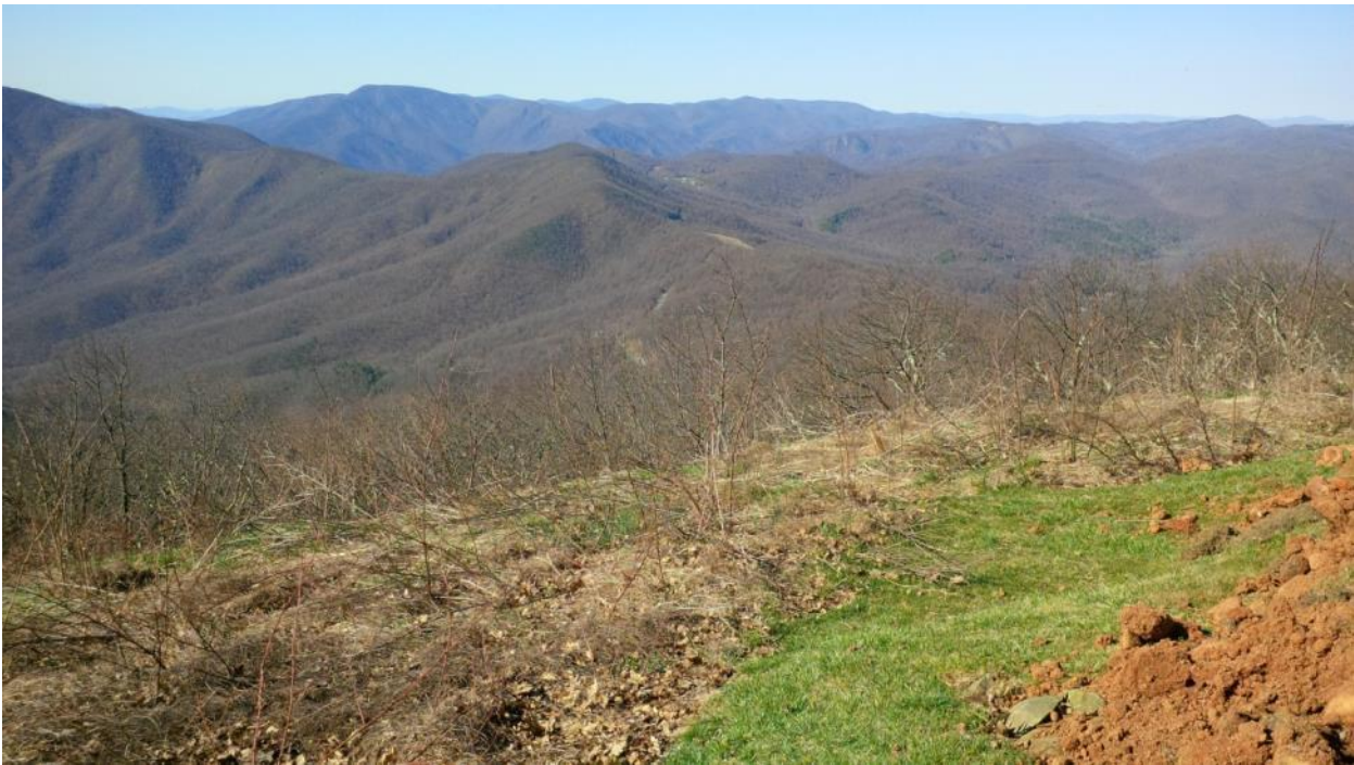
KOP 65: Devil's Knob Overlook, Wintergreen Resort