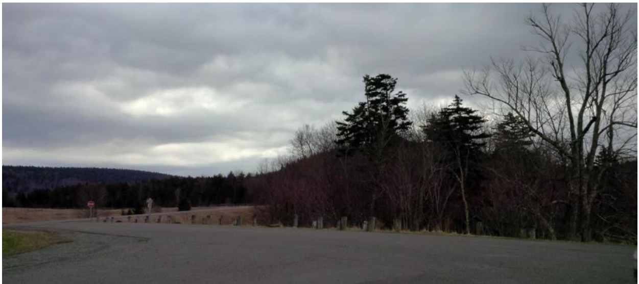
KOP 43: Highlands Scenic Highway at Little Laurel Scenic Overlook