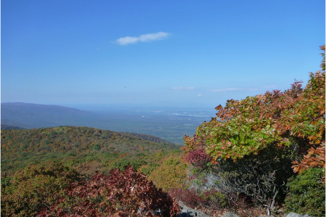
ANST 03: Battery Cliffs